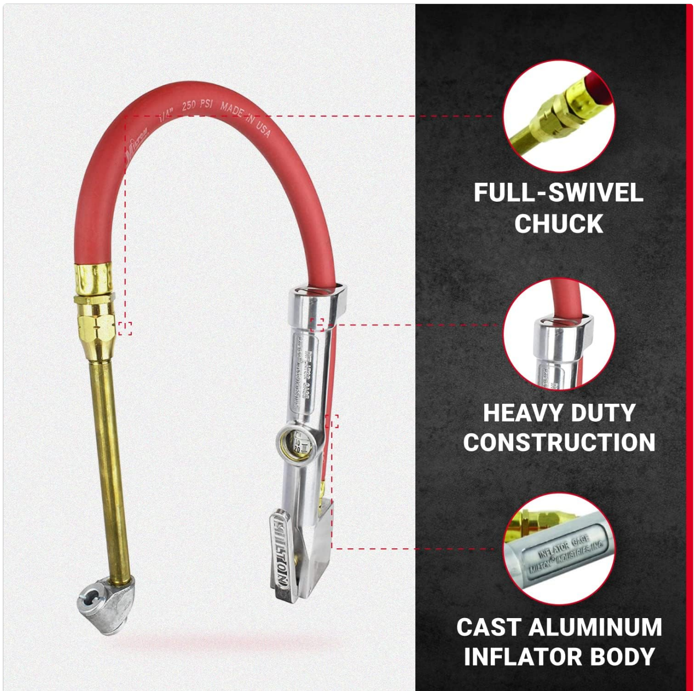
Figure 2: Key features of the Milton S-506, highlighting the full-swivel chuck, heavy-duty construction, and cast aluminum inflator body.