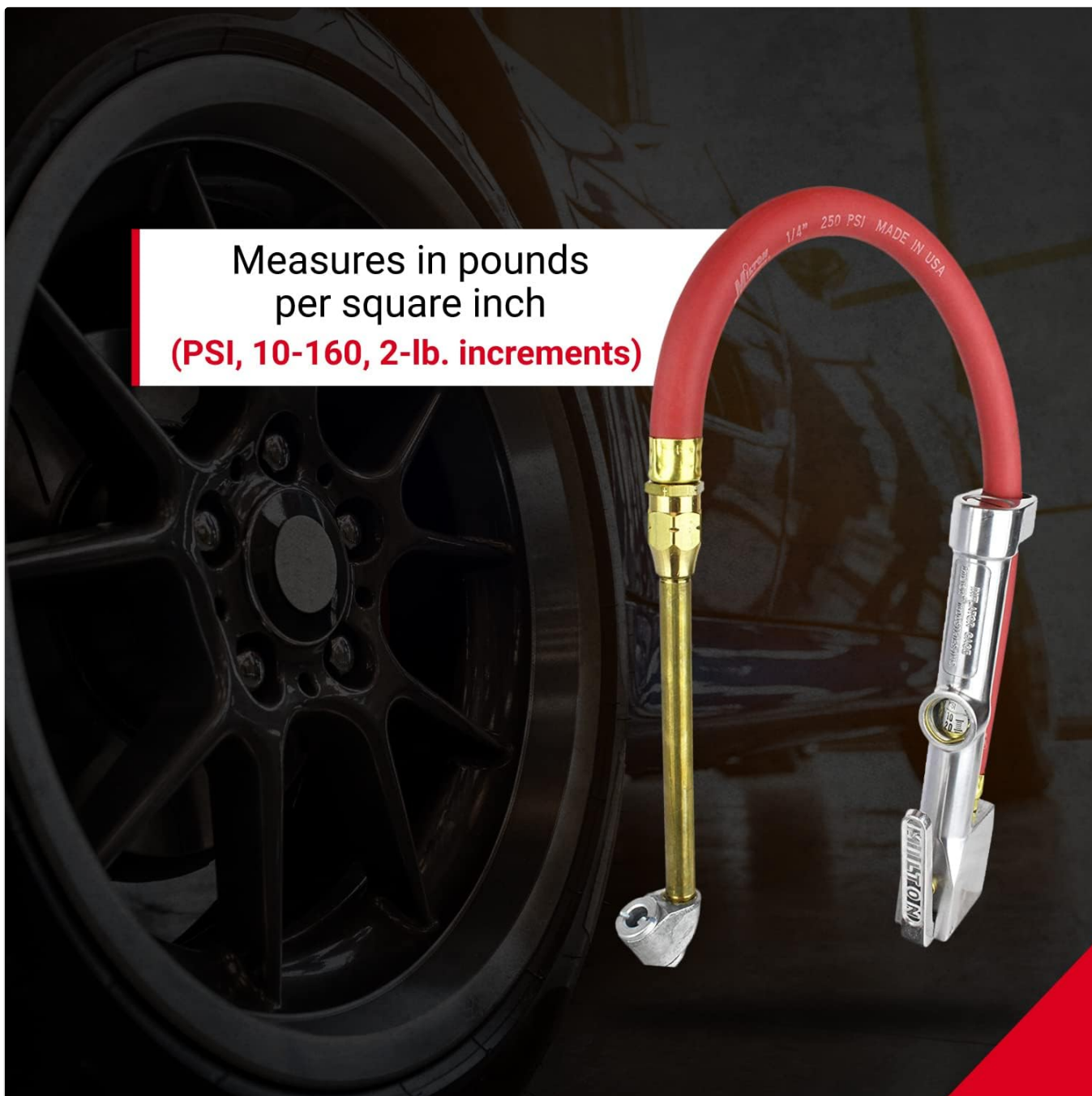
Figure 3: Measuring tire pressure with the Milton S-506.

Press the dual head chuck firmly onto the tire's Schrader valve. The gauge will display the current tire pressure. Read the pressure directly from the magnifying window lens.