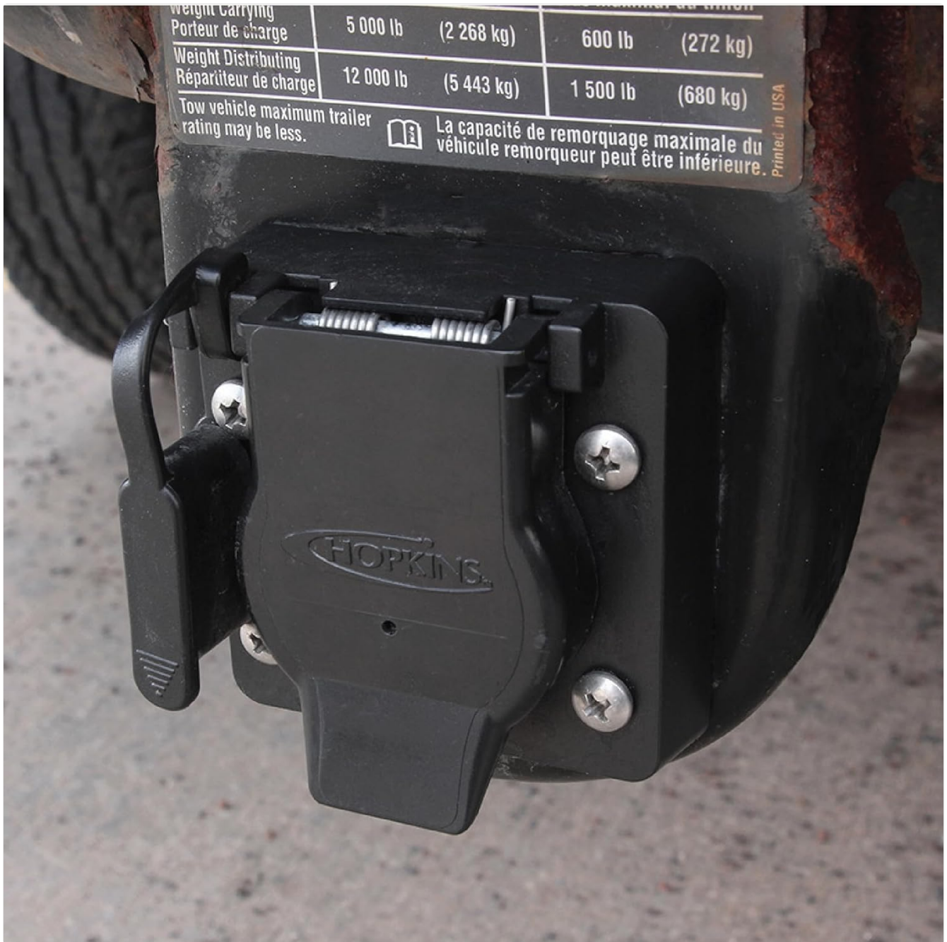
Figure 3: The Multi-Tow adapter shown installed on a vehicle's hitch. This demonstrates a typical mounting position for the adapter, providing easy access for trailer connections.