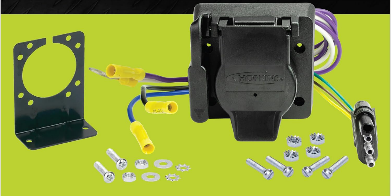
Figure 2: Contents of the Hopkins 47185 Multi-Tow Adapter package. This image shows the pre-wired connector, mounting bracket, and various hardware pieces included for installation.