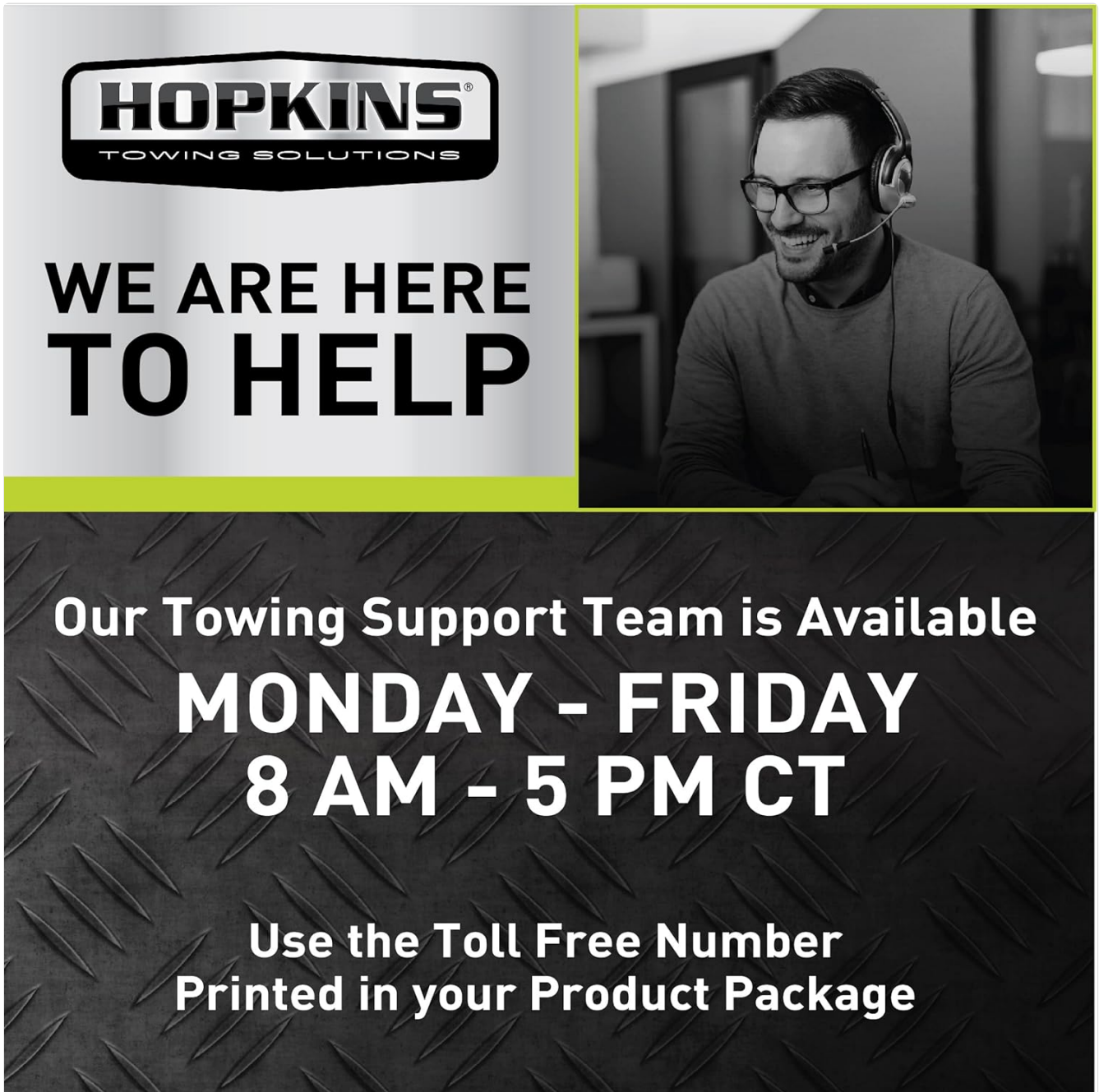
Figure 6: Hopkins Towing Solutions customer support details. This image provides information on how to contact the support team for assistance.