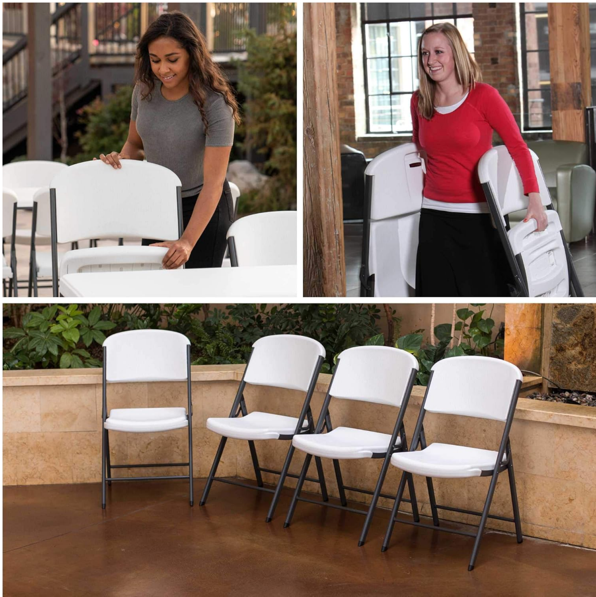
Figure 6: Multiple chairs folded and stacked, illustrating their compact design for efficient storage.