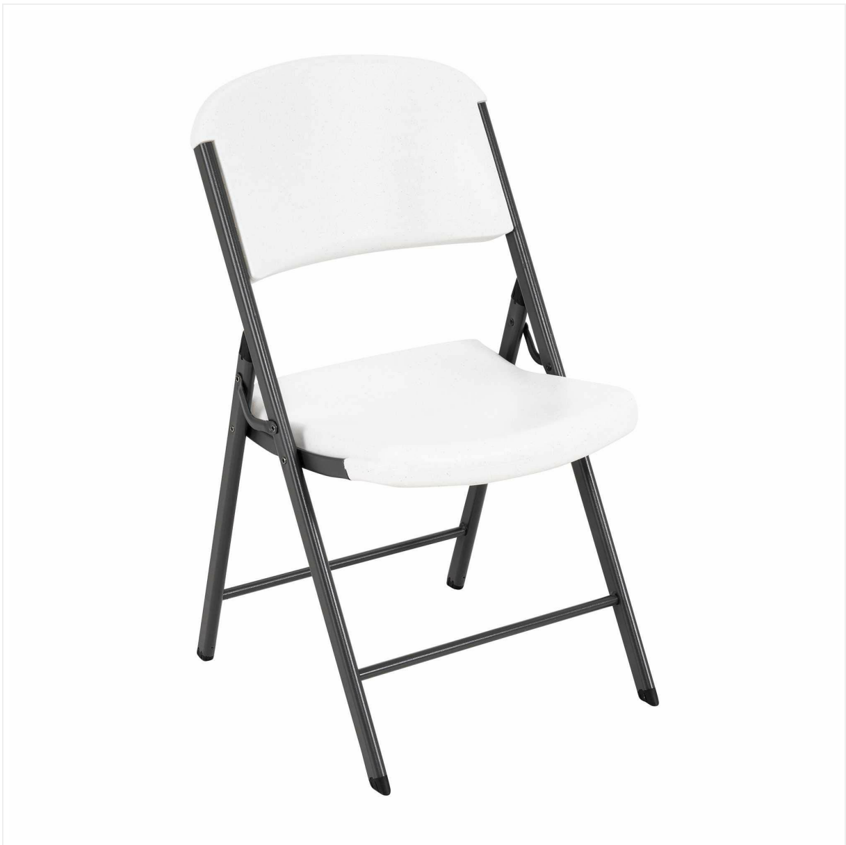
Figure 1: Lifetime 22804 Granite Classic Commercial Folding Chair, showcasing its design and key dimensions.