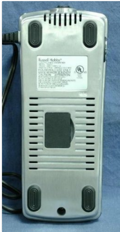
Image: Bottom view of the Russell Hobbs RHKS1 Electric Knife Sharpener, showing the non-slip feet and ventilation.