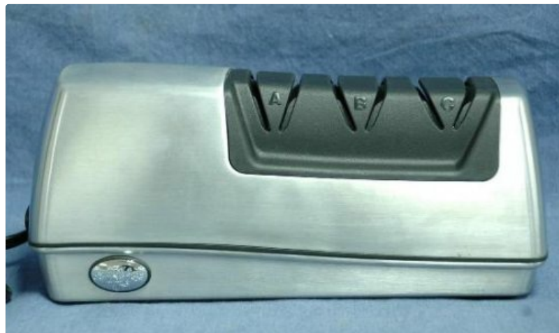
Image: Front view of the Russell Hobbs RHKS1 Electric Knife Sharpener, showing the aluminum housing and the three sharpening slots.

The Russell Hobbs RHKS1 features a robust design with multiple sharpening slots for different stages of sharpening.