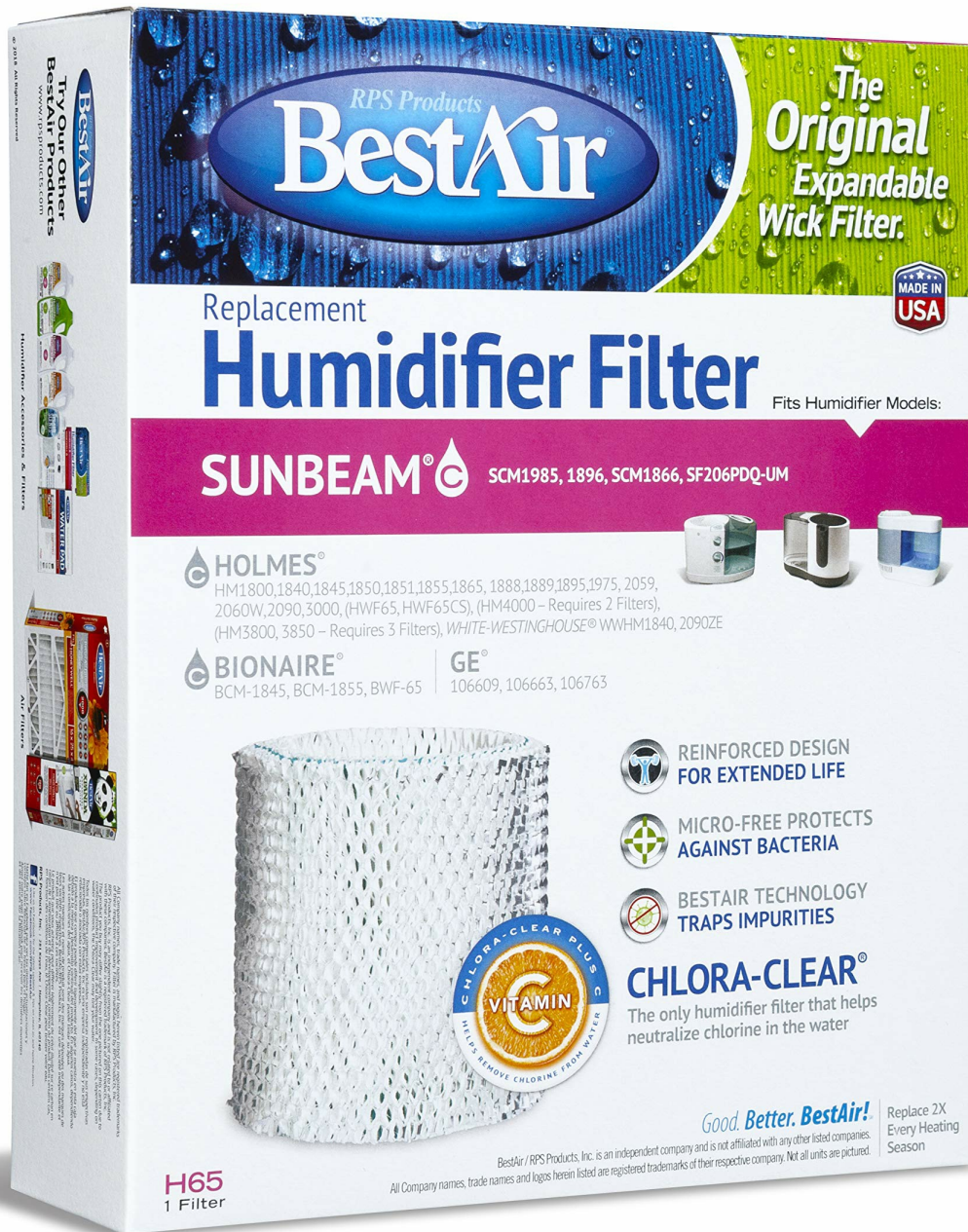
Image 1: The BestAir H65-PDQ-4 humidifier replacement wick filter, shown in its rolled-up form. This filter is designed for extended life and efficient moisture delivery.