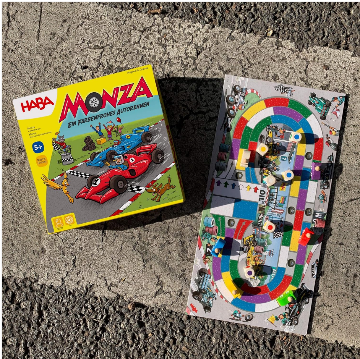
Image 3.1: The HABA Monza game box positioned next to the unfolded game board, illustrating the initial setup before players place their cars.