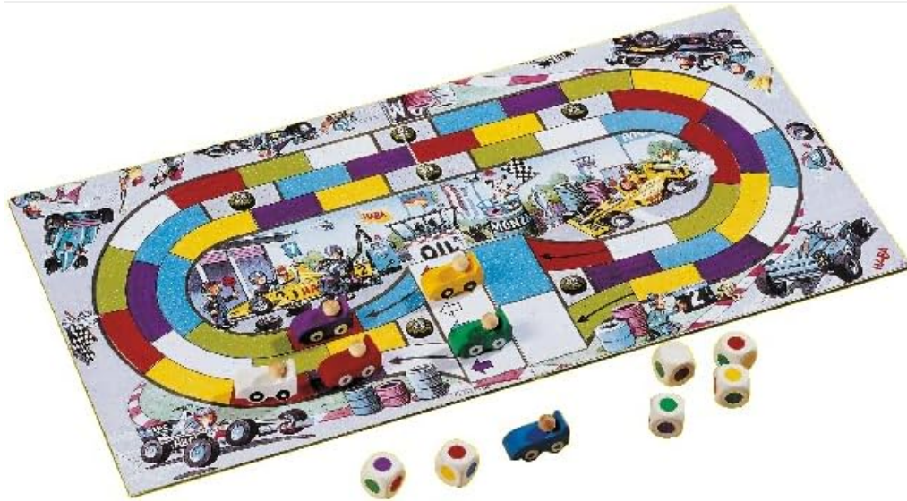
Image 4.1: An overhead perspective of the HABA Monza game board during play, showing multiple wooden cars on the track and the color dice scattered, illustrating active gameplay.

For a more challenging game, players can agree that all six dice must be used for movement if possible. If a player cannot use all six dice, they must use as many as they can. This adds an extra layer of strategic planning.