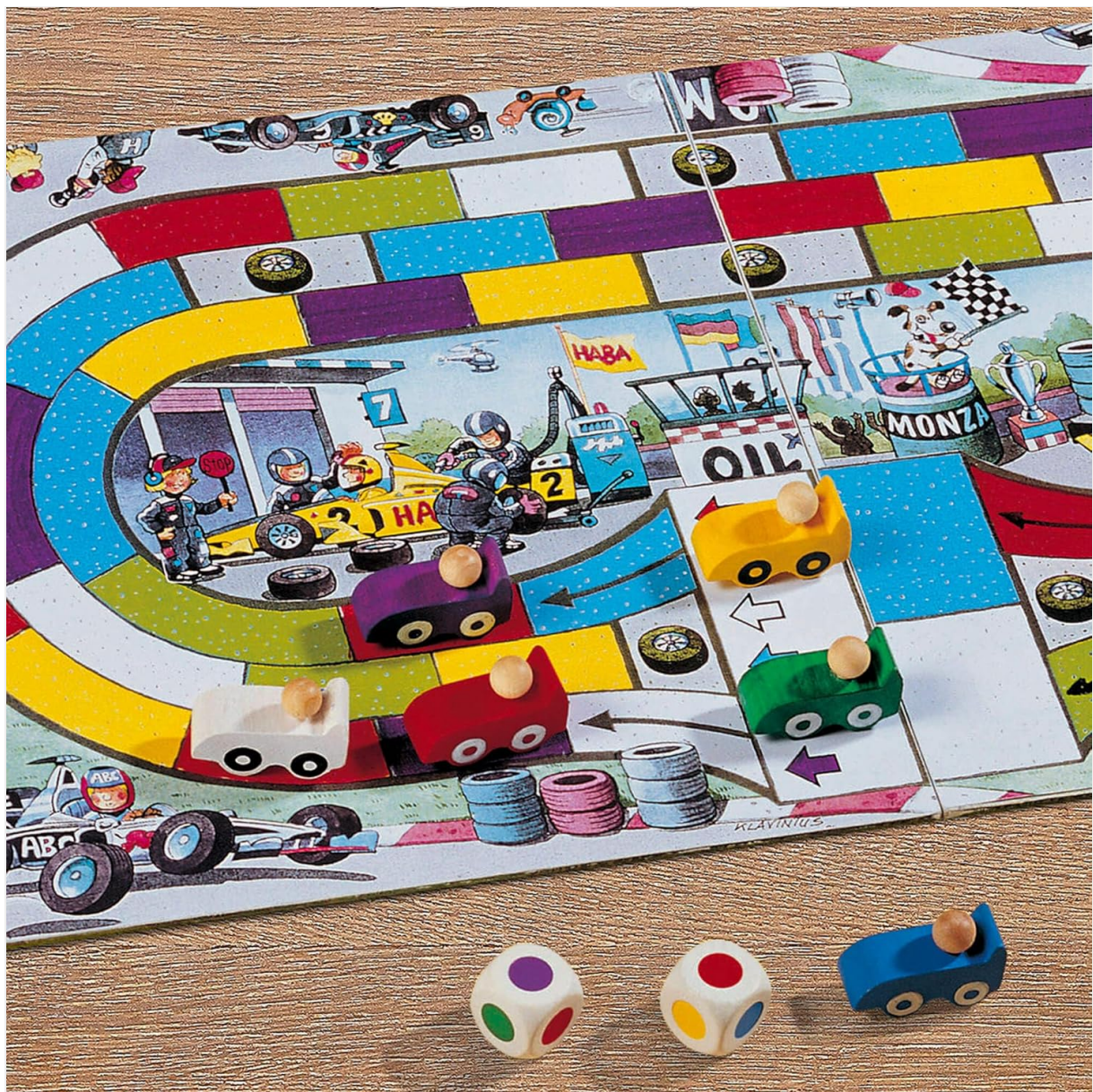
Image 2.1: A close-up view of the HABA Monza game board, showcasing the colorful track, six wooden racing cars, and the six color dice, all ready for play.