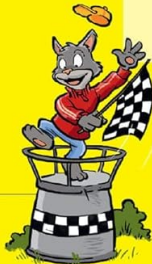
Illustration: Cover: Tobias Dahmen | Spielmaterial: Haralds Klavinius