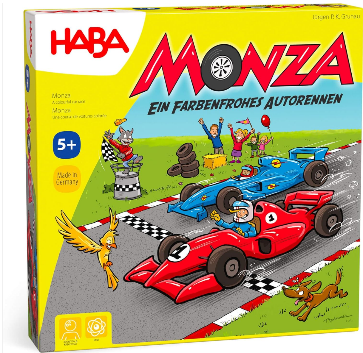
Image 1.1: The HABA Monza game box, featuring vibrant artwork of two race cars on a track, indicating the game's theme and target age group.