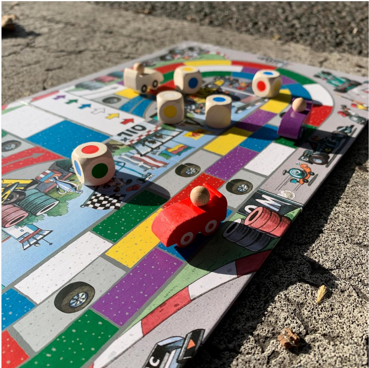
Image 4.2: A detailed view of a red wooden racing car positioned on a colored space on the HABA Monza game board, with several color dice nearby, demonstrating a player's turn.