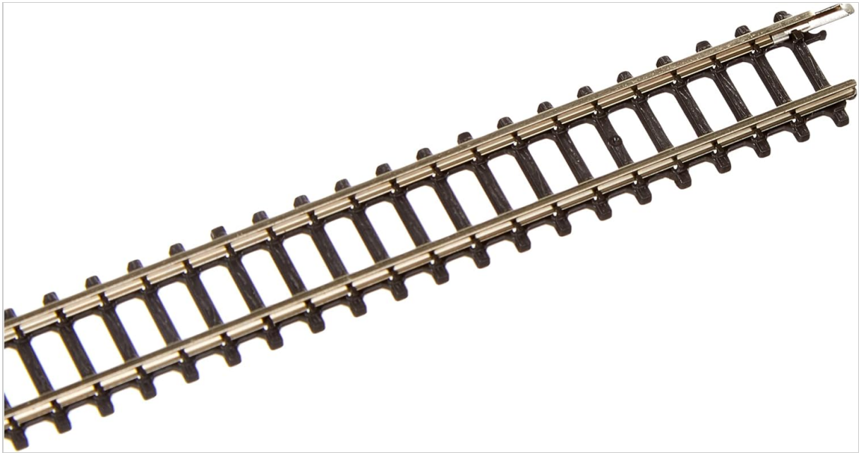
Figure 3.1: A detailed view of a Märklin Z Scale straight track section, highlighting the rail and sleeper design.