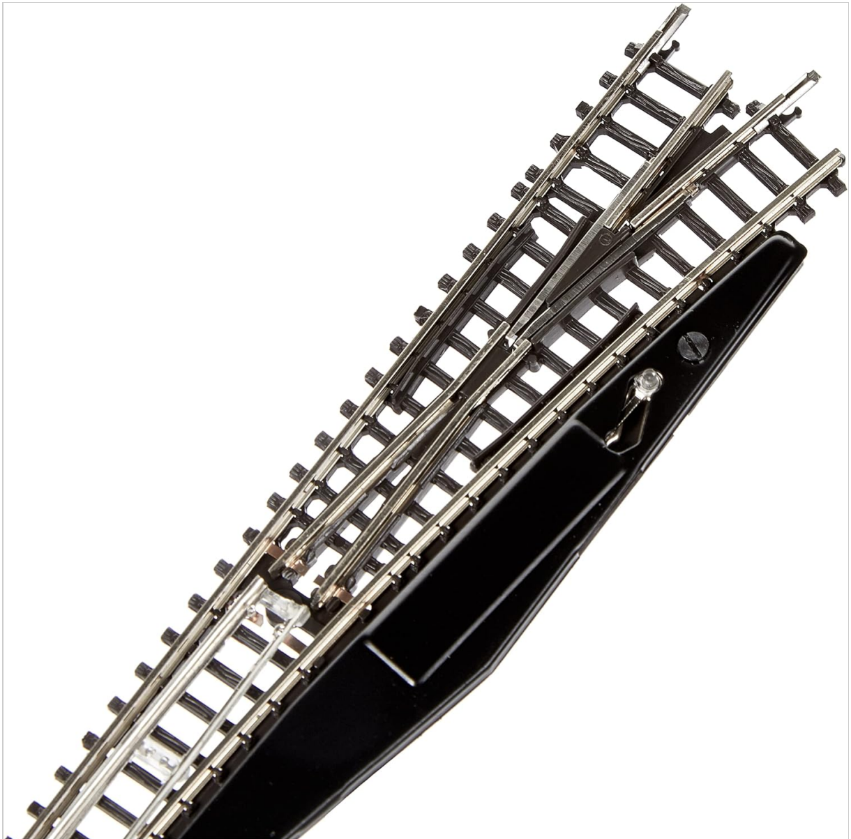
Figure 3.2: A close-up of a Märklin Z Scale manual turnout, showing the movable points and the lever for changing track direction.