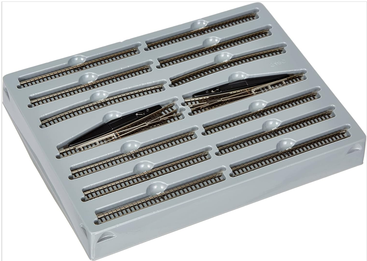
Figure 2.3: The Märklin Z Scale track components, including straight tracks and turnouts, neatly arranged within their protective plastic tray.