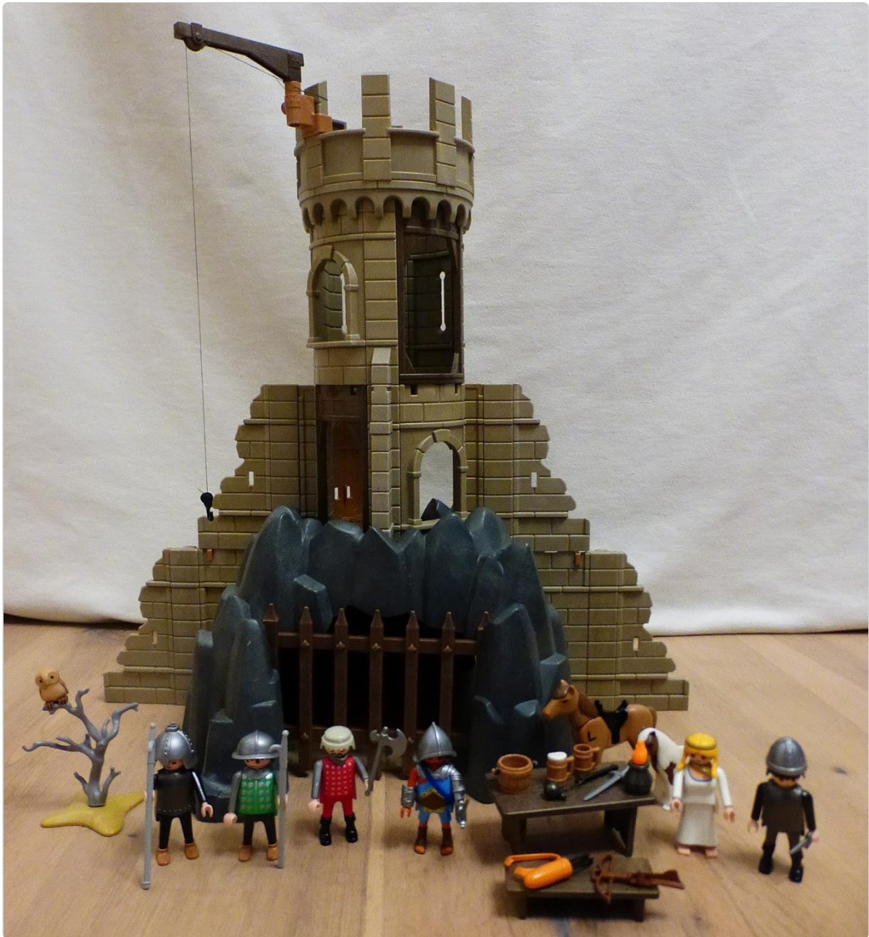
Figure 1: Overview of the Playmobil Baron's Battle Castle/Tower set, including the main castle structure, various knight figures, horses, and accessories like a table, weapons, and a crossbow.