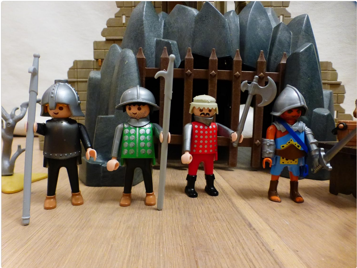
Figure 2: A close-up view of four Playmobil knight figures, each with unique armor and weapons, standing in front of the castle's cave entrance.