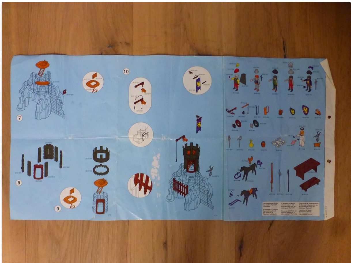
Figure 4: Page 1 of the Playmobil 3665 assembly instructions, showing initial steps for constructing the base and lower castle sections.