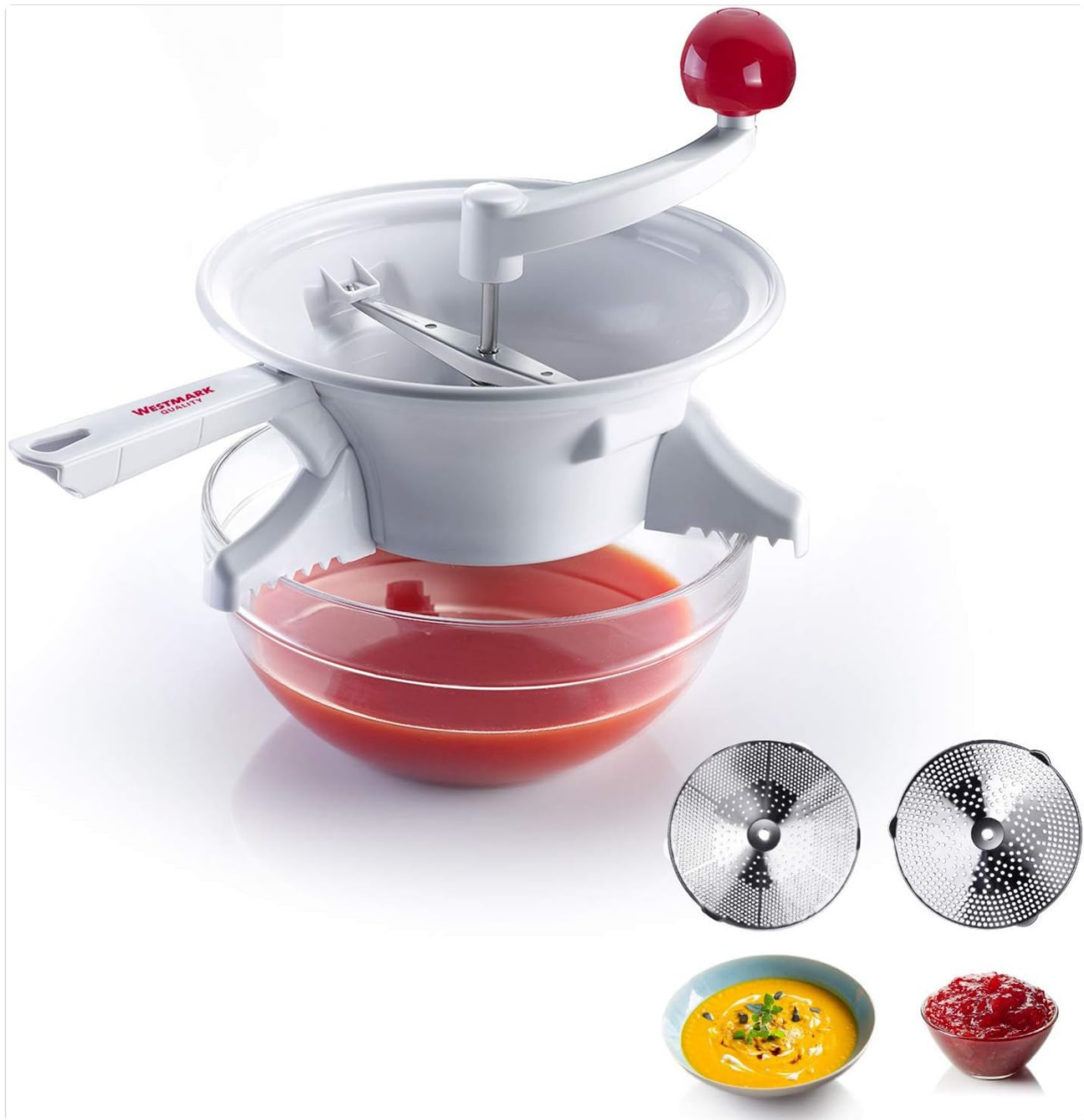
Image: The Westmark Food Mill actively processing tomatoes, with red puree collecting in a clear bowl underneath. Two grinding discs and examples of finished purees are also shown.