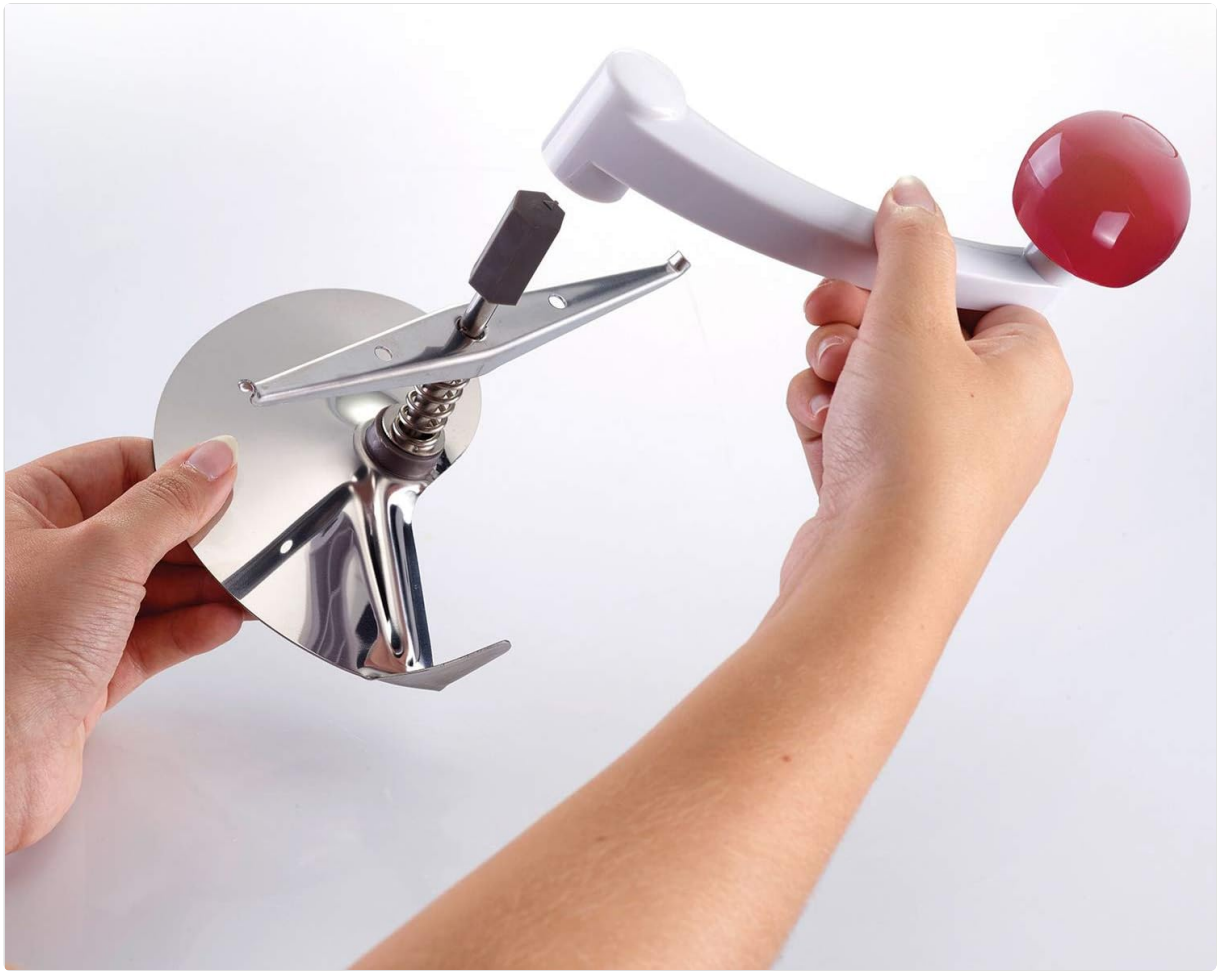
Image: A close-up of hands demonstrating how to attach the crank handle to the rotating blade assembly of the Westmark Food Mill.