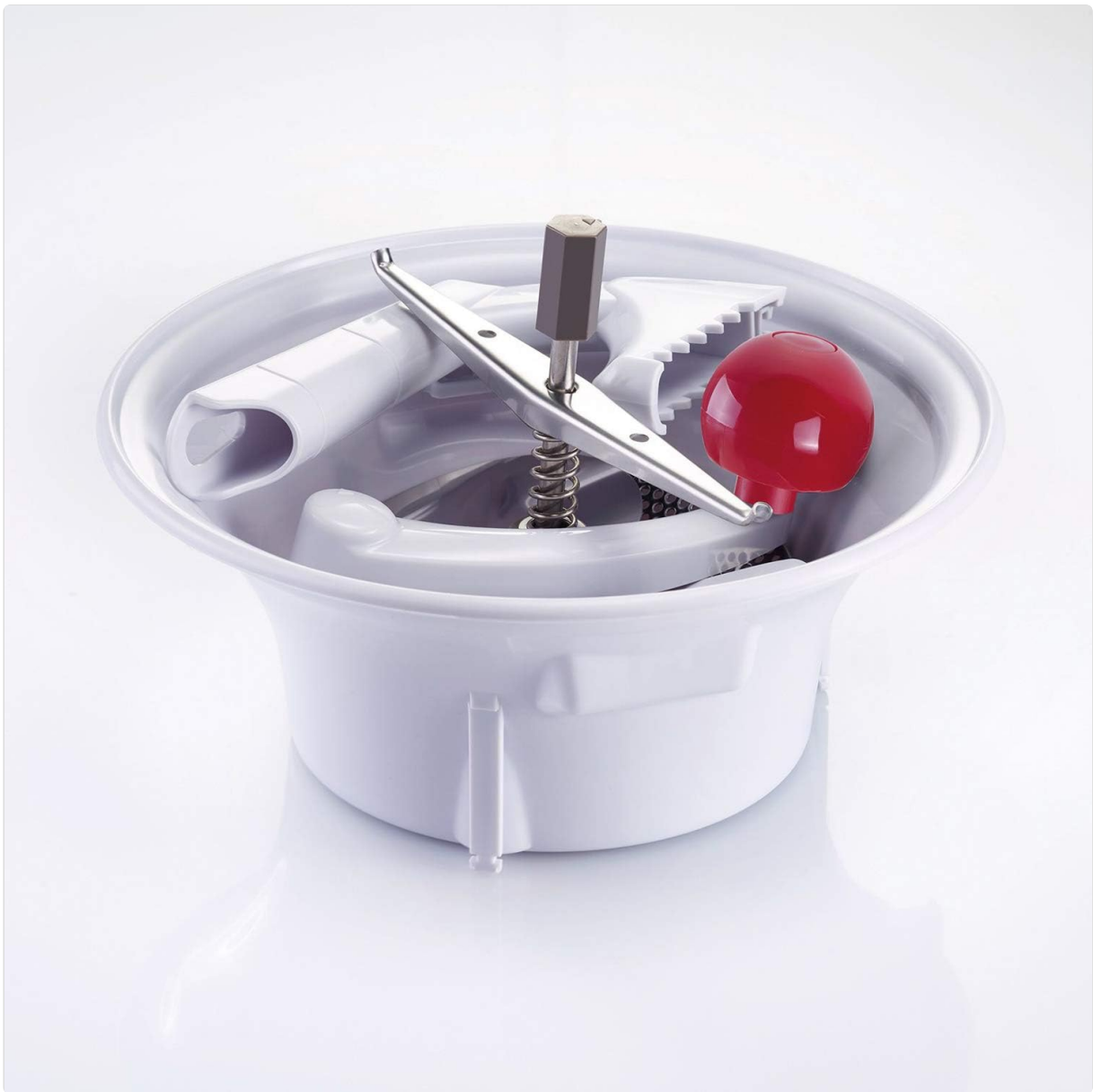
Image: The Westmark Food Mill disassembled, showing the main bowl, crank handle, rotating blade assembly, and grinding discs nested within the bowl for storage.