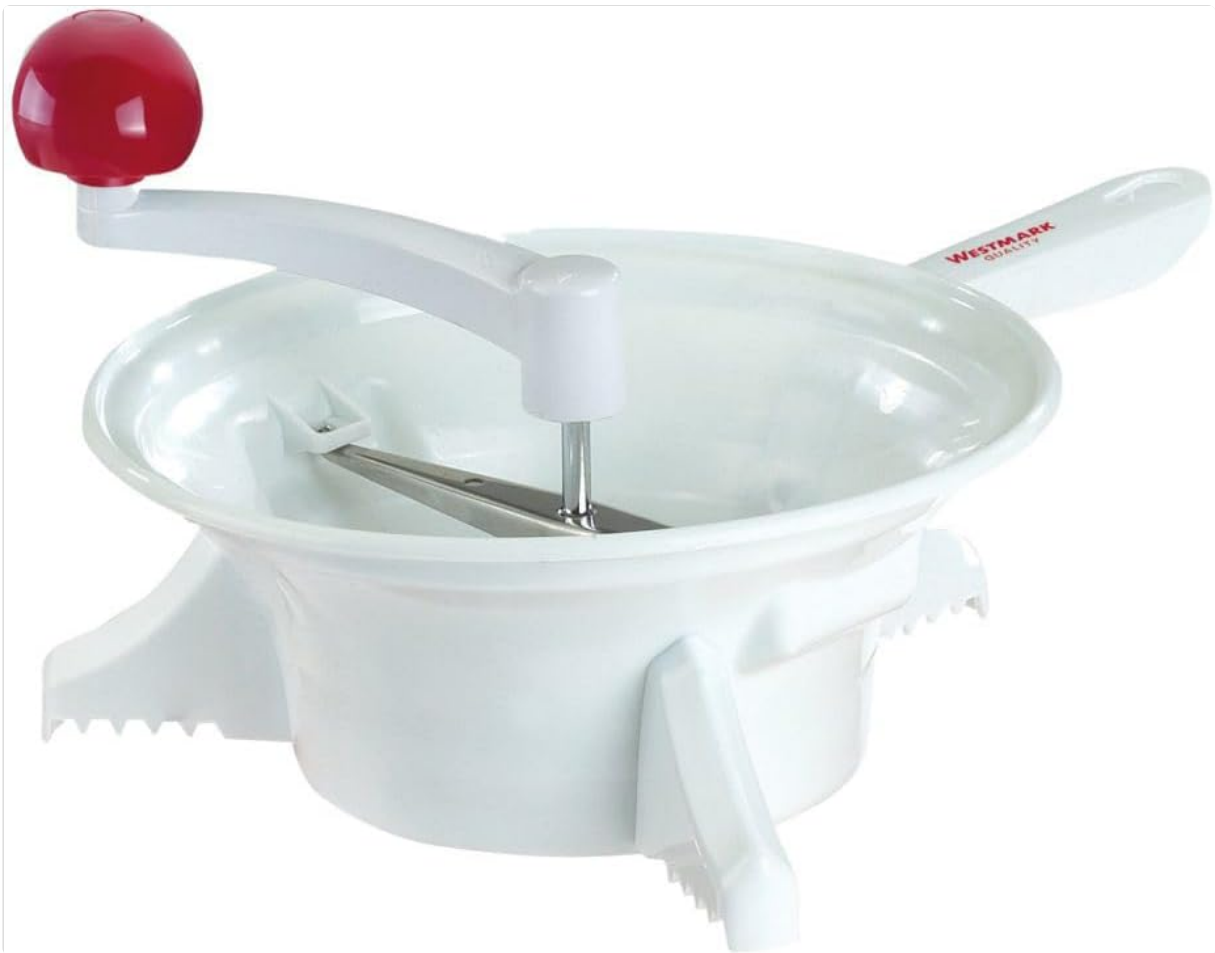
Image: The Westmark Food Mill, a white device with a red handle, featuring a bowl, a rotating blade, and three stable legs, ready for food processing.