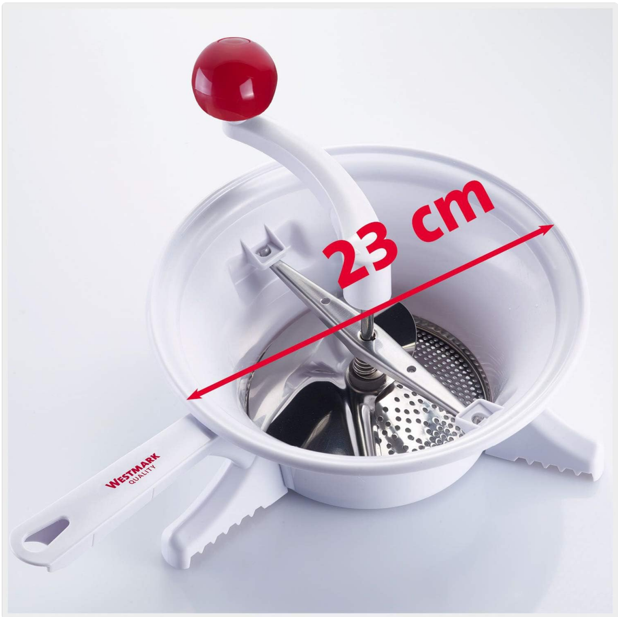
Image: The Westmark Food Mill with a red line and "23 cm" text overlaid, indicating its approximate diameter.