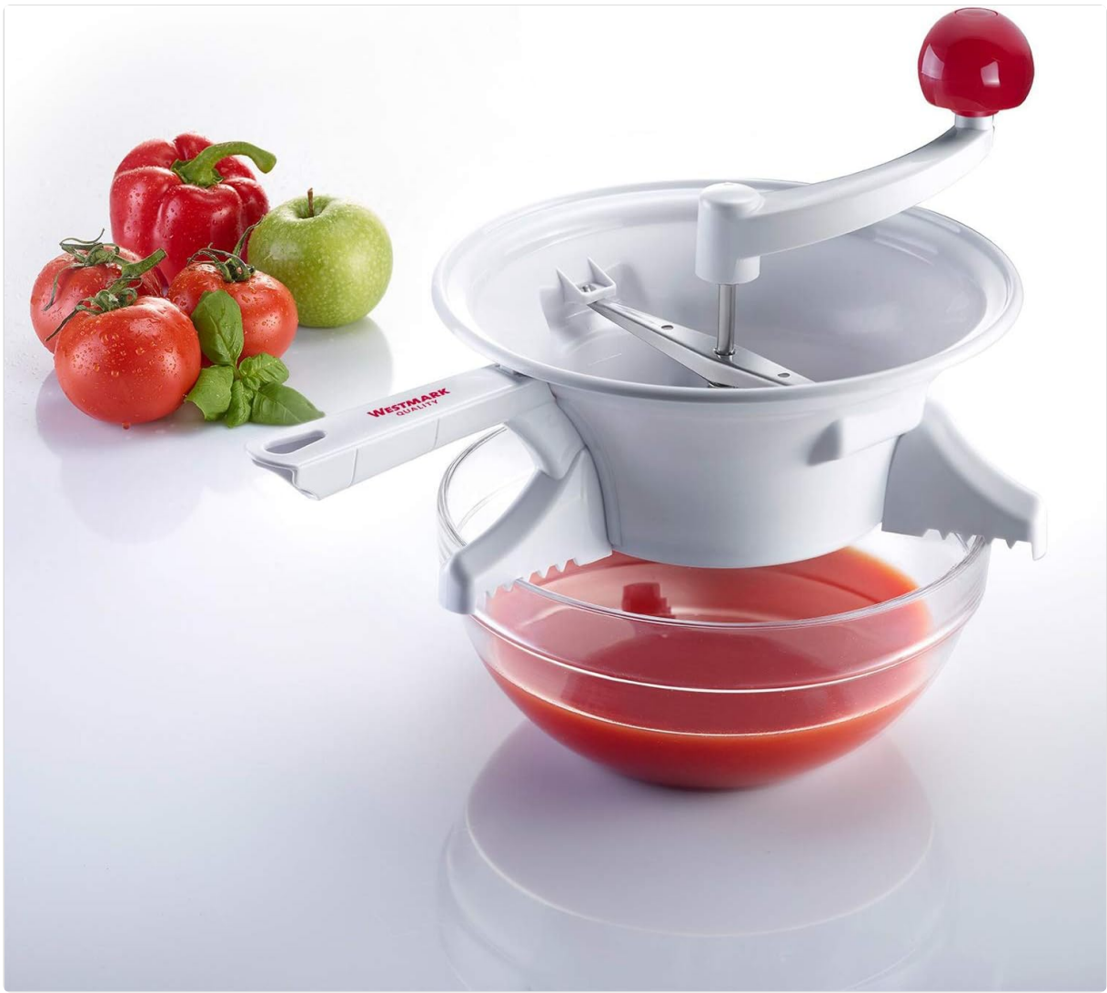
Image: The Westmark Food Mill positioned over a bowl, with fresh tomatoes, red peppers, and green apples arranged nearby, illustrating the types of produce suitable for processing.