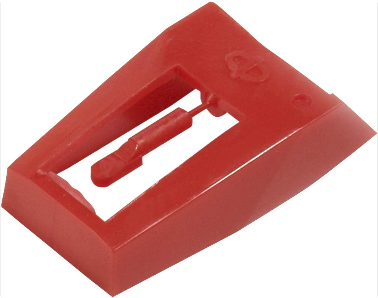
Image: The Crosley NP1 Replacement Needle, showcasing its red plastic housing and diamond stylus.