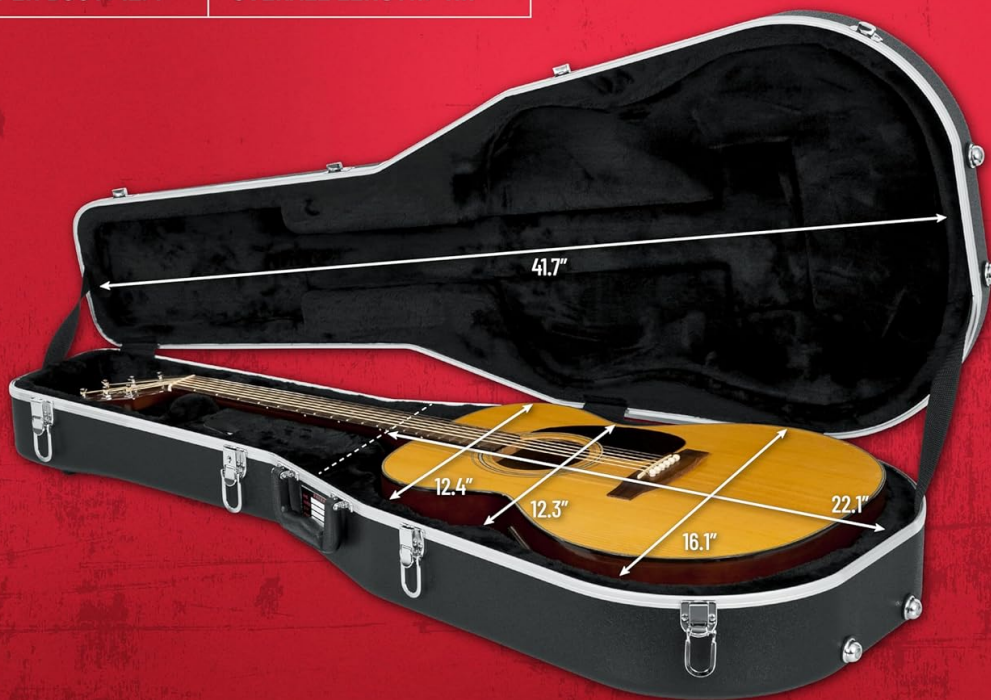
Diagram illustrating the interior dimensions of the GC-DREAD case, including body length, height, and bout widths.