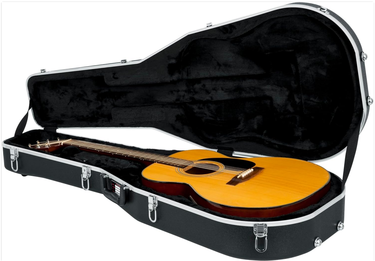
The Gator Cases GC-DREAD open, revealing a Dreadnought acoustic guitar nestled securely within its plush-lined interior.