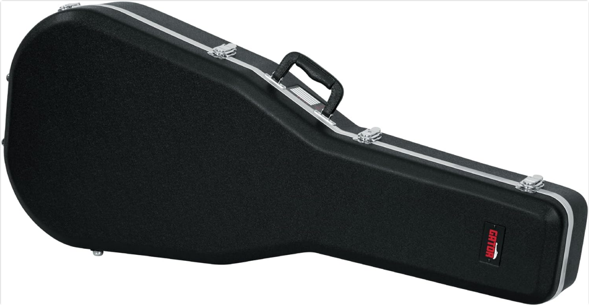
Closed view of the Gator Cases GC-DREAD Dreadnought Guitar Case, showcasing its rugged ABS exterior and secure latches.

Interior Dimensions: Body Length 23"/58.42 cm, Body Height 5"/12.7 cm, Lower Bout Width 16"/40.64 cm, Middle Bout Width 12.25"/31.11 cm, Upper Bout Width 12.5"/31.75cm, Overall Length 43" /109.22 cm.