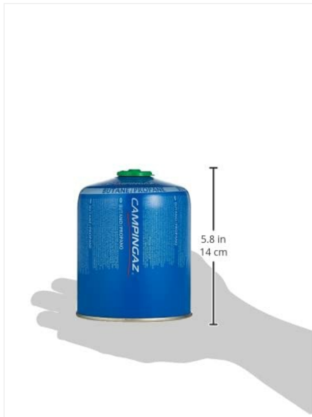
Image 7.1: Visual representation of the Campingaz CV 470 Plus cartridge dimensions.