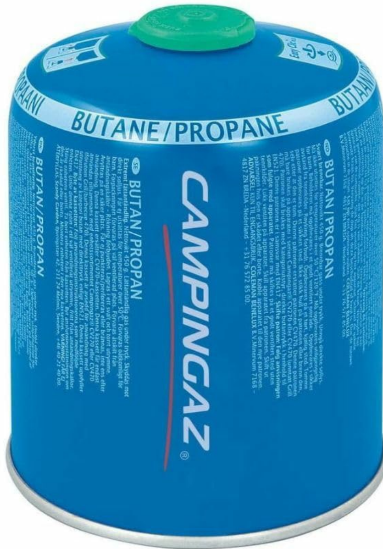
Image 1.1: The Campingaz CV 470 Plus Gas Cartridge, a compact and resealable gas canister.