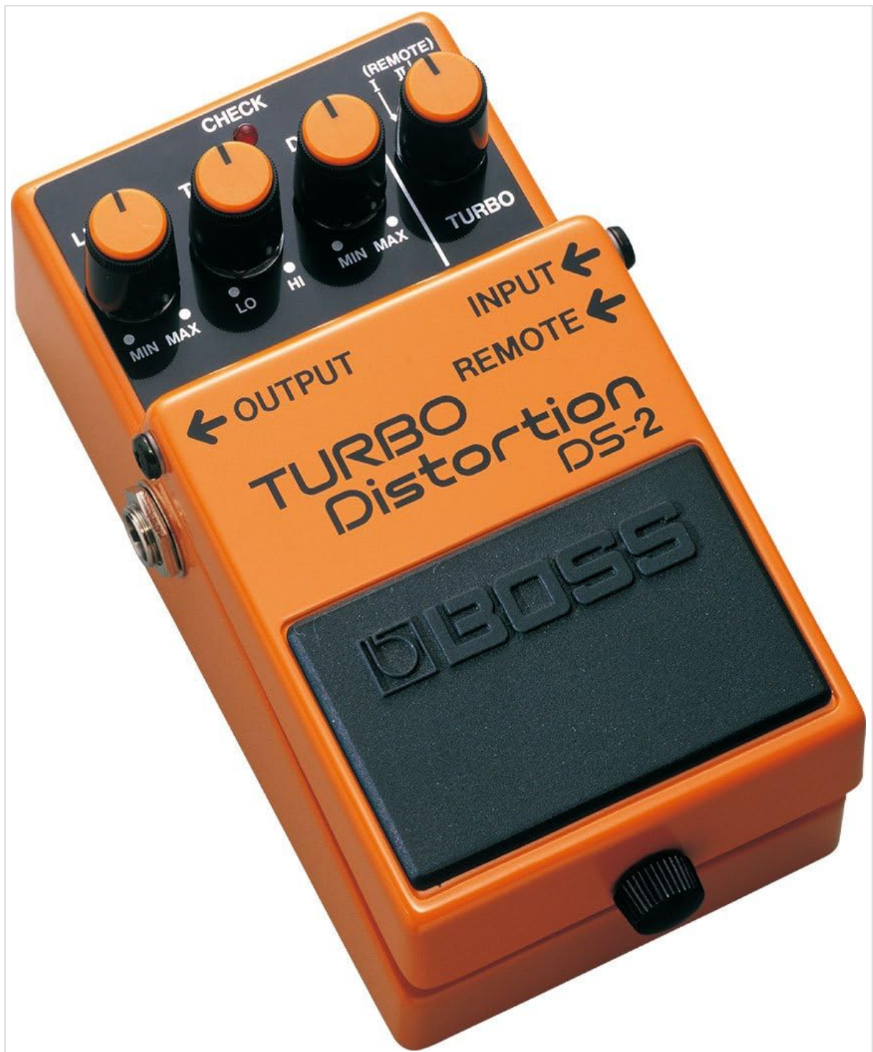
Figure 1: BOSS DS-2 Turbo Distortion Pedal (Angled View)