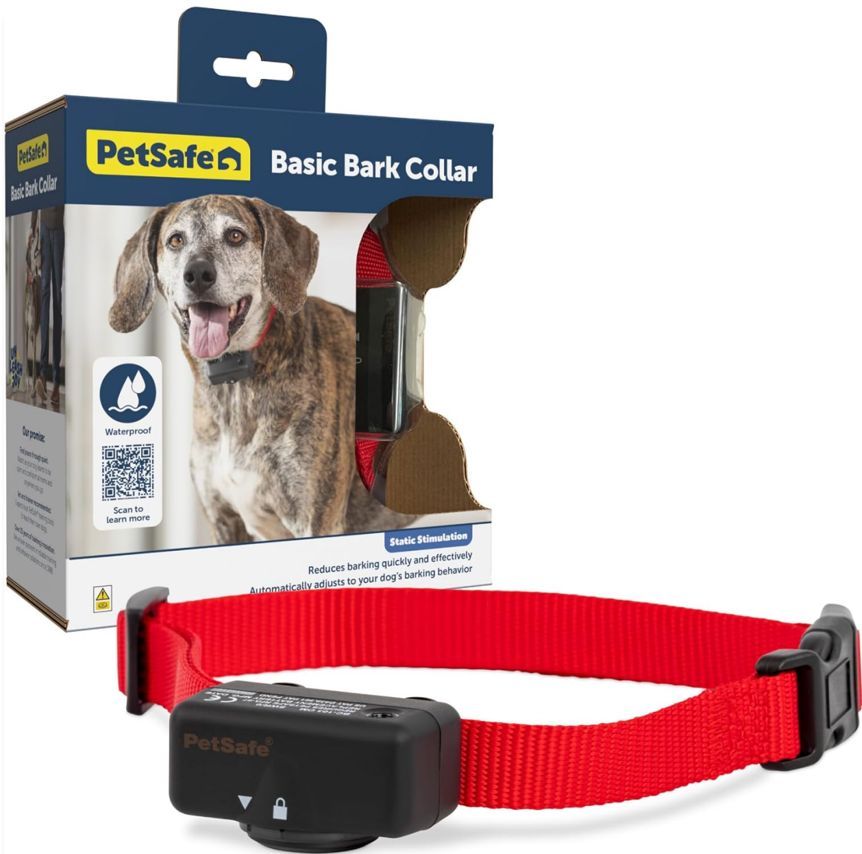
Image: The PetSafe Basic Bark Control Collar, showing the red nylon strap, the black control unit, and the product packaging.