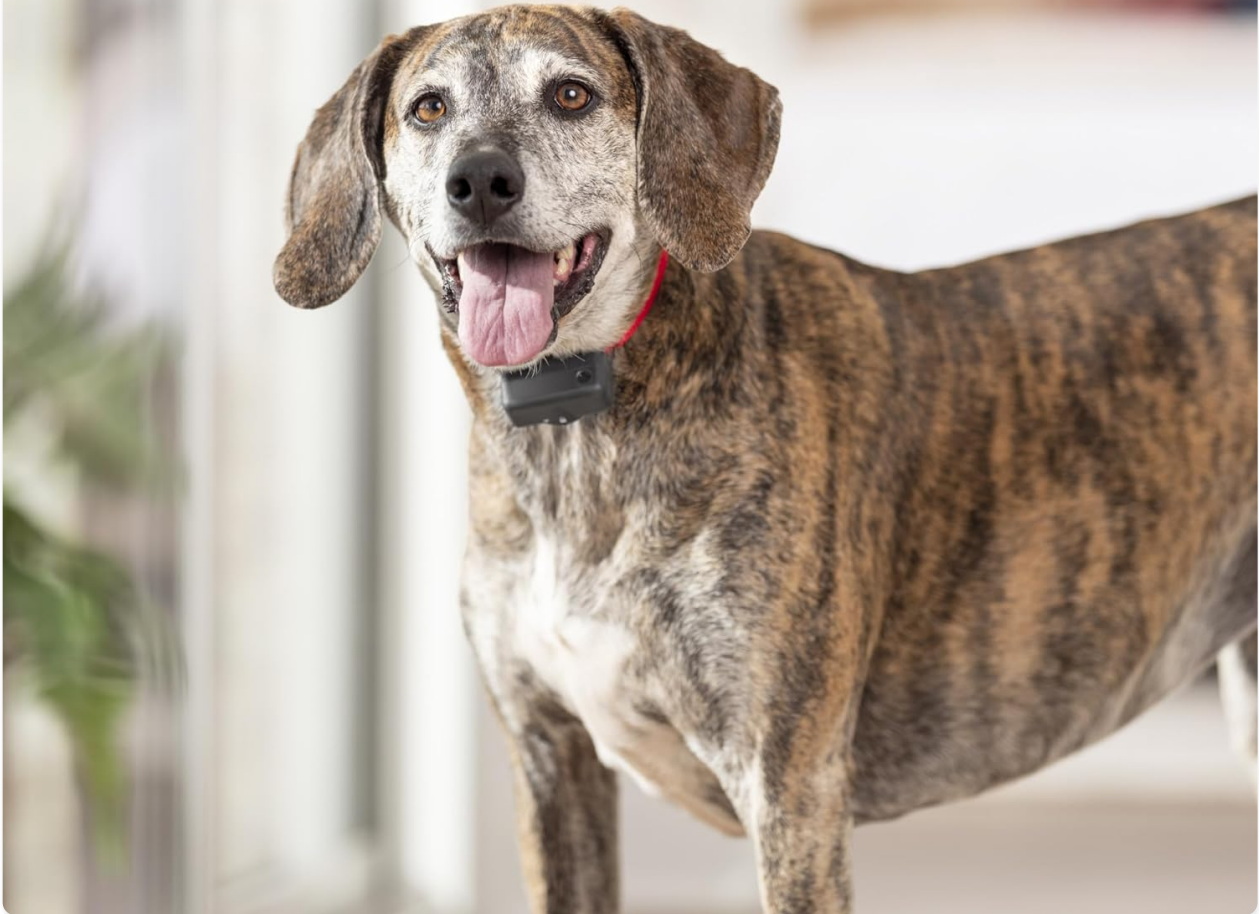
Image: A dog wearing the bark collar, looking intently out a window, demonstrating the collar's use in various environments.