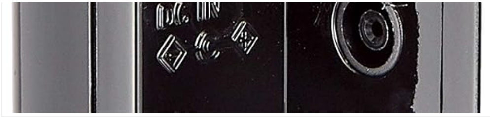
Image: Rear panel of the right speaker showing RCA inputs, speaker output, and DC power input.