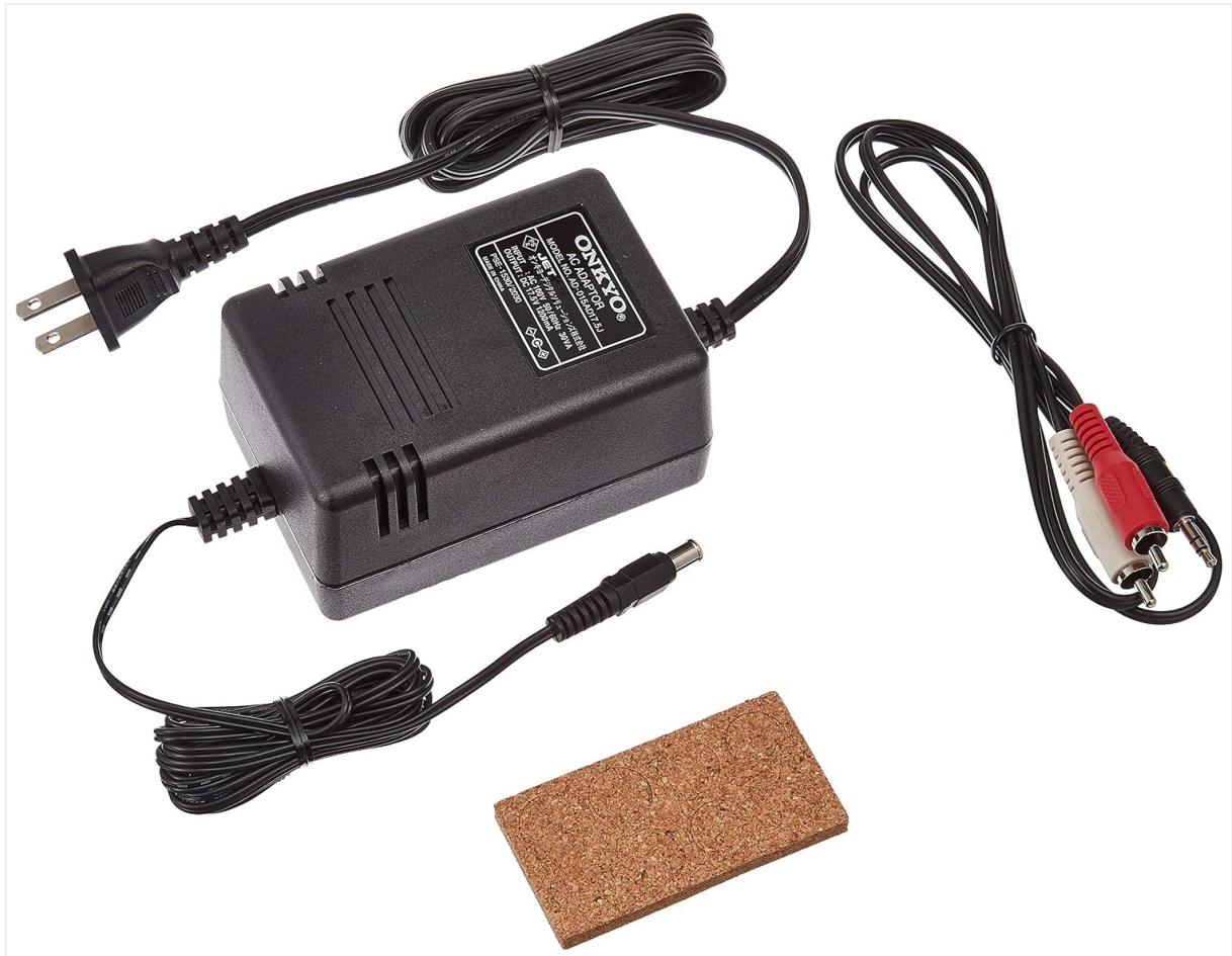
Image: AC Power Adapter and RCA Cable included with the speakers.