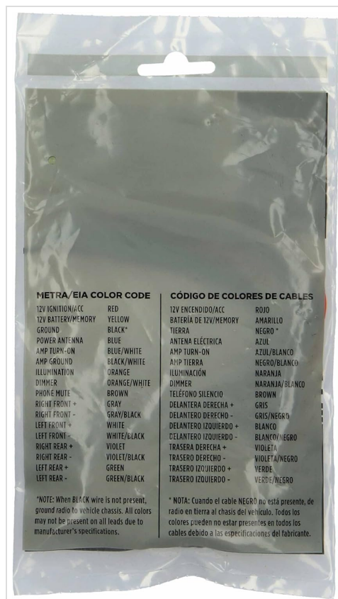
Figure 3: Back of the product packaging, showing the METRA/EIA color code for wire identification, crucial for correct installation.