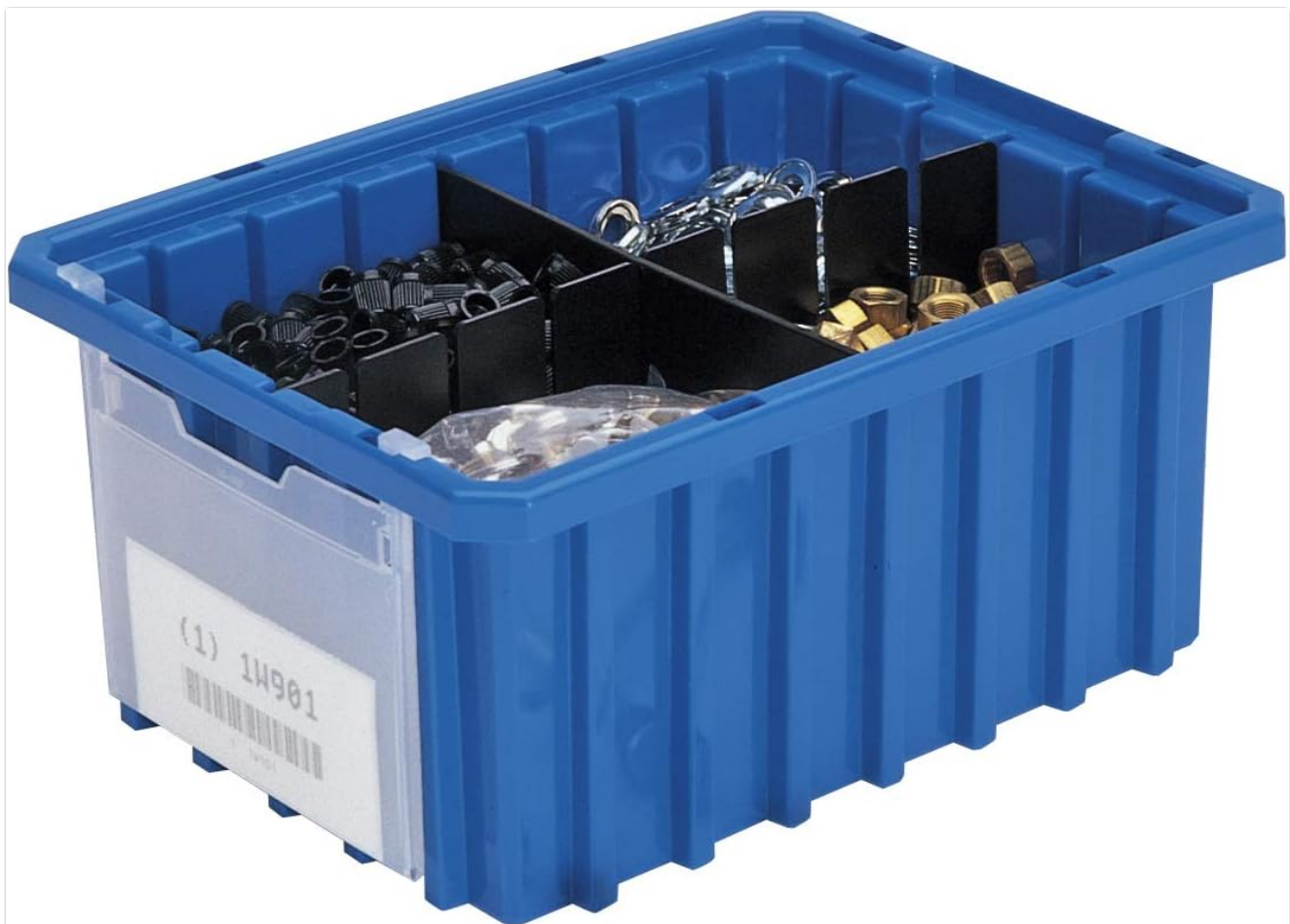
Figure 3: Blue Akro-Grid tote demonstrating organized small hardware components using the dividers.