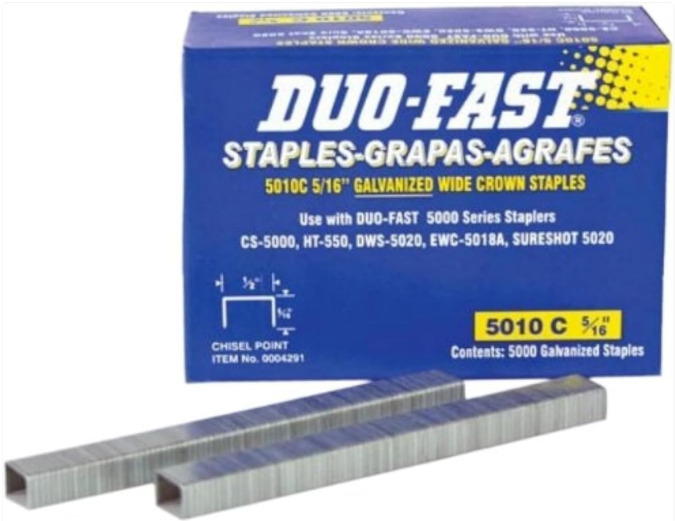
Image: A box of Duo-Fast 5010C 5/16" Galvanized Wide Crown Staples, showing the product packaging and two individual strips of staples. The box indicates "Contents: 5000 Galvanized Staples" and compatibility with Duo-Fast 5000 Series Staplers.