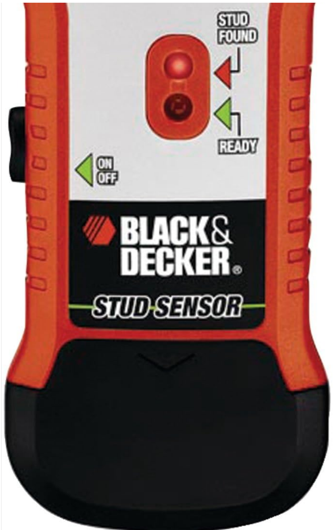
Figure 1: The BLACK+DECKER SF100 Wood Stud Finder.