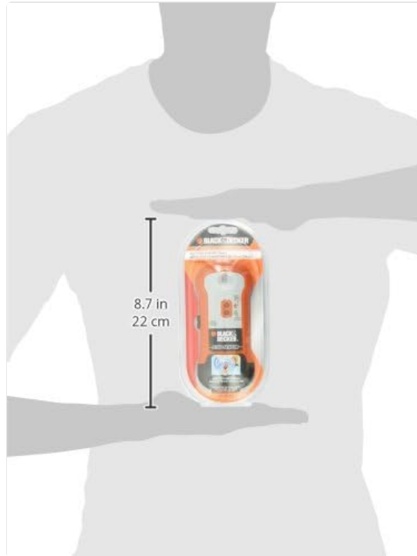
Figure 2: The back of the stud finder, indicating the battery compartment and operating instructions.