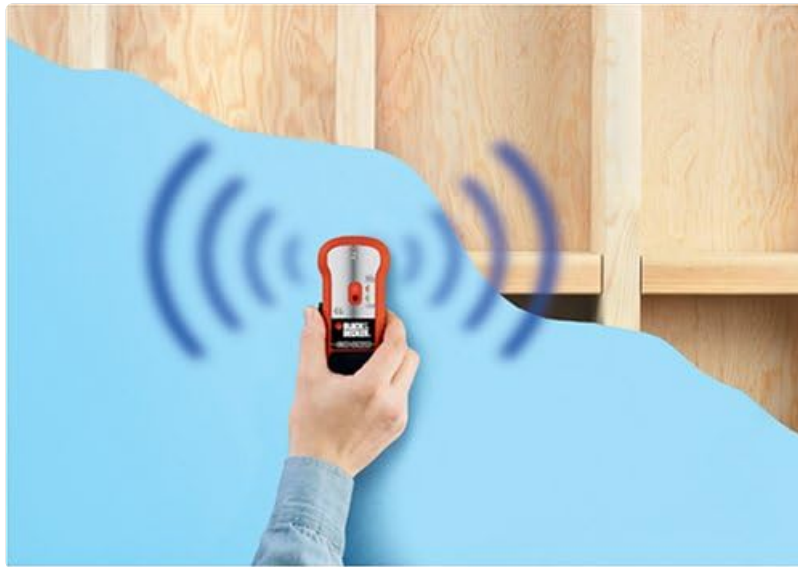
Figure 3: Using the stud finder to mark a stud's location on a wall.