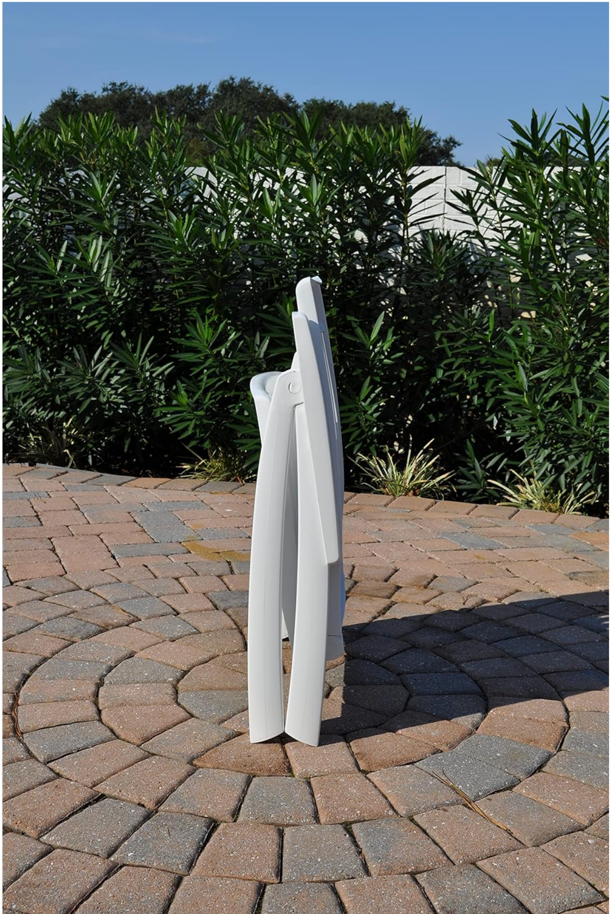
Image: The KETTLER Roma Resin High Back Chair shown in its compact, folded state, suitable for storage.