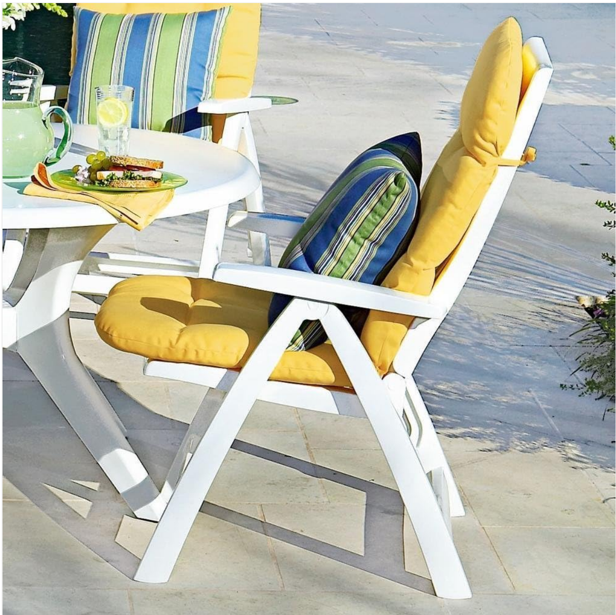
Image: The chair shown in a reclined position, highlighting its adjustable backrest feature.