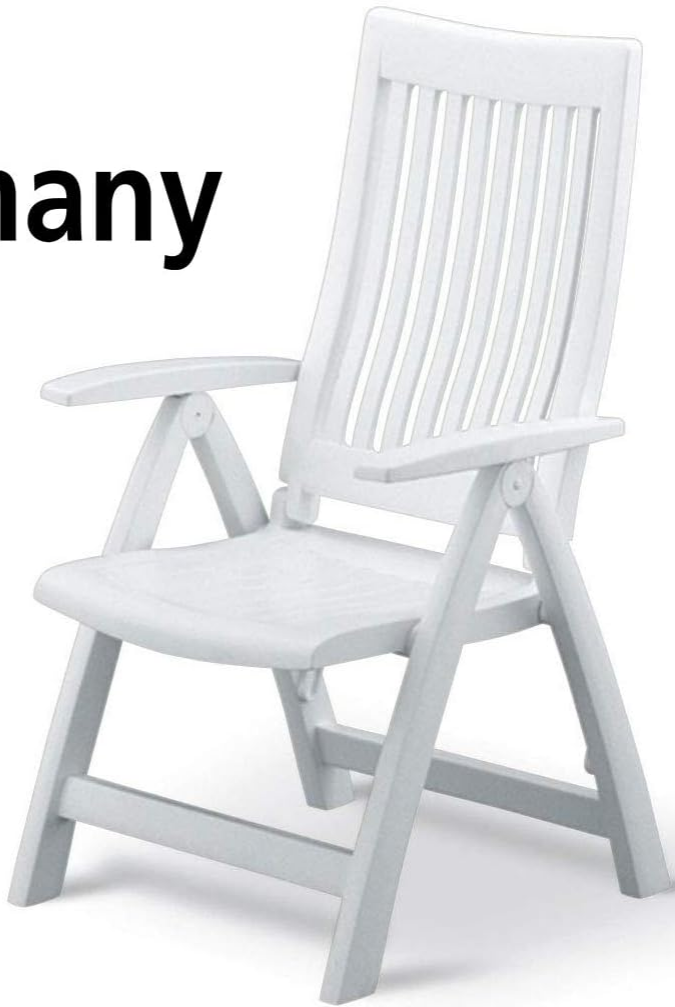
Image: The KETTLER Roma Resin High Back Chair, emphasizing its German manufacturing origin.