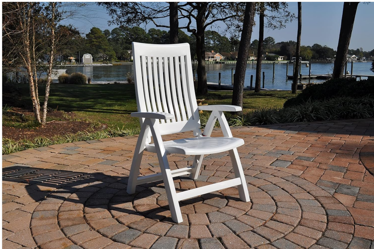
Image: The KETTLER Roma Resin High Back Chair positioned on a patio next to a pool, showcasing its design in an outdoor environment.

The KETTLER Roma Resin High Back Chair is designed for outdoor use, offering comfort and durability. Constructed from high-impact resin, this chair features a contoured back, four reclining positions, and a unique Safety Fold track-and-latch mechanism for secure positioning and easy storage.