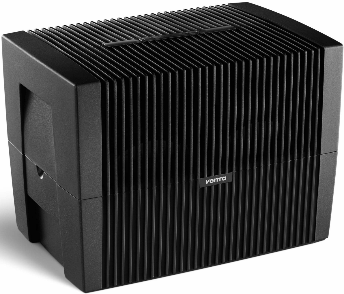
The Venta LW45 Humidifier positioned in a living room, demonstrating typical placement for effective humidification.