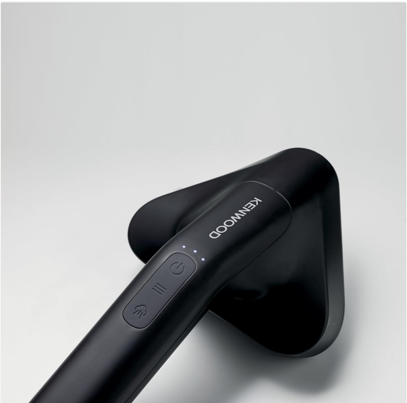
Image: Detailed view of the steamer head, highlighting the digital power and steam level controls for convenient operation.