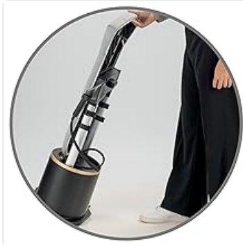
Image: Diagram illustrating the mechanism for adjusting the height of the steamer's telescopic poles, ensuring ergonomic use.