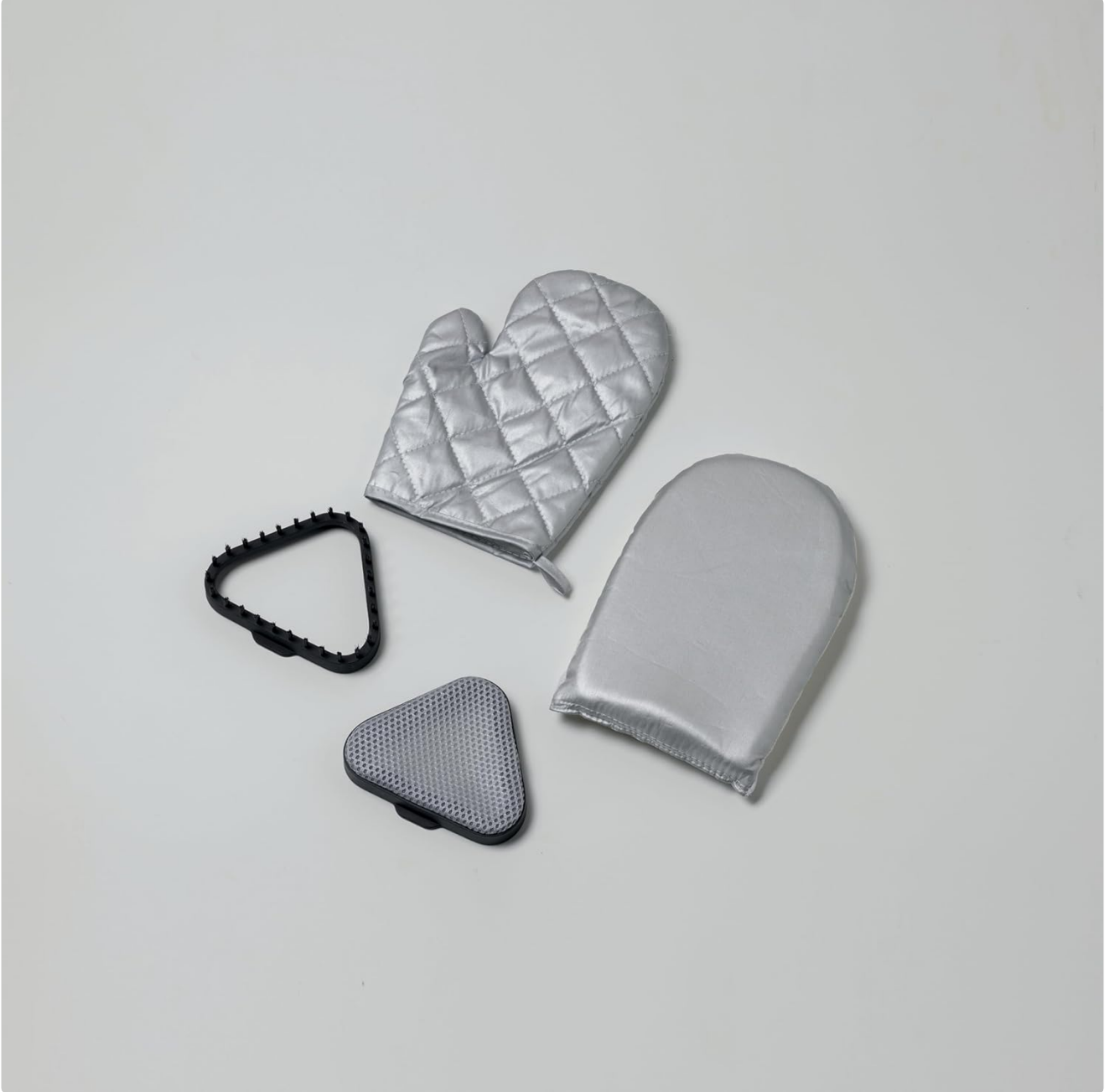
Image: Included accessories for the Kenwood Garment Steamer GSP80, featuring two types of brushes and two protective gloves.