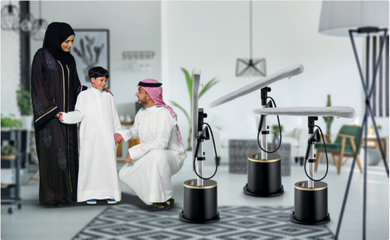
Image: The Kenwood Garment Steamer GSP80 demonstrating its versatile ironing board, adjustable to vertical, 45-degree, and horizontal positions for various garment care needs.