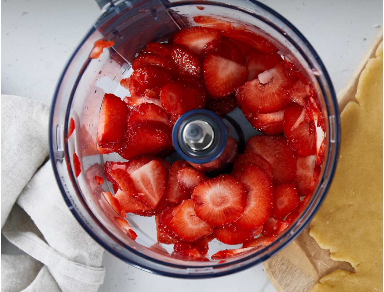
Figure 4: Fresh strawberries being processed within the Kenwood MultiPro Food Processor bowl, demonstrating its capability for preparing fruits for various recipes.