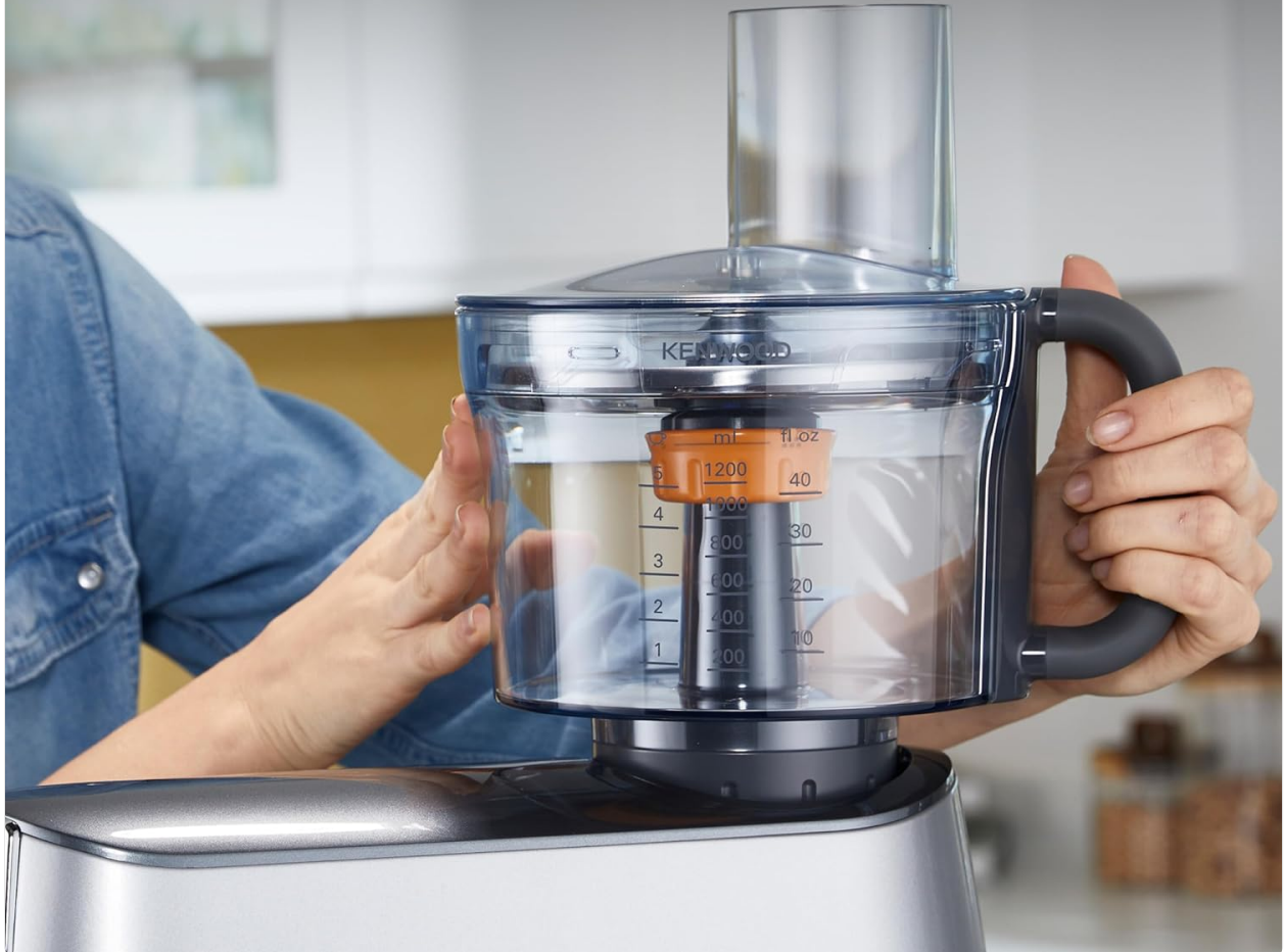
Figure 3: A user demonstrating the process of attaching the Kenwood MultiPro Food Processor to the high-speed outlet of a Kenwood stand mixer, highlighting the simple twist-and-lock mechanism.