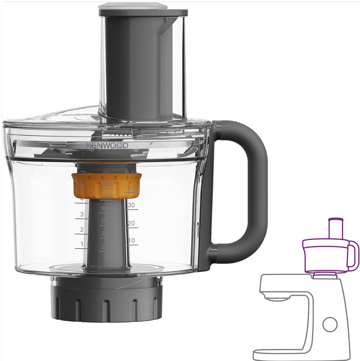
Figure 1: The Kenwood MultiPro Food Processor Attachment KAH65.000PL, showing the main bowl, lid, and pusher, ready for attachment to a compatible Kenwood stand mixer.

includes a robust bowl, a lid with a feed tube and pusher, and a selection of cutting tools.