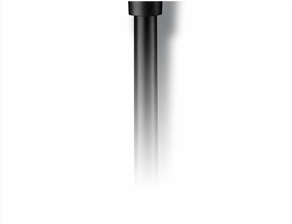
Image: The Andis 04710 Professional T-Outliner Beard & Hair Trimmer, a gray corded electric trimmer with a carbon steel T-blade.