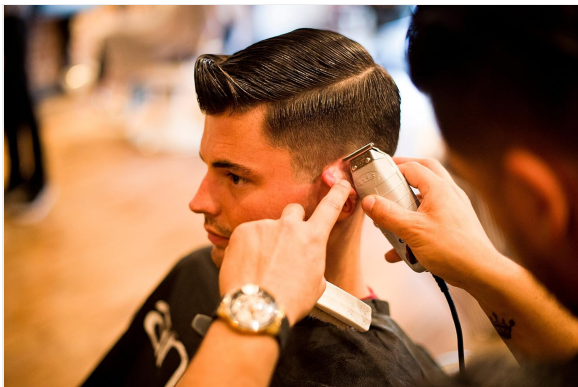
Image: A barber using the Andis T-Outliner to precisely trim a man's hairline, demonstrating its use for sharp edges.