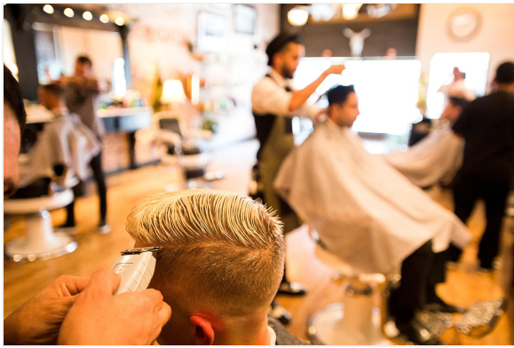
Image: A barber using the Andis T-Outliner to trim the side of a man's head, showcasing its versatility for hair grooming.