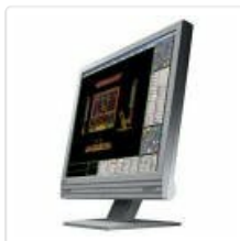
Figure 1: NANAO FlexScan L767-R LCD Monitor. This image shows the monitor from a slight angle, highlighting its slim bezel and adjustable stand.

Thank you for purchasing the NANAO FlexScan L767-R 19-inch Color LCD Display. This manual provides essential information for setting up, operating, and maintaining your monitor. Please read this manual thoroughly before use to ensure proper and safe operation.