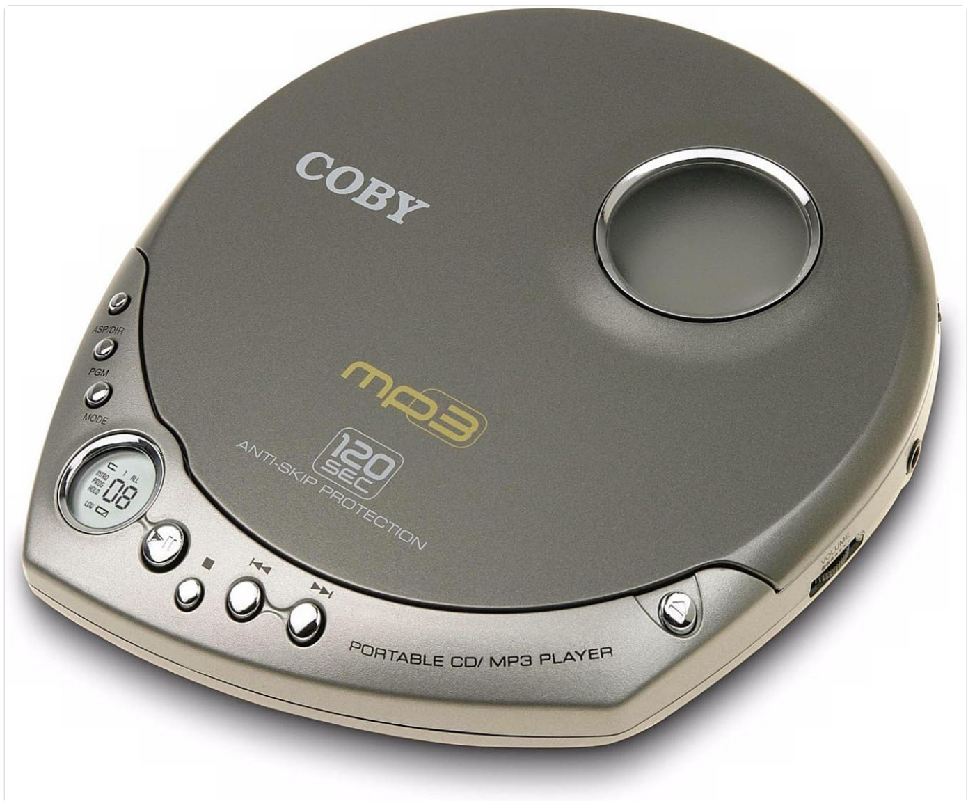
Figure 1: Coby MPCD511 Personal MP3 CD Player. The image displays the top surface of the player, highlighting the central CD compartment lid, the Coby brand name, "MP3" and "120 SEC ANTI-SKIP PROTECTION" labels. On the left side, there's a small LCD screen and buttons labeled ASP/DIR, PGM, and MODE. Along the bottom edge, playback control buttons (play/pause, stop, skip forward/backward) are visible. The right side shows a volume slider.