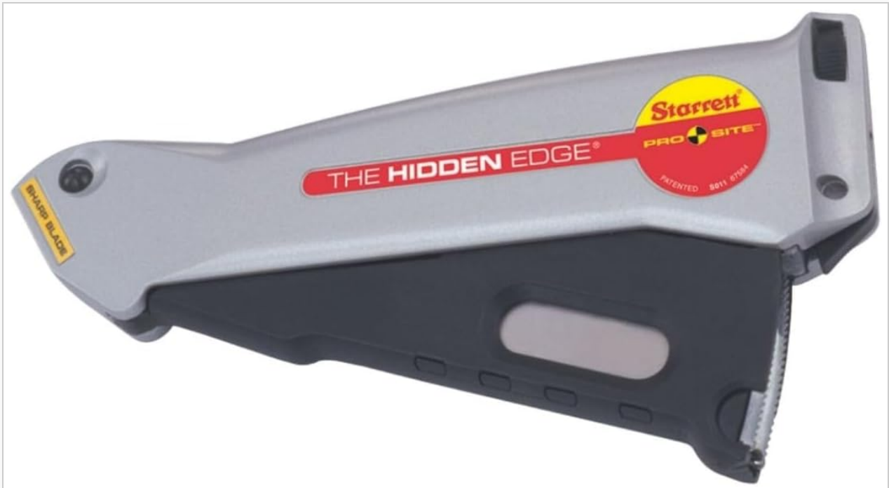
Figure 1.1: Starrett Hidden Edge Utility Knife, Model S011. This image shows the overall design of the utility knife with its blade retracted, highlighting its compact and safe form factor.

The Starrett Hidden Edge Utility Knife (Model S011) is designed for safe and efficient cutting tasks. Its innovative design keeps the blade safely retracted when not in use, minimizing the risk of accidental cuts. The knife features a quick-release mechanism for instant blade access and a thumb wheel for precise cutting depth adjustment. This manual provides essential information for the safe and effective use, maintenance, and care of your utility knife.