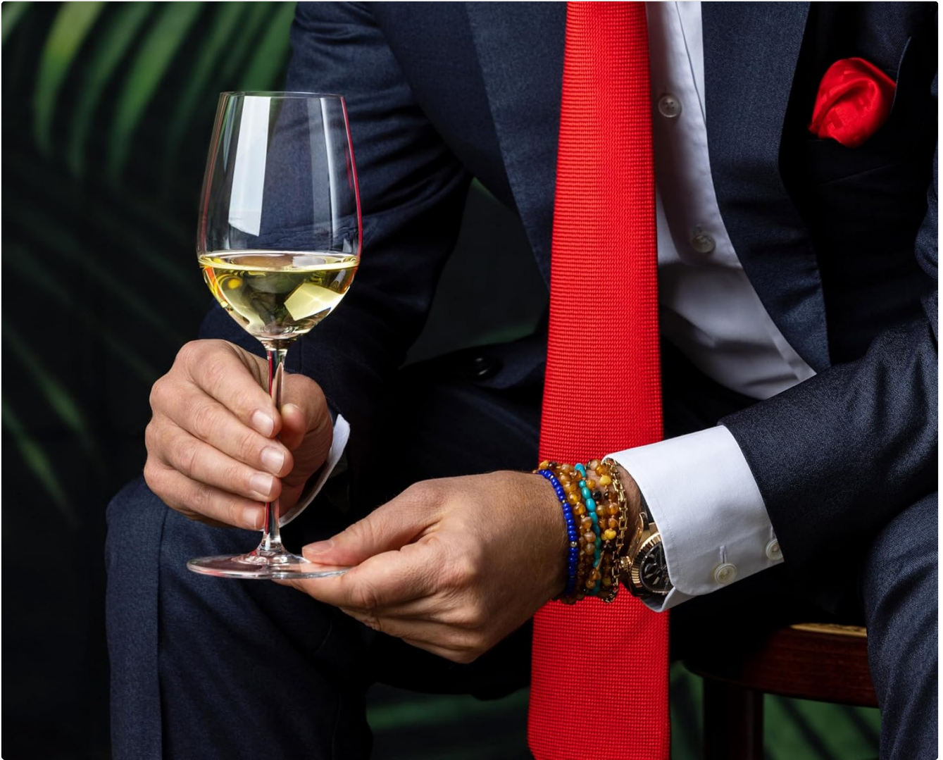
Image: A person holding the Riedel Sommeliers Riesling Grand Cru glass, demonstrating its comfortable hold and elegant presentation during wine tasting.

acidity, mineral, tannin, and alcohol components for a harmonious flavor profile.