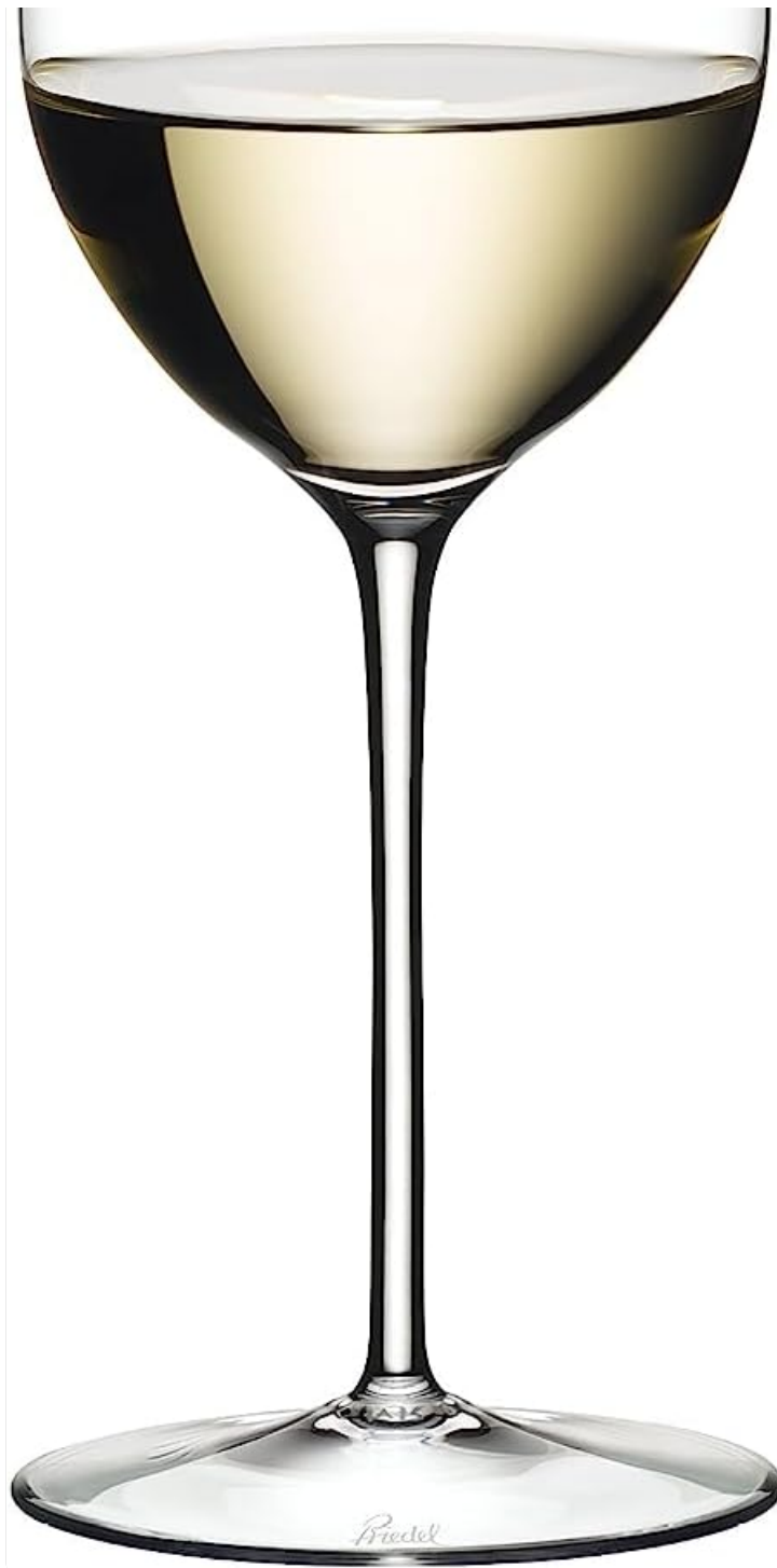
Image: The Riedel Sommeliers Riesling Grand Cru Wine Glass, showcasing its clear crystal and elegant design, filled with white wine.