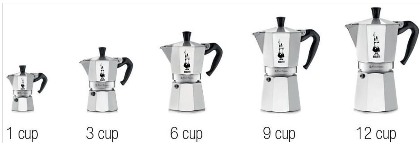
Image: Visual guide to the coffee preparation process.

7. Serve: Your authentic Italian coffee is now ready to be served. Enjoy!