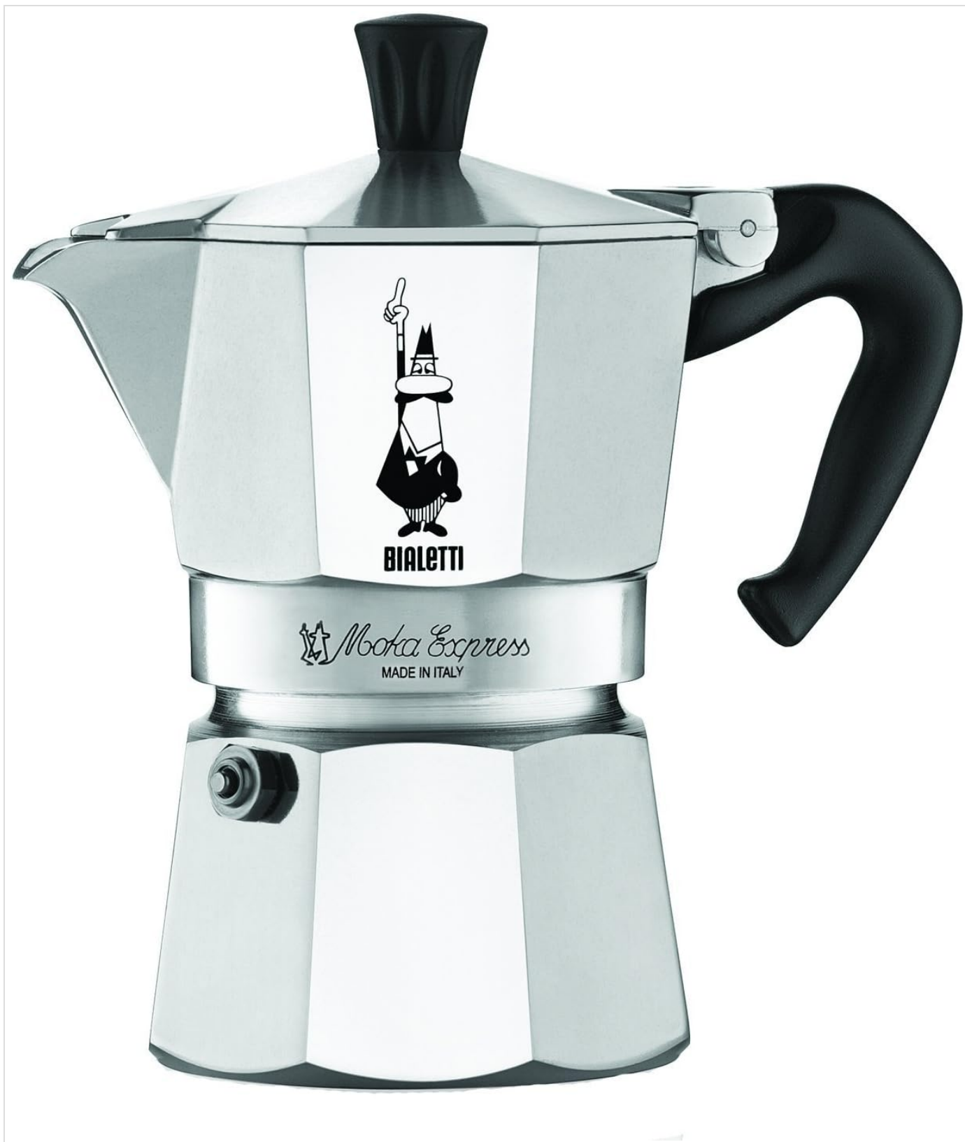
Image: The classic Bialetti Moka Express, a symbol of Italian coffee culture.

The Moka Express is crafted in Italy, featuring a patented safety valve for easy cleaning and an ergonomic handle for comfortable use. It is suitable for gas, electric, or propane cooktops. For induction cooktops, a Bialetti induction adapter plate (sold separately) is required.