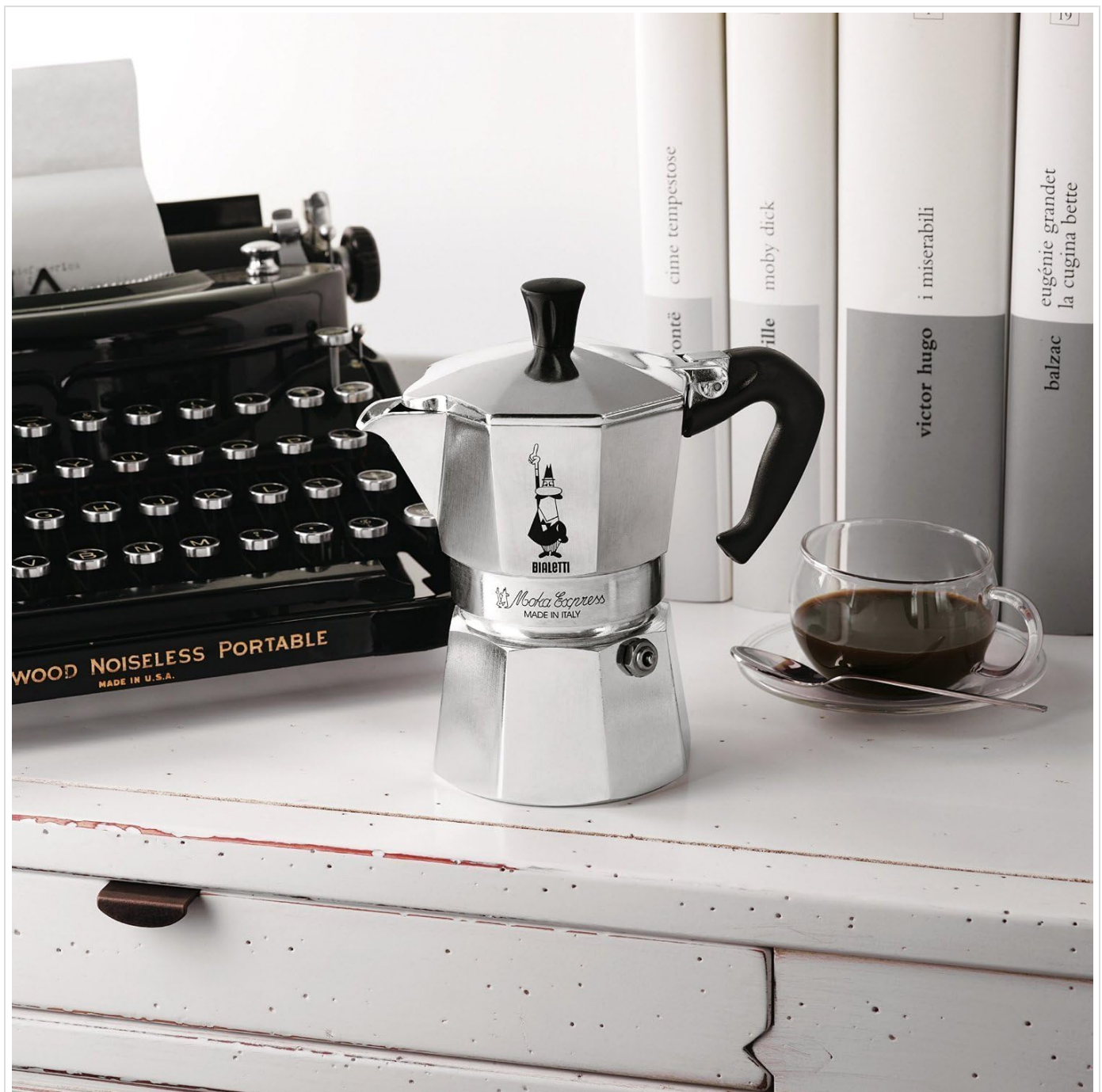
Image: The Bialetti Moka Express in a home setting, ready for use.