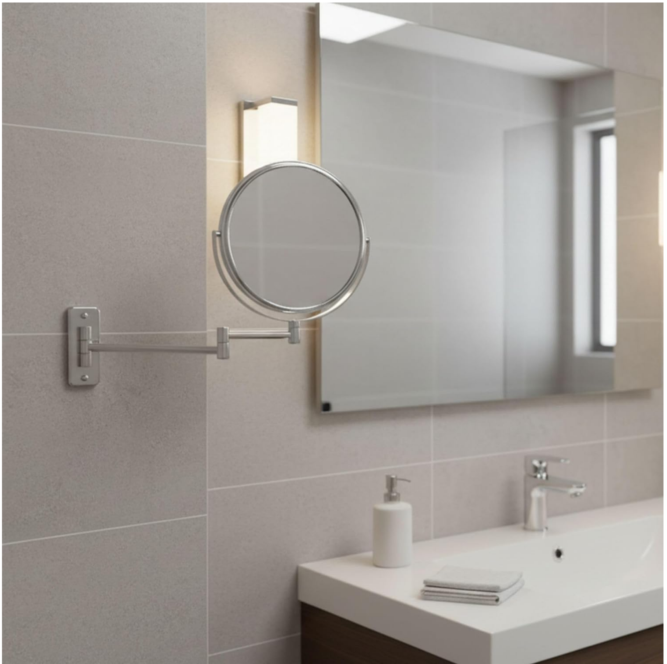
Image 5.1: The JERDON mirror installed on a bathroom wall, demonstrating its space-saving design.