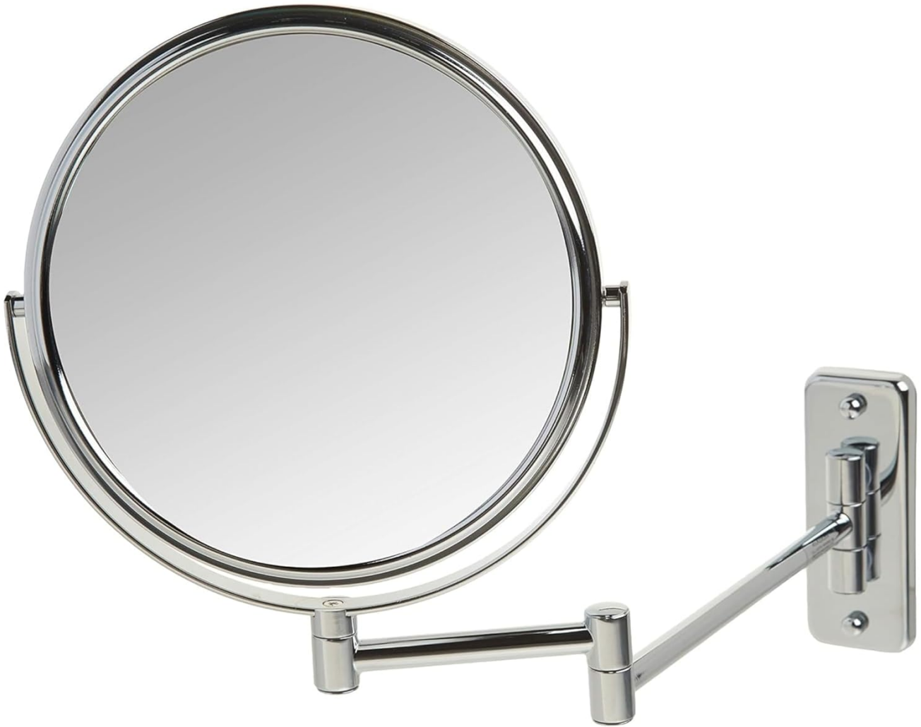
Image 1.1: The JERDON Two-Sided Wall-Mounted Makeup Mirror, Model JP7506CF, showcasing its elegant chrome finish and dual-sided design.