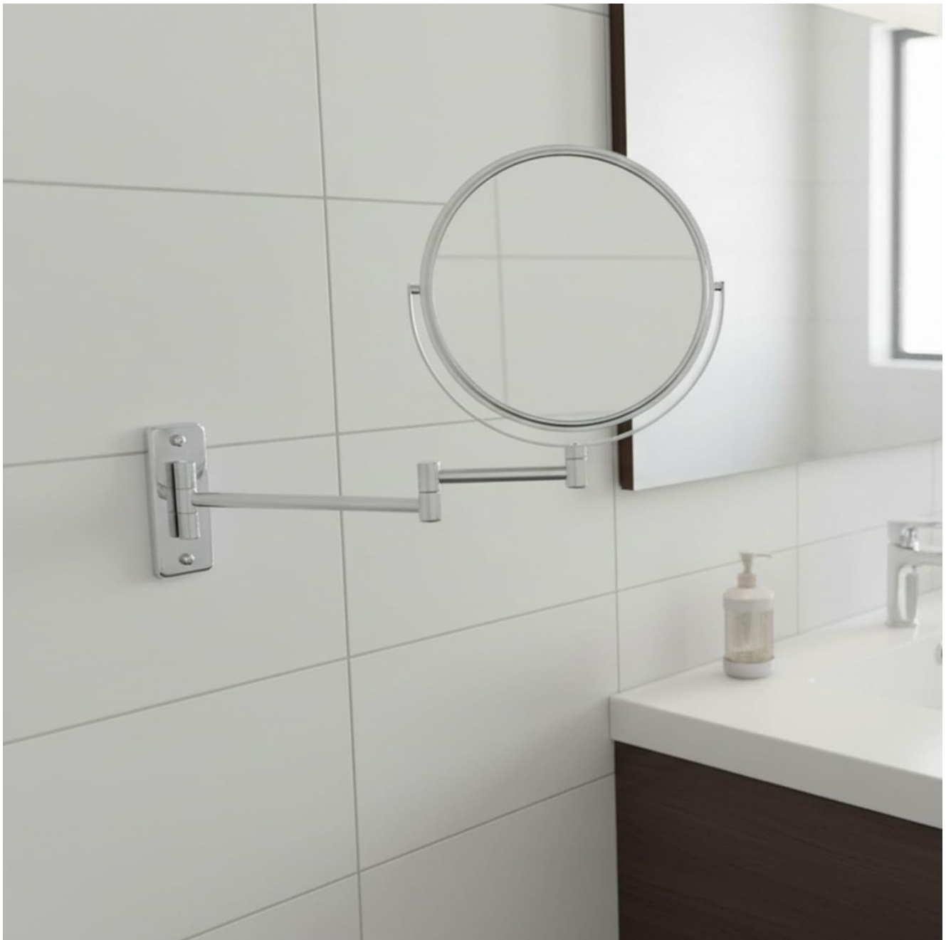
Image 6.2: The mirror's extendable arm allows for flexible positioning.