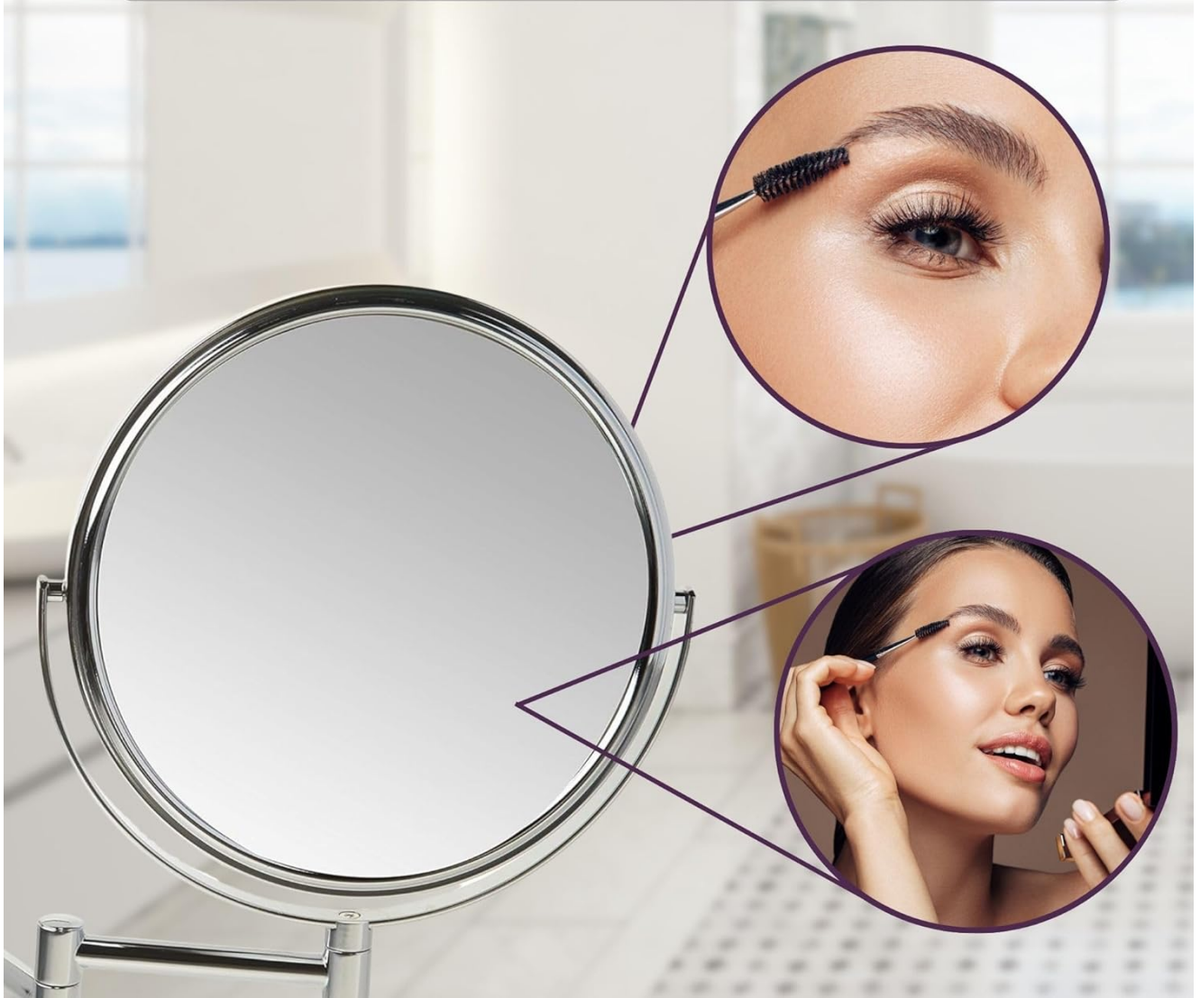
Image 6.1: Demonstrating the 5X magnification for precise makeup application.