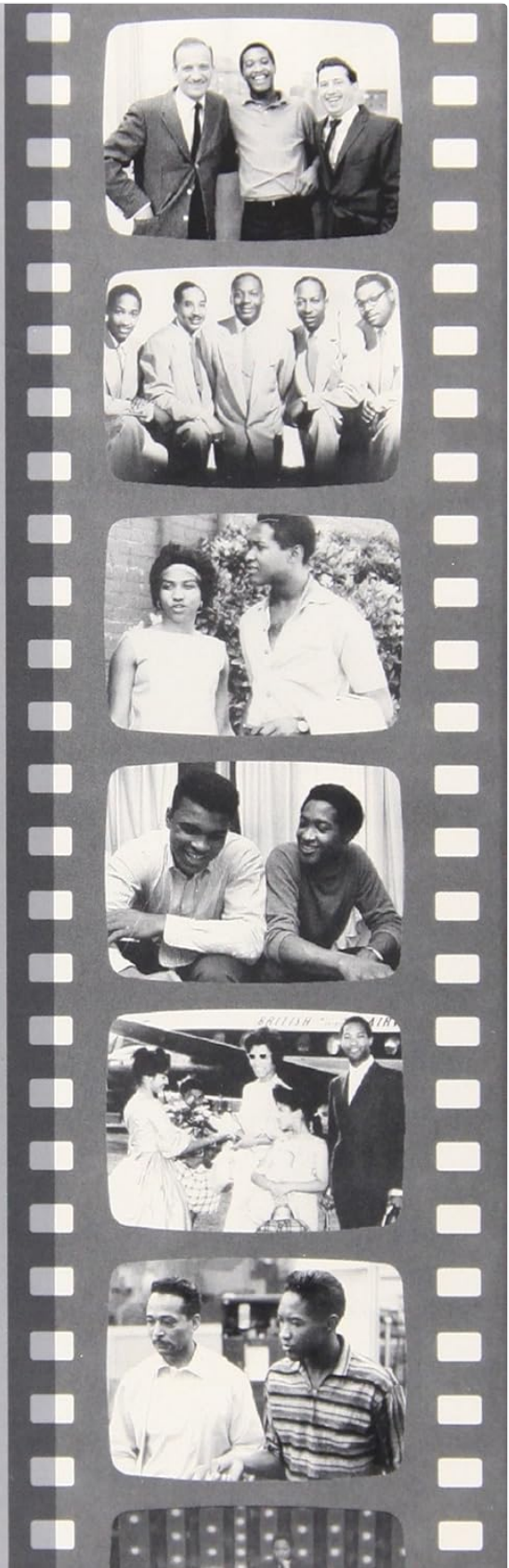
Back cover of the Sam Cooke - Legend DVD case, detailing features, interviews, and technical specifications.

© 2003 ABKCO Music & Records, Inc. and abkco are trademarks of ABKCO Music & Records, Inc. Printed in USA. Warning: All rights reserved. Unauthorized duplication is a violation of applicable laws. Manufactured by ABKCO Music & Records, Inc., 85 Fifth Avenue, New York, NY 10003.