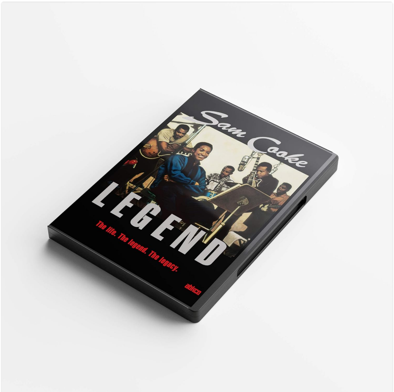
Image of the Sam Cooke - Legend DVD disc, ready for playback.

The main feature has a run time of 1 hour and 10 minutes, with additional interviews totaling approximately 2 hours.