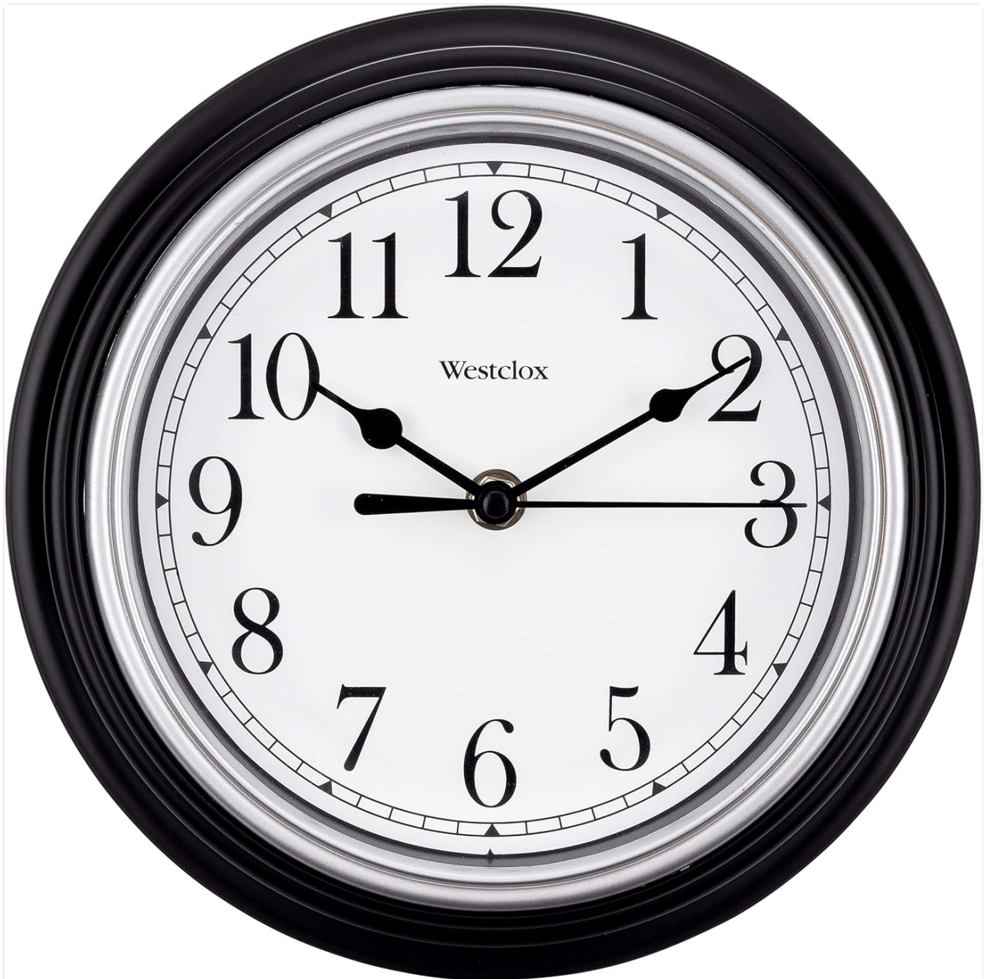
Image 1.1: Front view of the Westclox Quartz Movement Round Wall Clock. This image displays the clock's black frame, white dial, and clear numbering, highlighting its contemporary design.