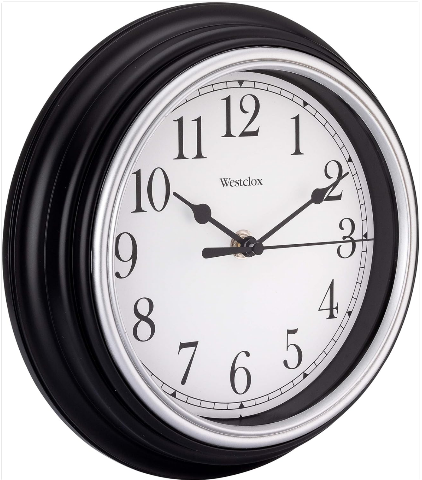
Image 3.1: Angled view of the Westclox Wall Clock. This perspective illustrates the clock's depth and the design of its frame, which houses the quartz movement and battery compartment on the rear.