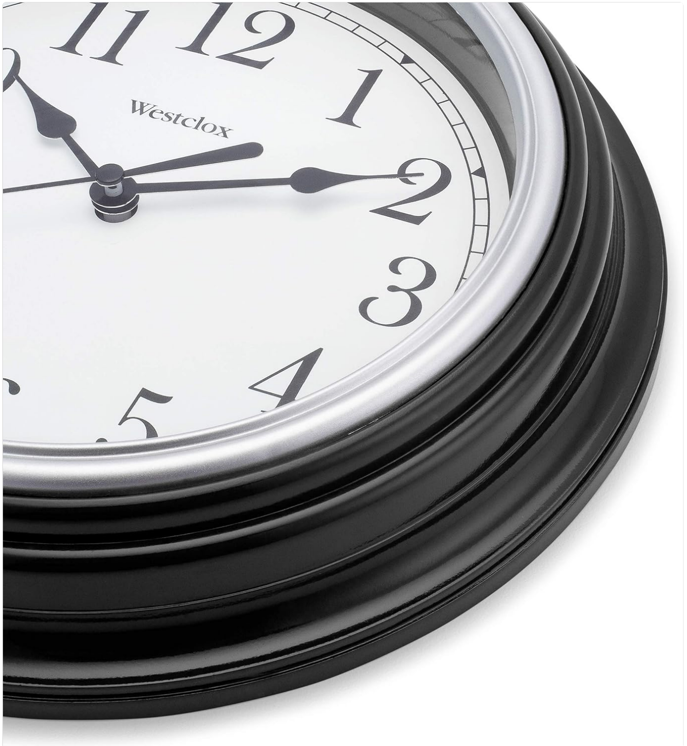
Image 5.1: Close-up of the clock's frame. This image provides a detailed view of the black metal frame, which can be gently wiped clean with a soft cloth.