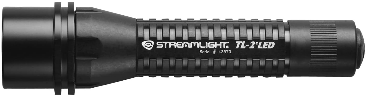
Image: Angled view of the Streamlight 88105 TL-2 LED Tactical Flashlight with an attached lanyard, illustrating its compact size and portability.

Note: Ensure correct battery polarity. Incorrect installation can damage the flashlight. Use only high-quality CR123A lithium batteries.