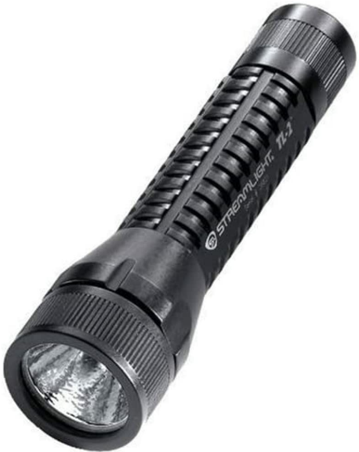
Image: Top view of the Streamlight 88105 TL-2 LED Tactical Flashlight, showcasing its design and branding. Key features include a C4 LED for high brightness, a momentary and constant-on tailcap switch, and a durable aluminum body. The flashlight operates on two 3-volt CR123A lithium batteries.