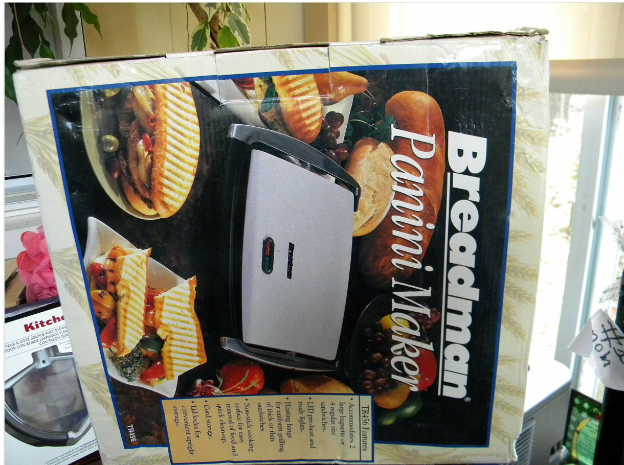
Figure 1: Breadman TR456 Panini Maker product box.

The Breadman TR456 Panini Maker is designed to create delicious grilled sandwiches with ease. Its features ensure even cooking and convenient use.