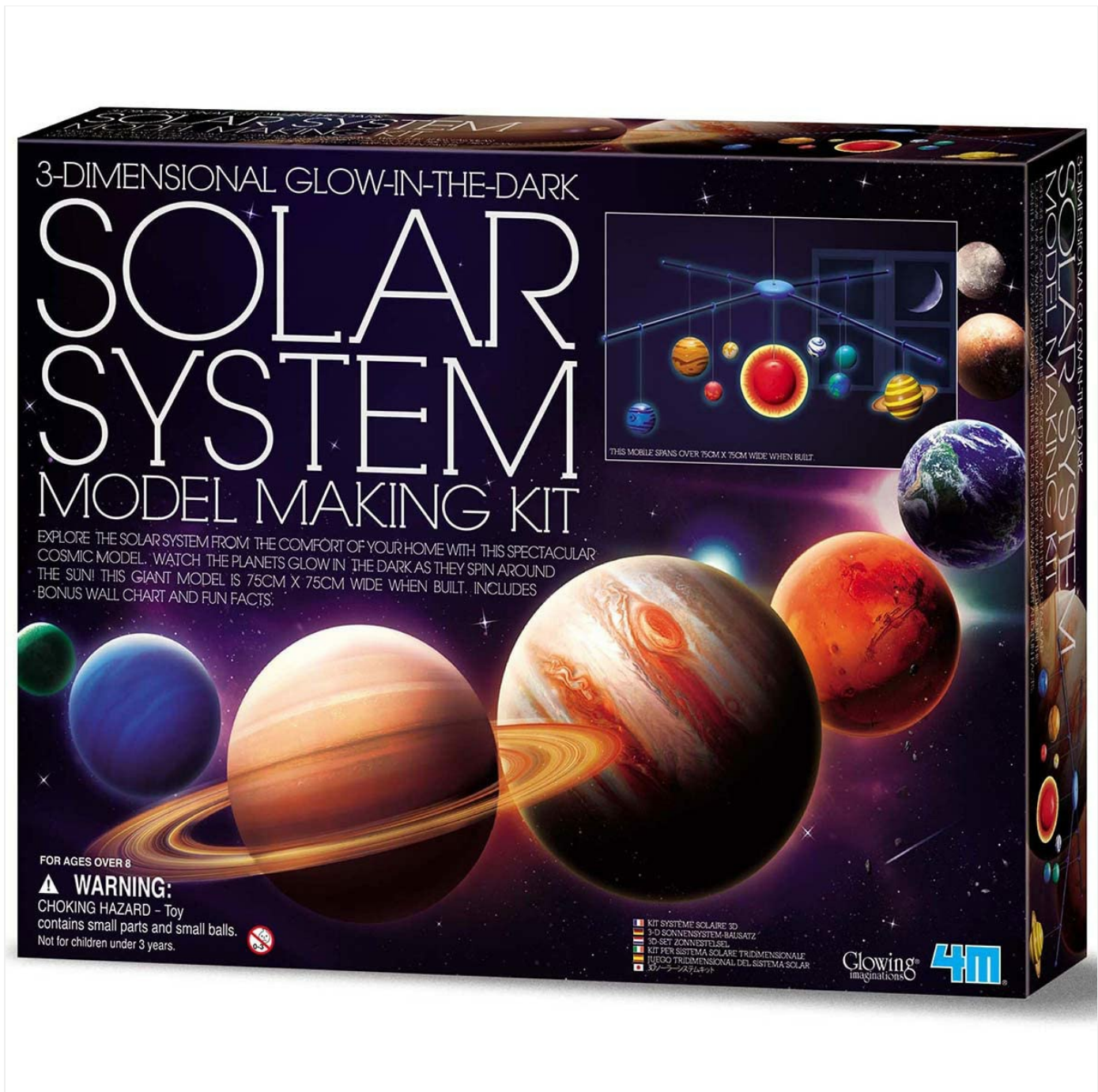
Image: The fully assembled 4M 3D Glow-in-the-Dark Solar System Mobile, showcasing painted planets suspended from a central frame.