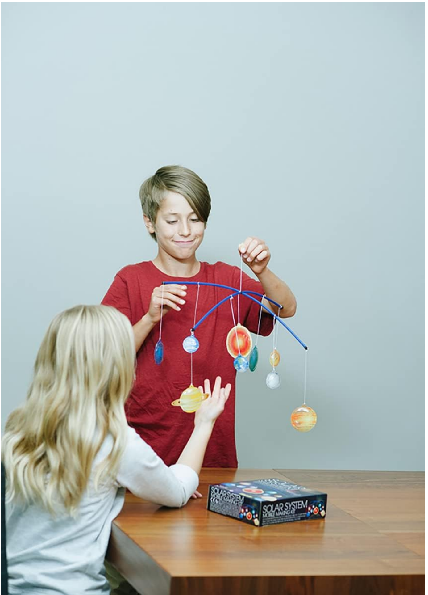
Image: A child reaching towards the hanging planets of the mobile, highlighting its interactive and engaging nature.