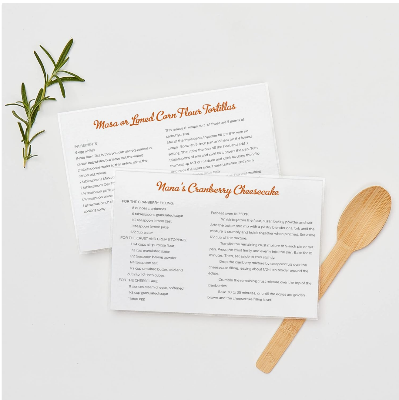
Image 5.2: Laminated recipe cards, illustrating how the sheets protect frequently used items from spills and wear.