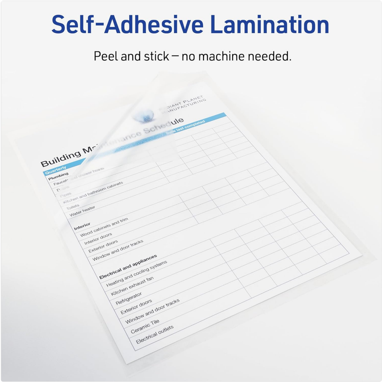
Image 4.1: Demonstrates the process of applying the self-adhesive laminating sheet to a document, showing the clear film being smoothed over the surface.