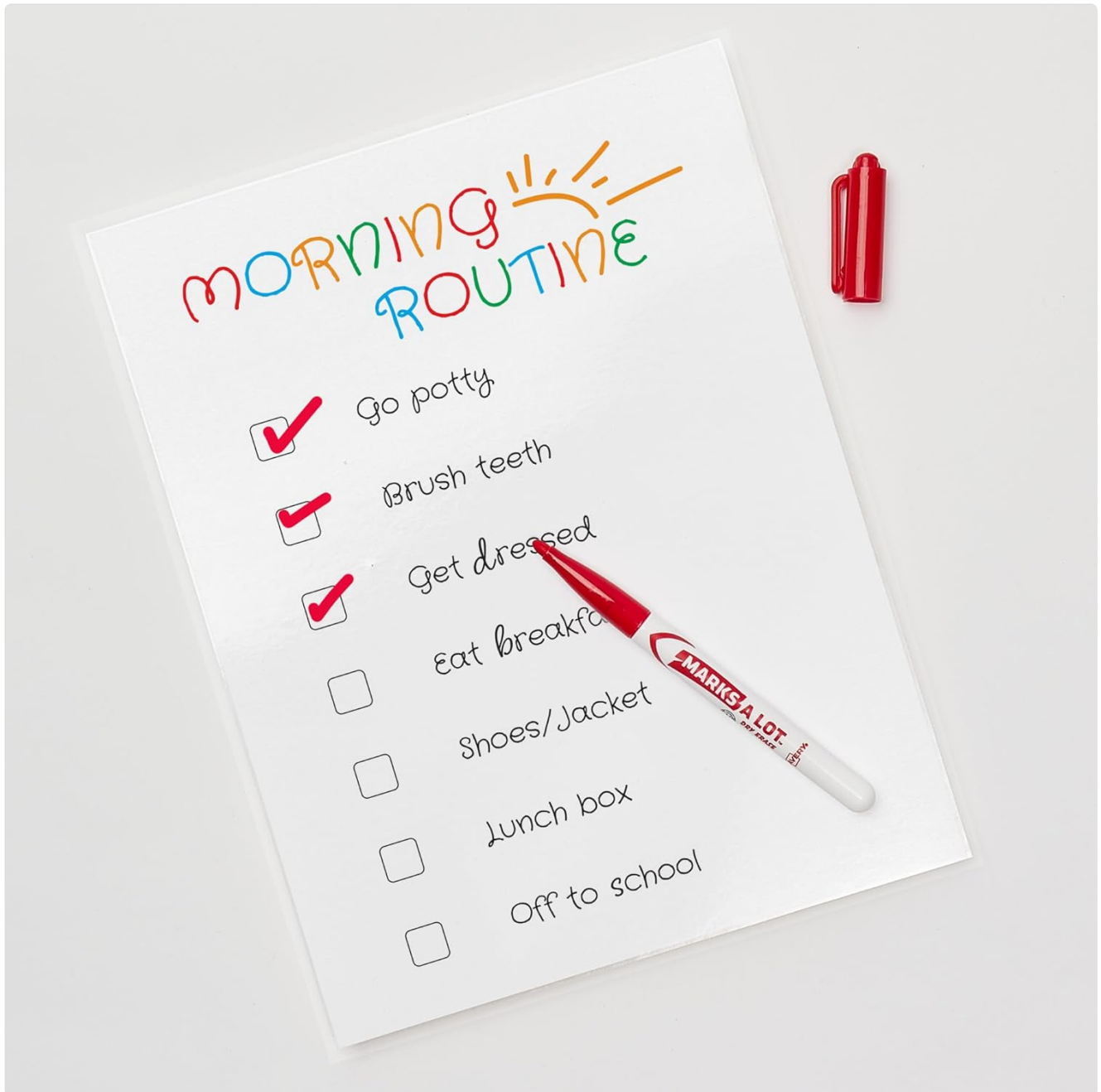
Image 4.2: An example of a laminated "Morning Routine" checklist being used with a dry erase marker, demonstrating the reusability feature.

After lamination, the surface can be used as a dry erase board. Write directly on the laminated sheet with a dry erase marker. To clean, simply wipe with a soft cloth or dry erase eraser.