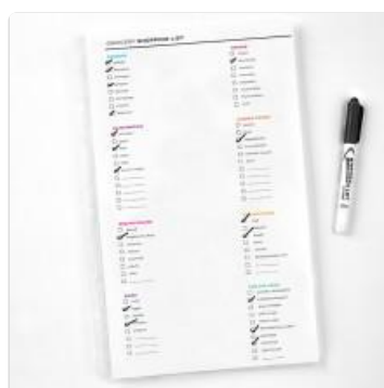
Image 5.5: Laminated items like a baseball schedule and a calendar, highlighting their durability for repeated use.