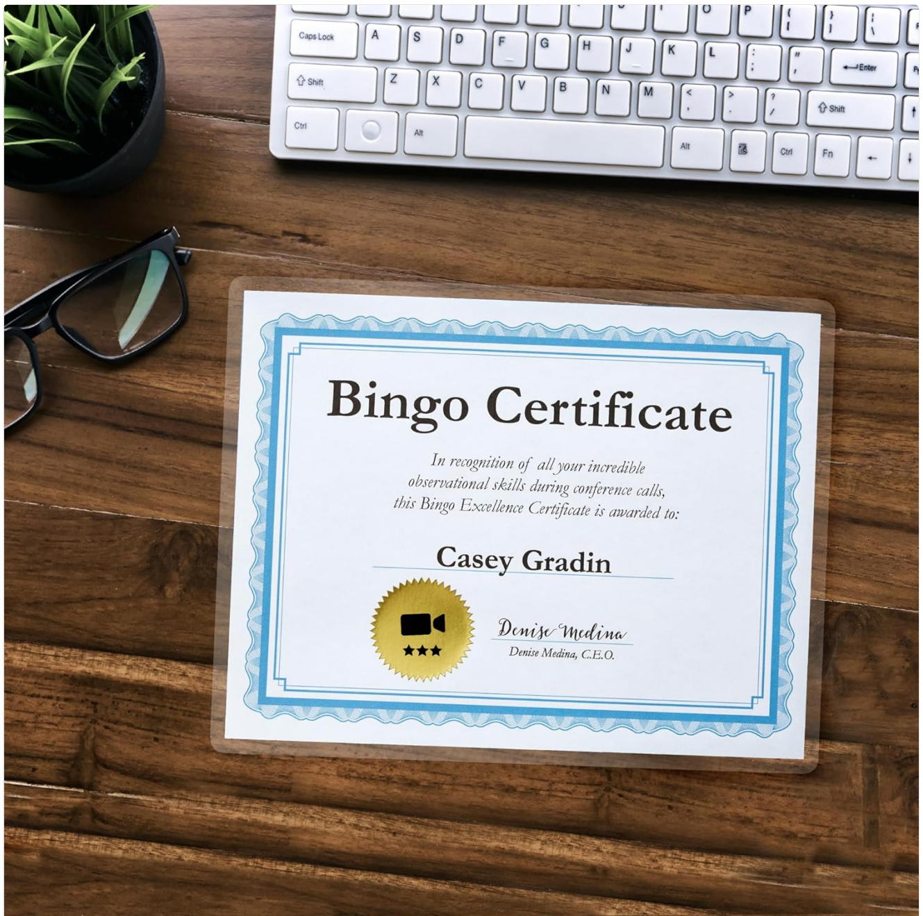
Image 5.1: A laminated certificate, showcasing the clear, protective finish provided by the sheets.