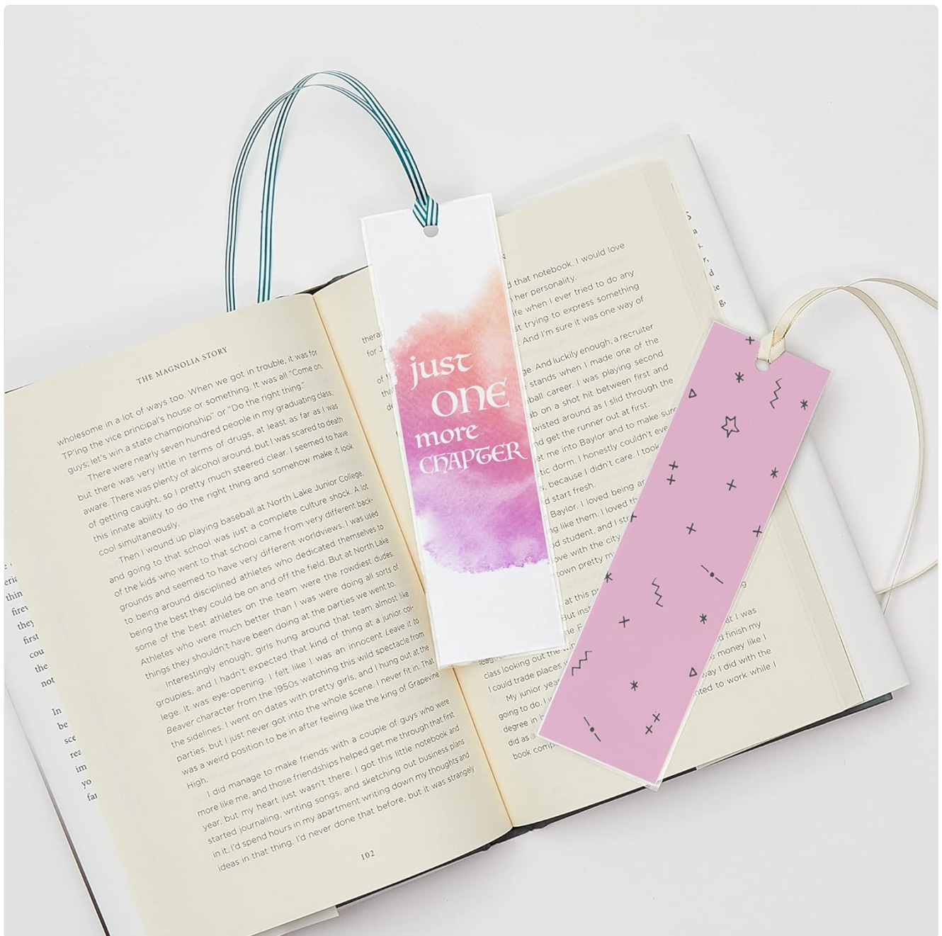
Image 5.3: Laminated bookmarks, demonstrating the versatility of the sheets for various craft and organizational needs.