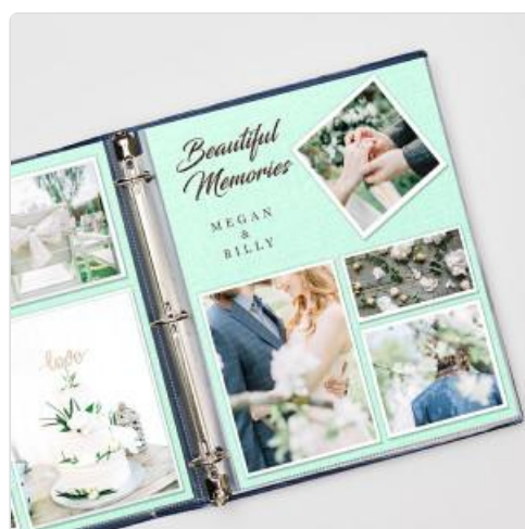
Image 5.6: Laminated photos within a photo album, demonstrating protection for cherished memories.