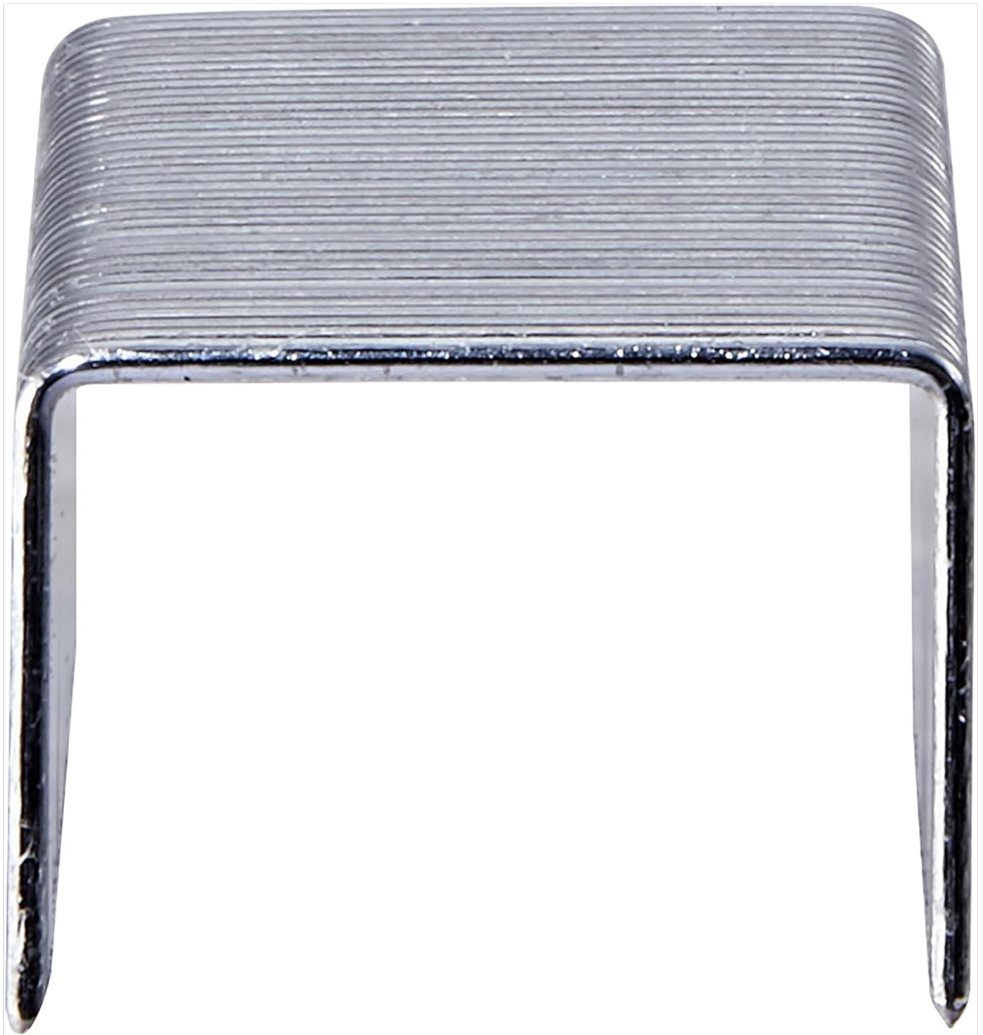
Figure 3: Detailed view of a single Bostitch heavy duty staple, highlighting its U-shape and chisel points.