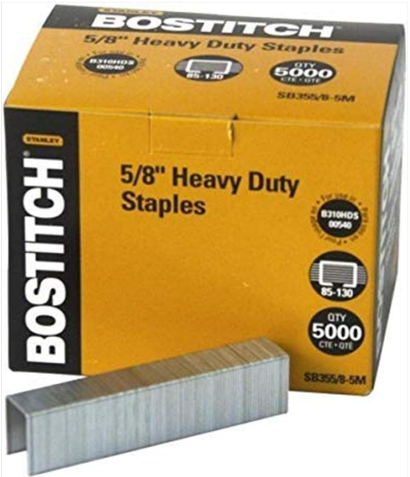
Figure 1: Bostitch 5/8 inch Heavy Duty Staples packaging and a single strip of staples.