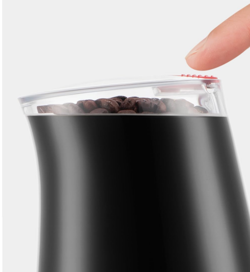
Figure 3.2: Close-up of the durable stainless steel blade and the grinder's compact dimensions (6.9 inches tall, 4.5 inches wide).