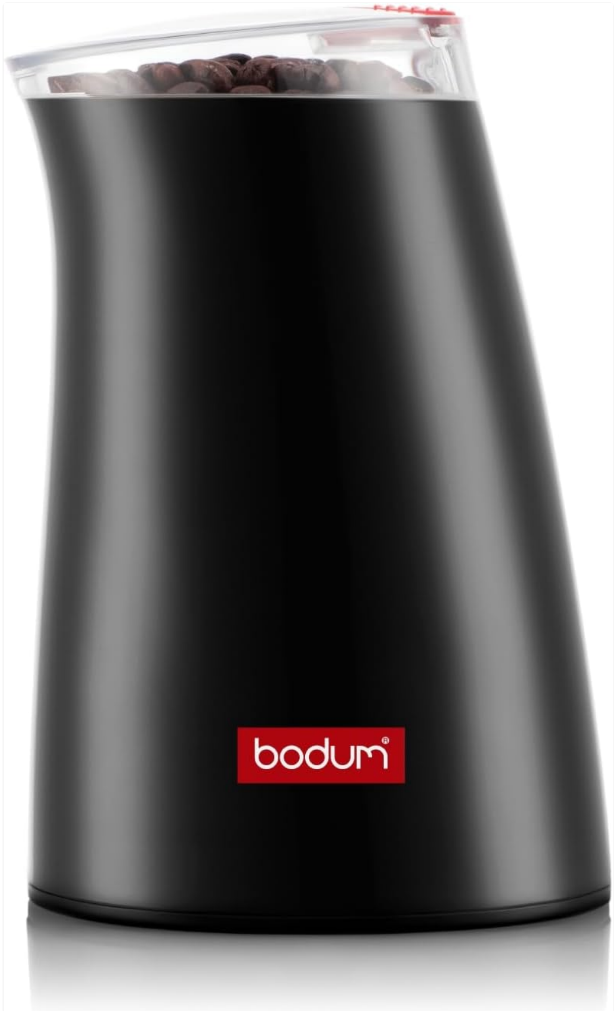
Figure 1.1: The Bodum C-Mill Electric Blade Coffee and Spice Grinder in black, showcasing its sleek design and