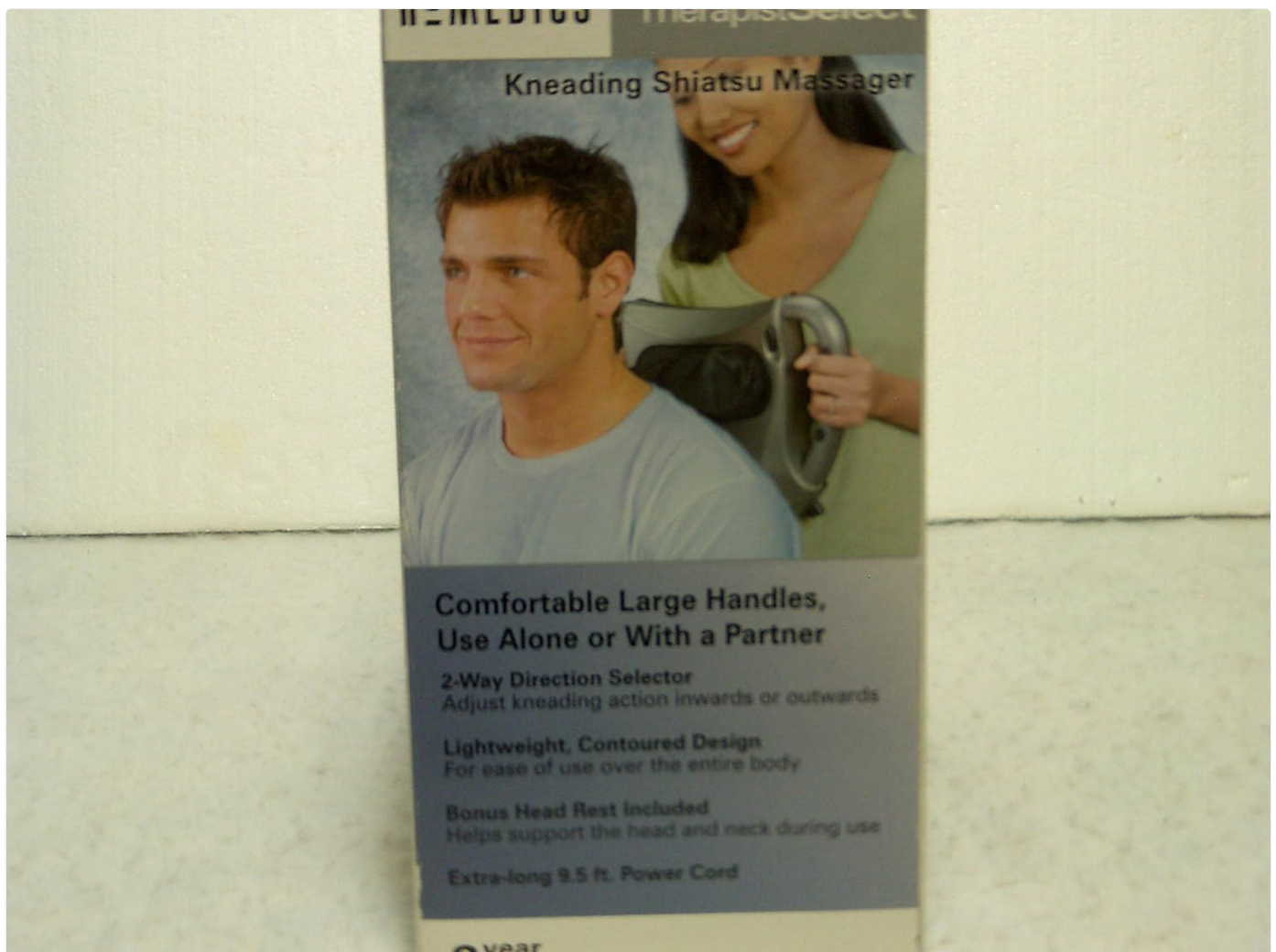
Image: The massager being used on the back, demonstrating how it can be held by a partner for targeted relief.