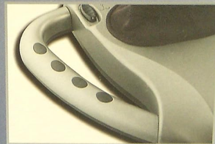
Image: Close-up views of the massager being used on the foot and arm, along with a detail of the comfortable rubberized handles.

Comfortable Large Handles With rubberized pads for easy grip