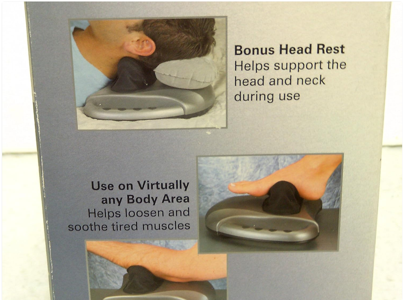
Image: The massager demonstrating versatile use on the neck with the headrest, on the foot, and on the arm.