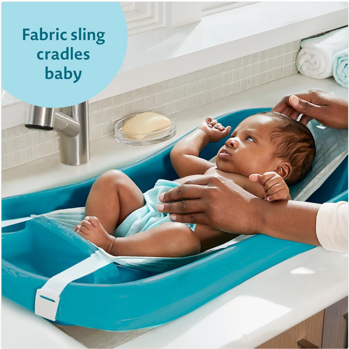
Image: A newborn baby resting comfortably in the fabric sling within the bath tub, demonstrating the sling's supportive function.