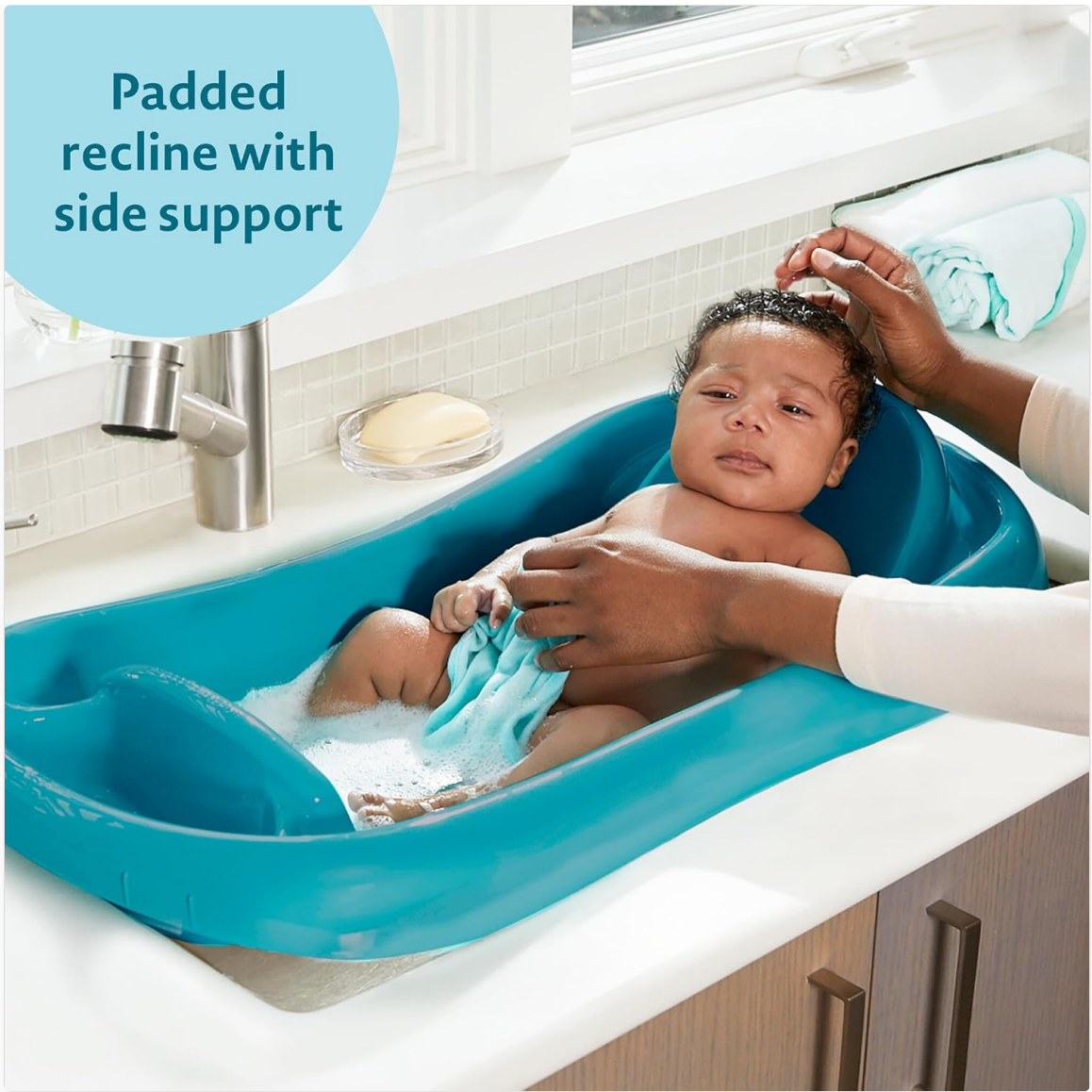
Image: An infant in the reclined section of the tub, highlighting the padded recline and side support for older babies.