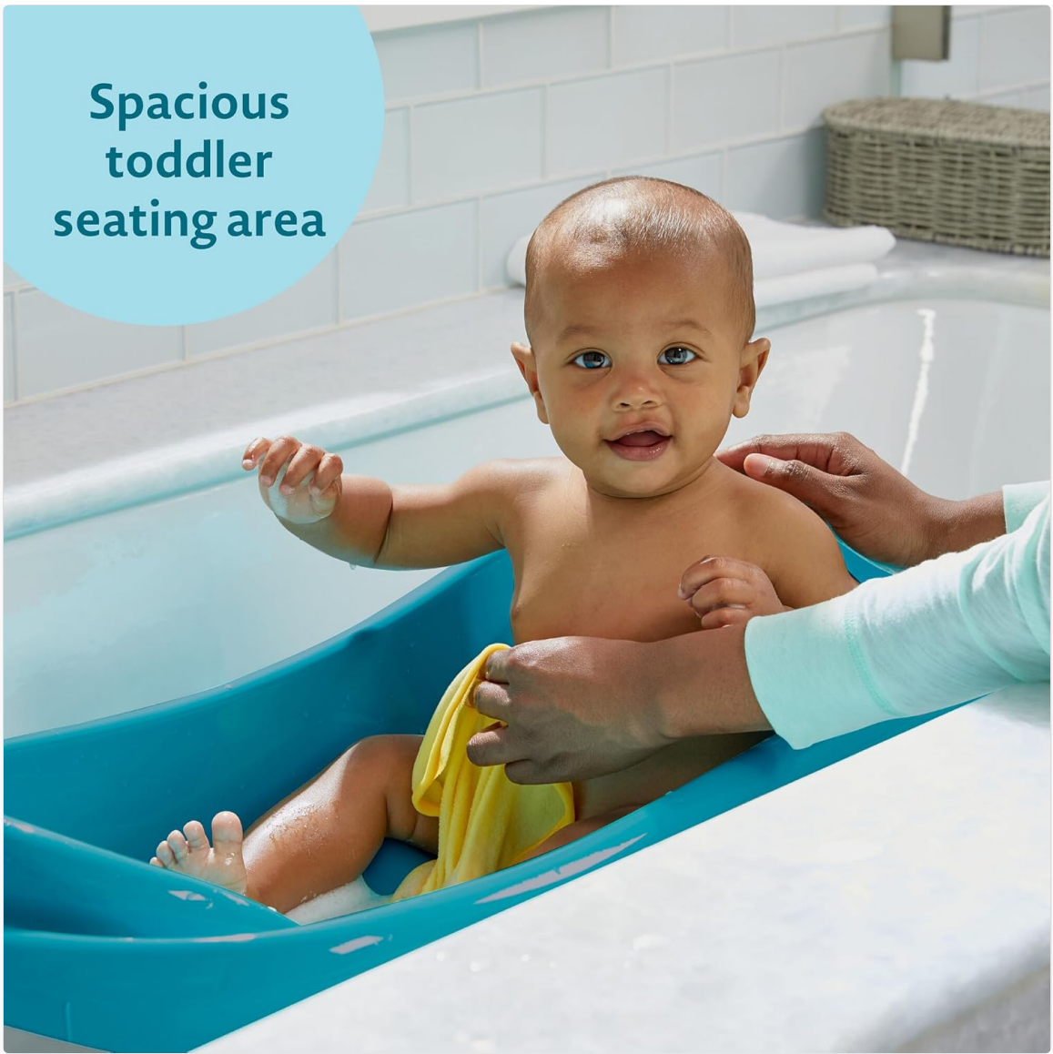
Image: A toddler sitting comfortably in the spacious toddler seating area of the bath tub, ready for playtime.