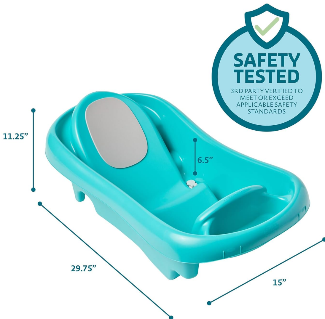
Image: Product dimensions for the bath tub, indicating length, width, and height.