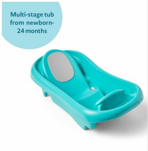
Image: Multi-stage view of the Sure Comfort tub, illustrating its use for newborns (0-4 months), infants (4-9 months), and toddlers (9-24 months).