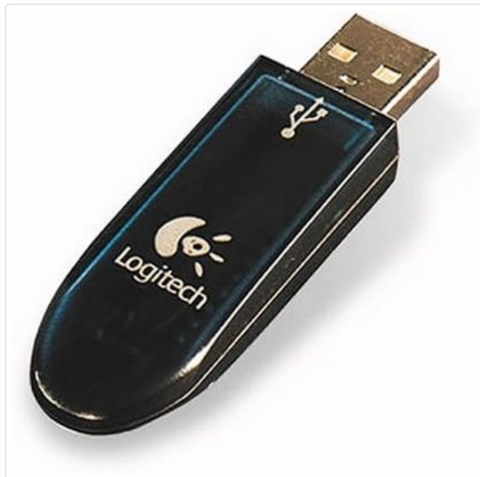
Figure 3: The compact USB Bluetooth Receiver, which connects the presenter to your computer.

The USB Bluetooth Receiver facilitates wireless communication between the presenter and your computer. It is a dedicated receiver and may not be compatible with other Bluetooth devices.