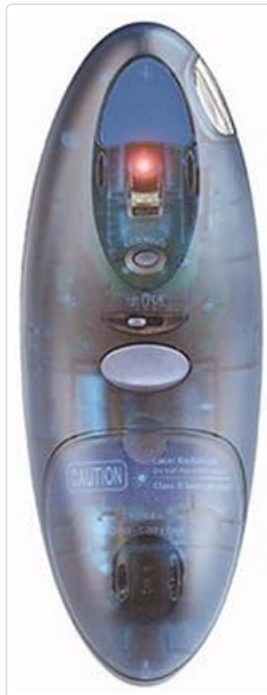
Figure 2: Bottom view of the Logitech Cordless Presenter, showing the optical sensor, laser emitter, and battery compartment.

The Logitech Cordless Presenter features an ergonomic design for comfortable handling. It includes buttons for slide navigation, a laser pointer, and a switch to toggle between presentation and mouse modes.