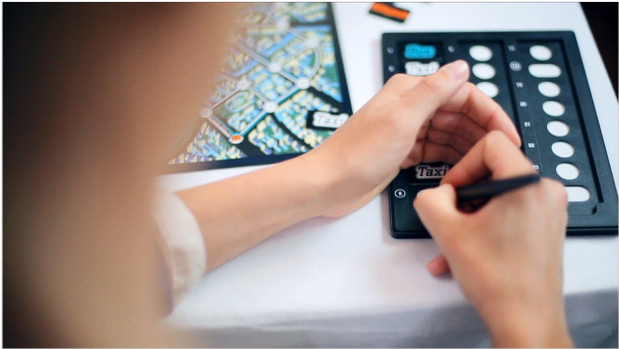
Image: Mister X's Logbook. This image shows a hand using a pencil to record a move in Mister X's logbook, demonstrating the secret tracking mechanism for the fugitive.