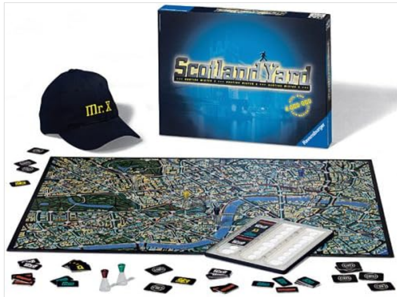
Image: Game Components. This image displays the various components included in the Scotland Yard game, such as the game board, playing pieces, logbook, and travel tickets, laid out for inspection.