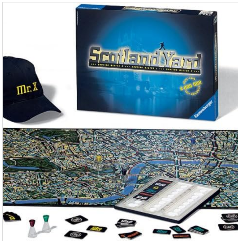
Image: Game Setup. A player is shown placing game pieces onto the London map game board, illustrating the initial setup phase of Scotland Yard.