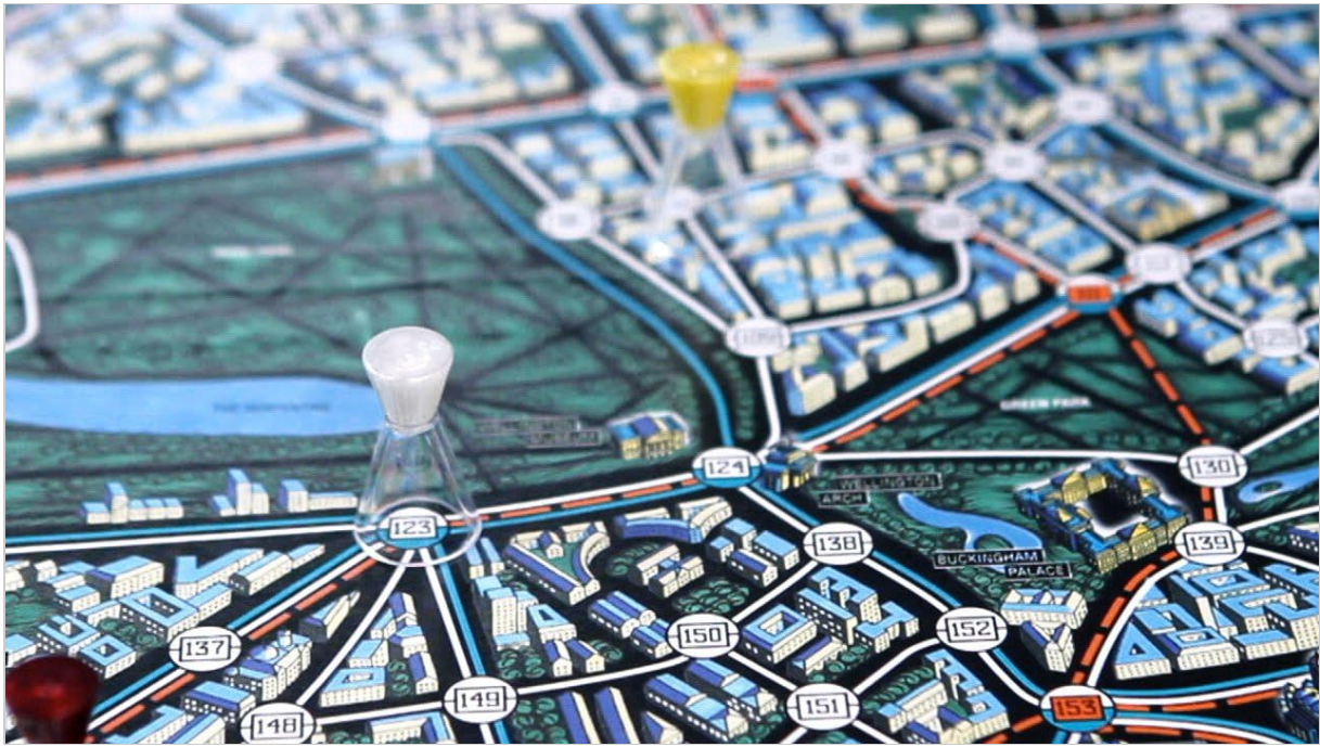
Image: Game Board in Play. A close-up view of the Scotland Yard game board with several playing pieces positioned on various numbered stations, demonstrating active gameplay.