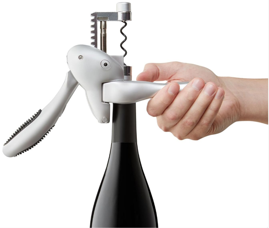
Image 2: The corkscrew is placed over the wine bottle, ready for operation.