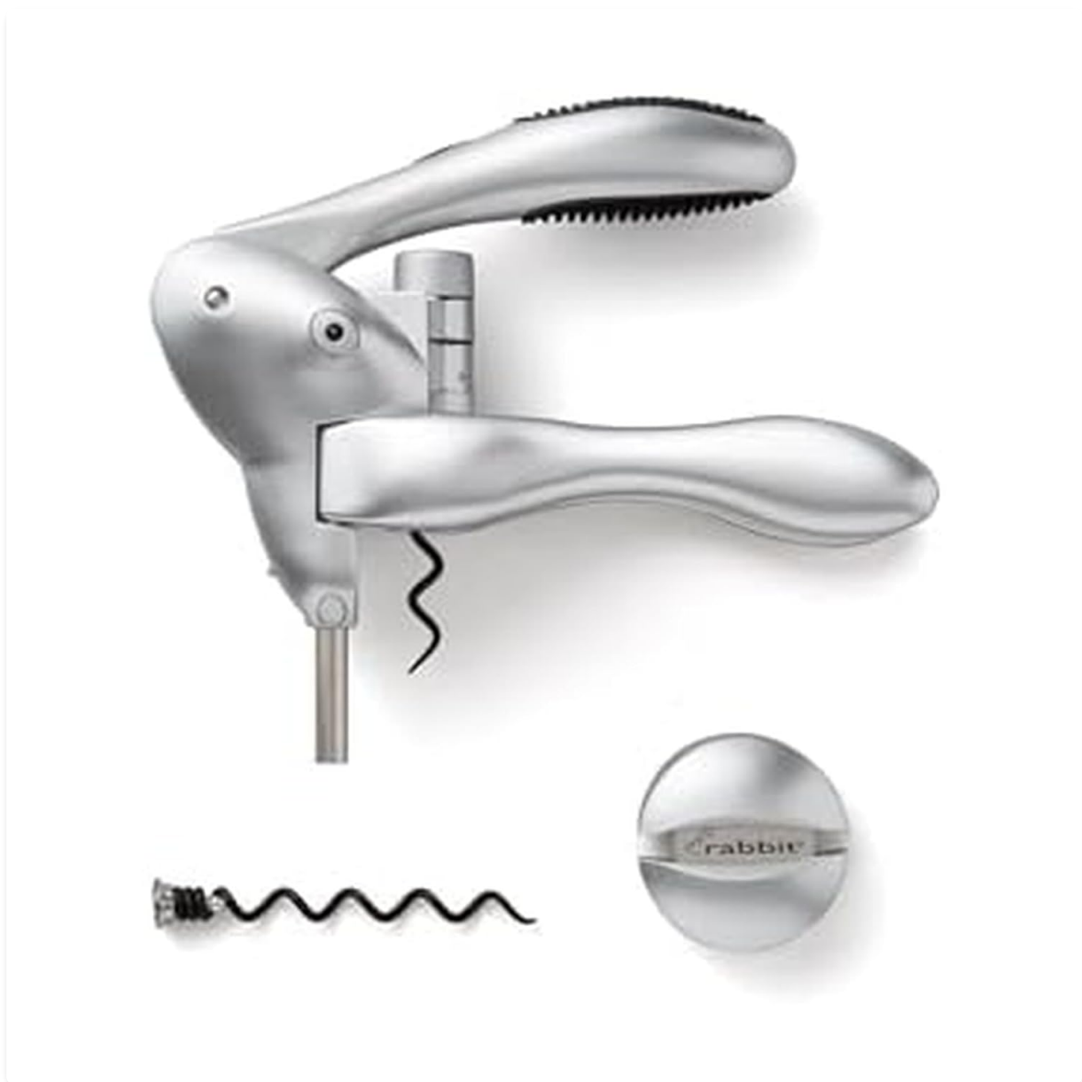
Image 1: The Rabbit Original Lever Corkscrew Wine Opener, including the main unit, a spare spiral, and the foil cutter.