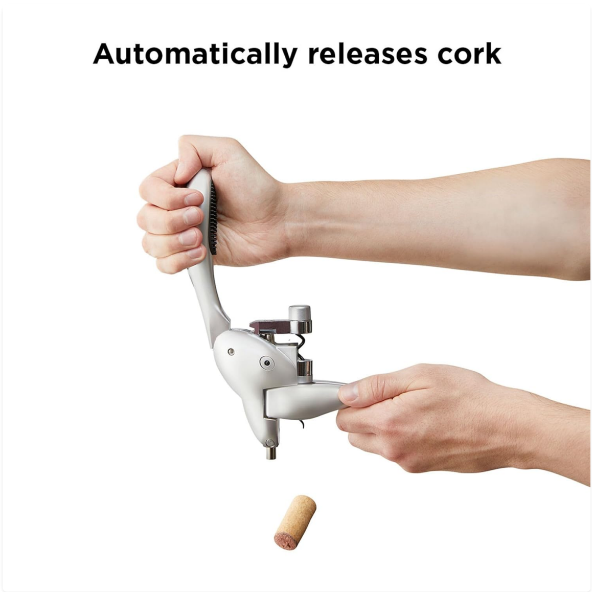
Image 3: The cork is automatically released from the corkscrew after extraction.