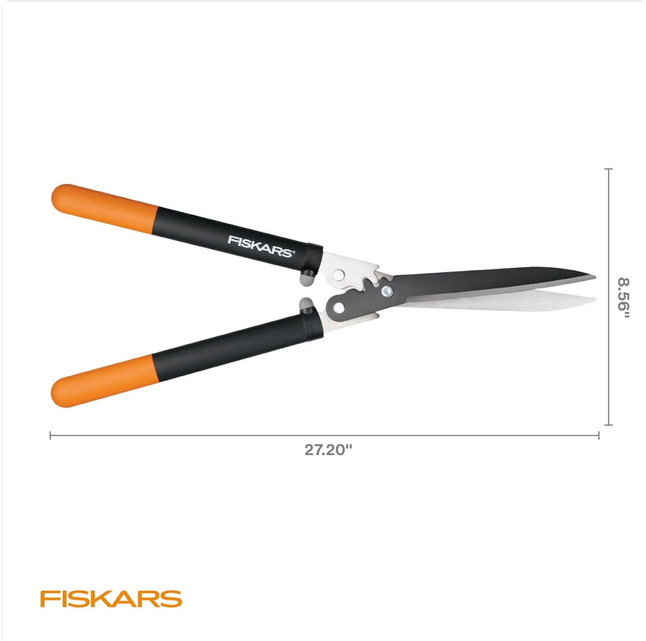
Image 3.1: The Fiskars PowerGear Hedge Shears with the protective blade cover removed, showcasing the sharp blades.