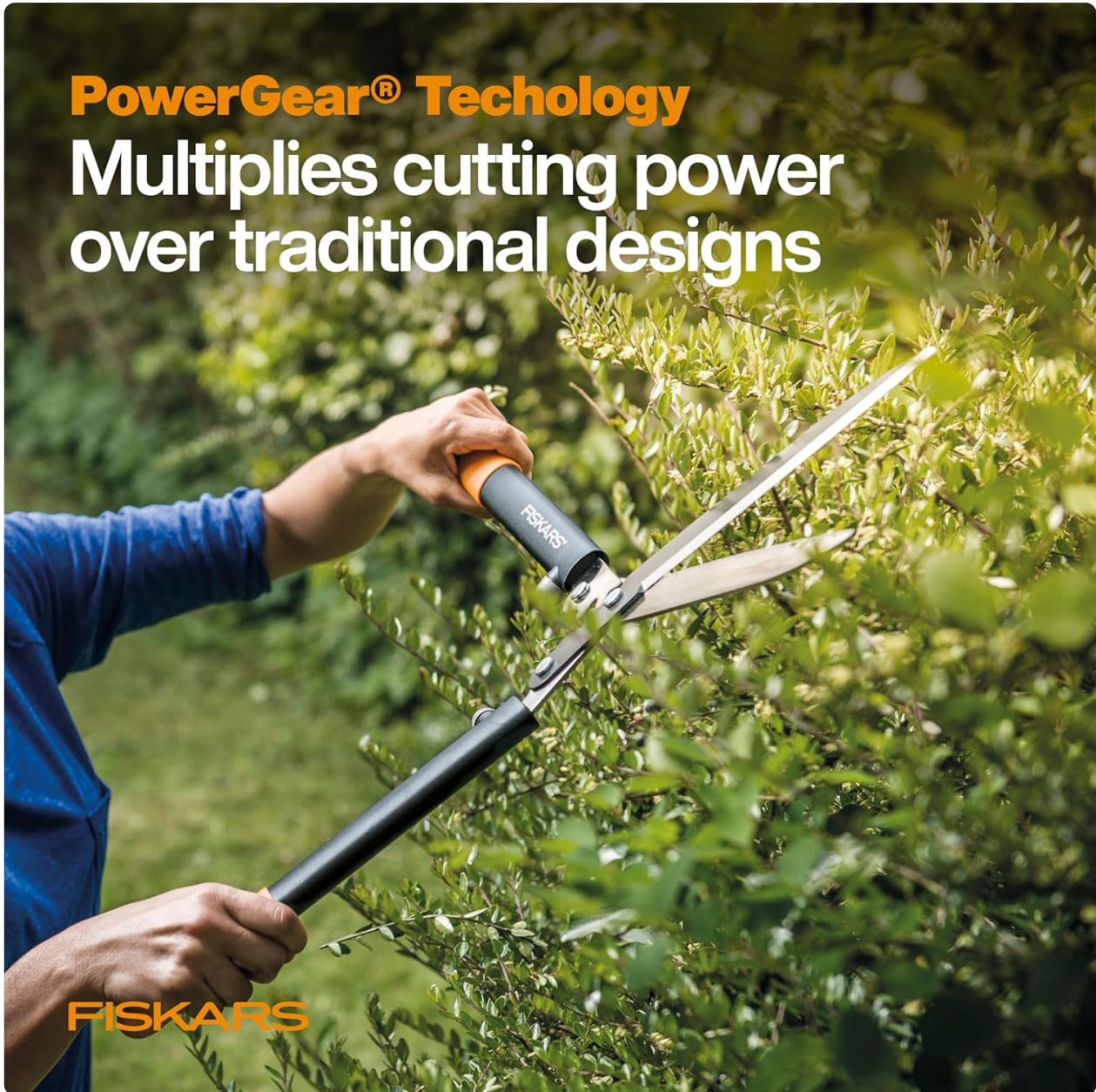
Image 4.1: A user demonstrating the cutting action of the Fiskars PowerGear Hedge Shears on a dense bush.

Your browser does not support the video tag.