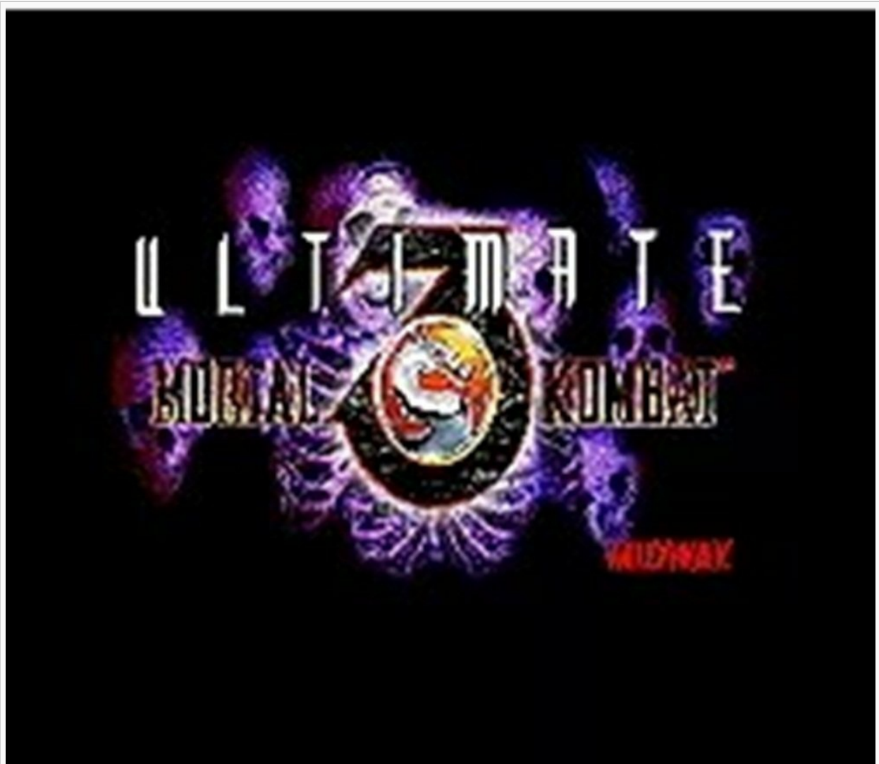
Image 2: The title screen for Ultimate Mortal Kombat 3. The image displays the game's logo "Ultimate Mortal Kombat" with a stylized dragon emblem, set against a dark background with skull imagery.