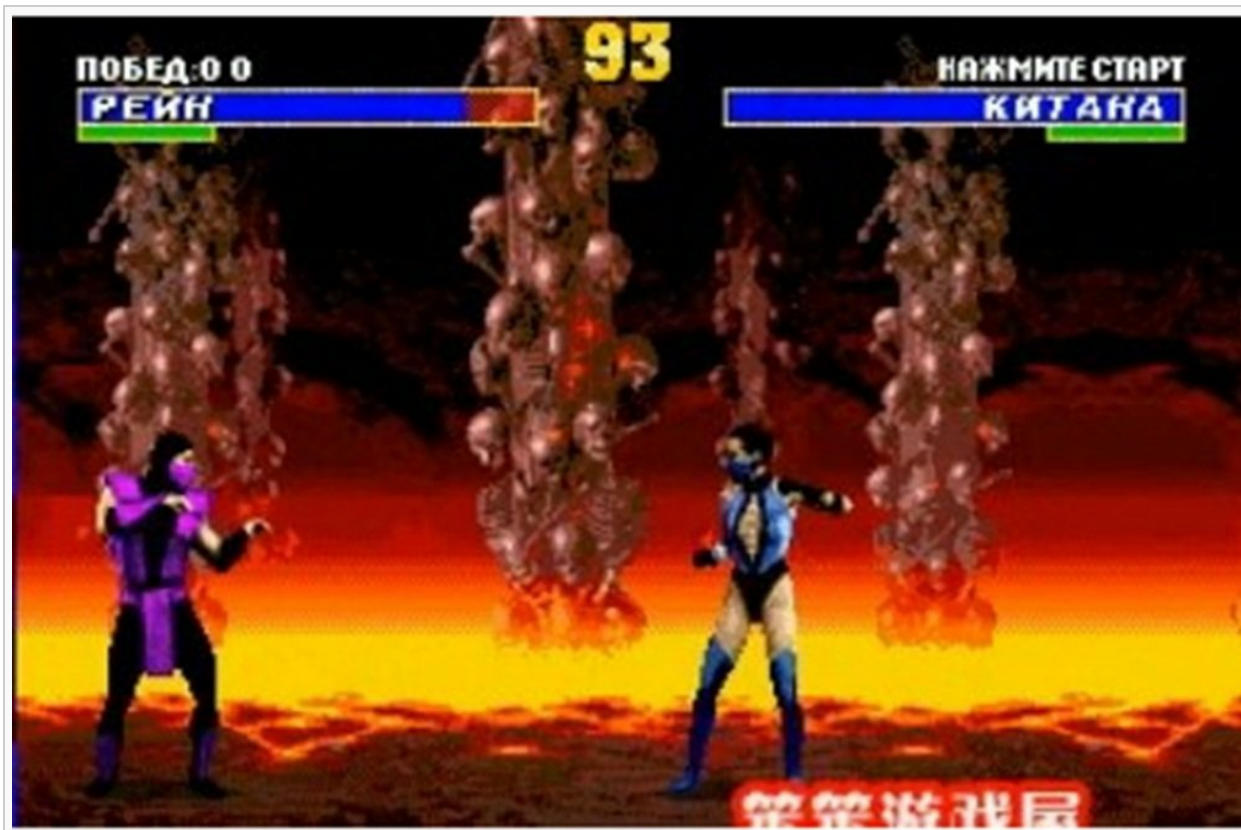
Image 3: An in-game screenshot from Ultimate Mortal Kombat 3. Two characters, Rain and Kitana, are engaged in combat on a fiery stage with skull pillars. The game's user interface, including health bars and score, is visible at the top.