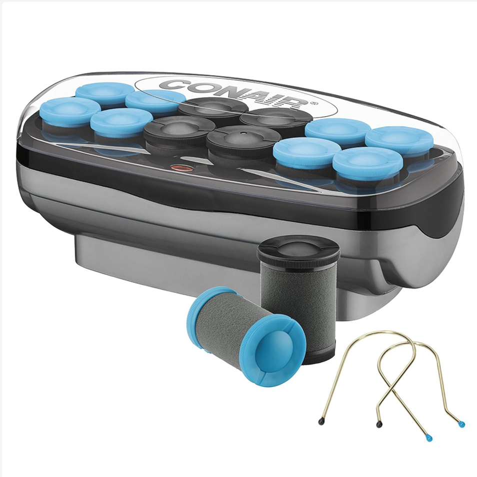
Image: Conair Ceramic Hot Rollers set, showcasing the heating unit, rollers, and wire pins.

The Conair Ceramic 1 1/2-inch and 1 3/4-inch Hot Rollers are designed to provide voluminous curls and waves quickly and easily. This set includes 12 ceramic-flocked rollers and wire pins for secure styling. The ceramic-infused technology ensures even heat transfer for long-lasting results, making it a convenient tool for achieving salon-style curls at home.