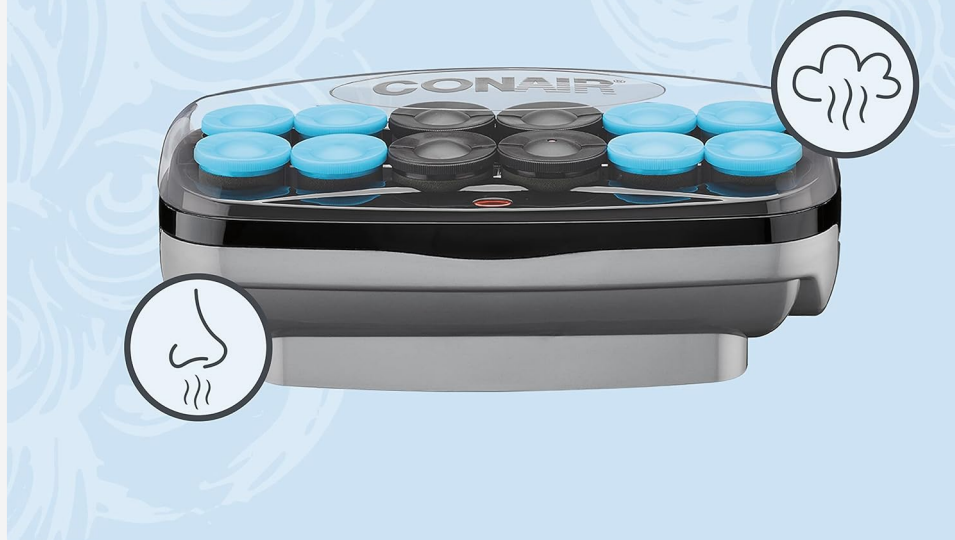
Image: Visual guide on what to expect during the first use, including potential smell and smoke.

Initial heat-up may produce a smoking effect with a faint plastic smell. This is a normal part of the heating process that happens only the first time you use the rollers.