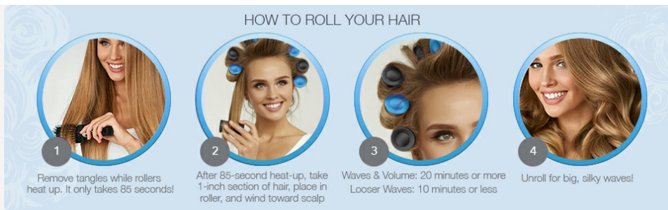
Image: Step-by-step visual instructions on how to roll your hair for waves and volume.