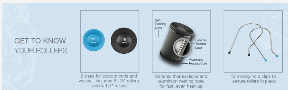
Image: Components of the Conair Hot Rollers set, detailing roller sizes, internal structure, and wire clips.