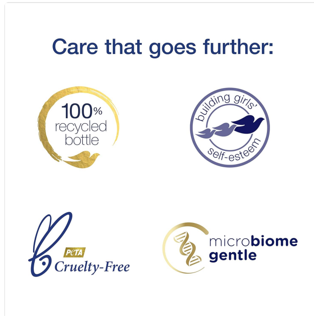
Image: Visual representation of Dove's brand commitments, including a 100% recycled bottle, support for building girls' self-esteem, PETA Cruelty-Free certification, and a microbiome gentle formula.