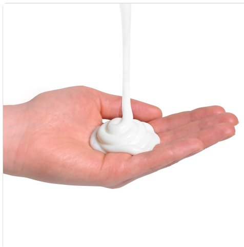
Image: A stream of white, creamy body wash being dispensed from the bottle onto an open palm.