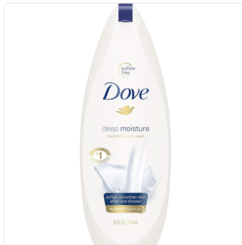
Image: Front view of the Dove Deep Moisture Body Wash bottle, highlighting its "sulfate free" and "deep moisture" claims, along with the "#1 Dermatologist Recommended" badge and "12 FL.OZ./354mL" volume.

This product is part of Dove's commitment to helping individuals develop a positive relationship with their appearance, fostering self-esteem and realizing full potential.