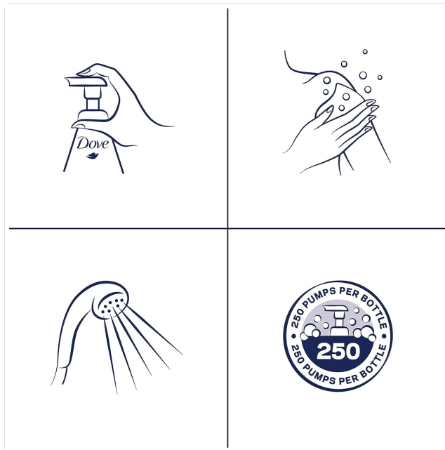
Image: A four-panel illustration demonstrating the usage steps: squeezing the bottle, applying lather to skin, rinsing with a showerhead, and a circular icon indicating approximately 250 pumps per bottle.