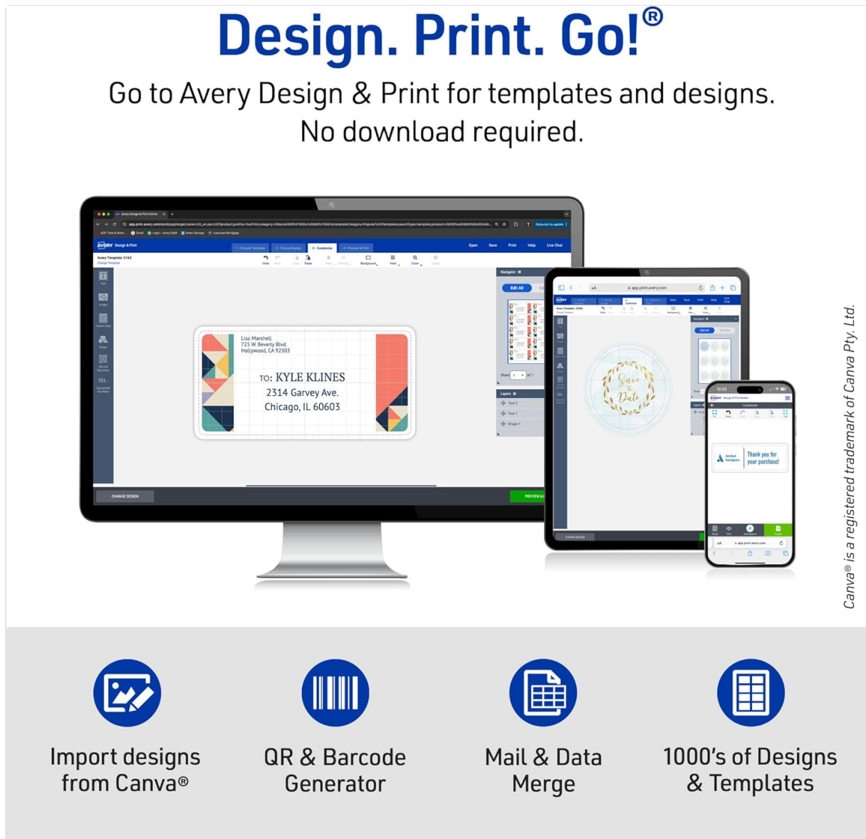
Figure 3.2: The 'Design. Print. Go!' interface for Avery Design & Print Online.