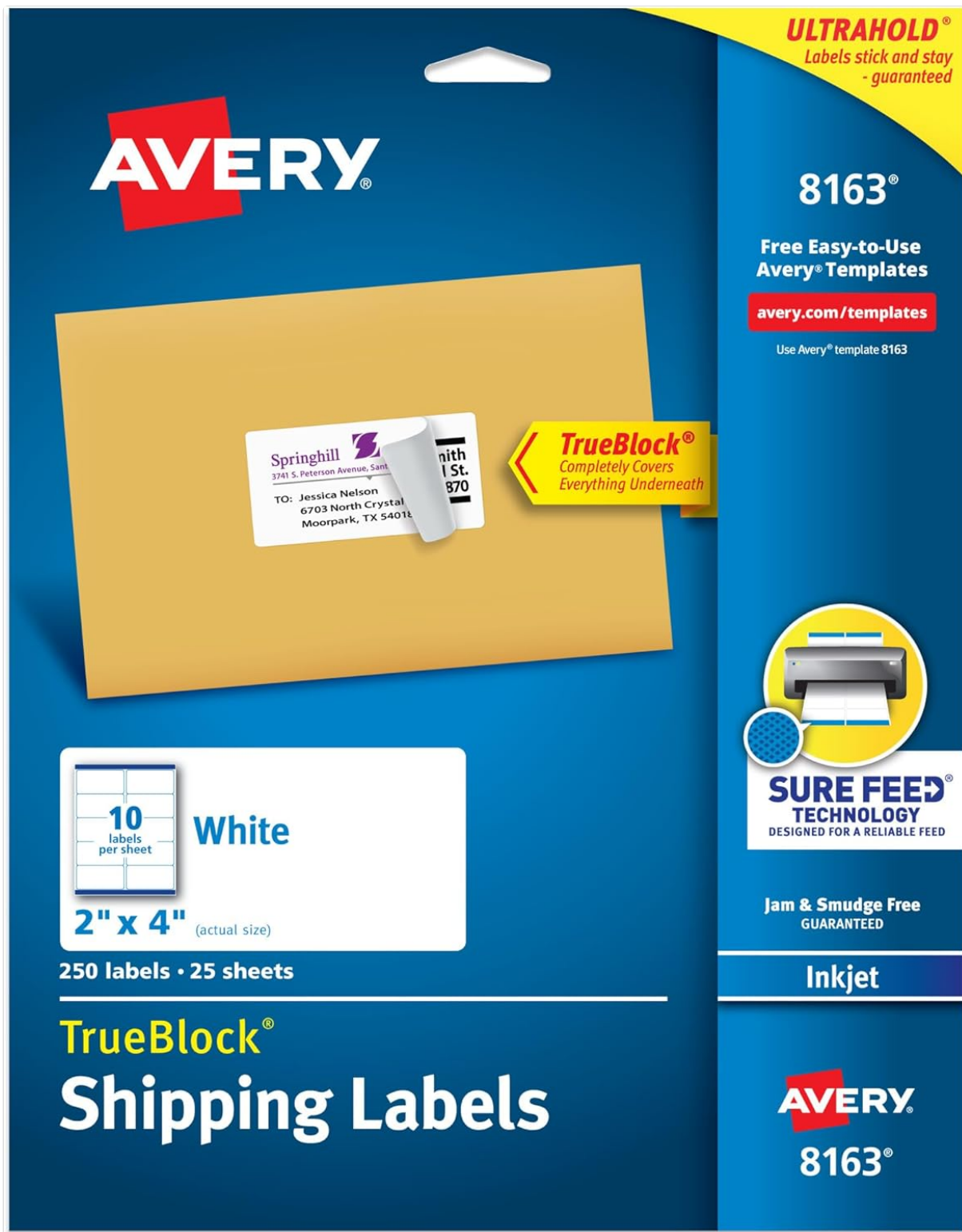
Figure 1.1: Avery 8163 Shipping Labels Product Packaging