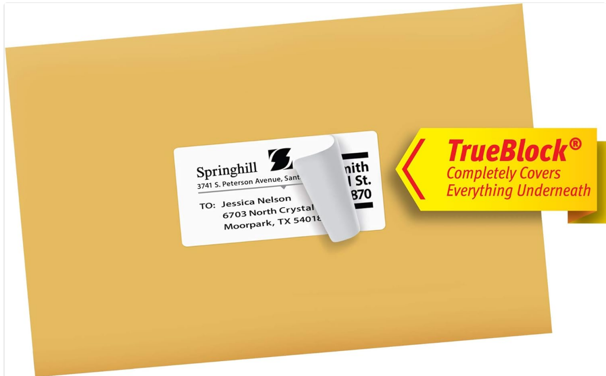
Figure 2.2: TrueBlock Technology in action, demonstrating how the label completely covers underlying text.

TrueBlock technology completely blocks out everything underneath the label. This allows you to cover existing markings, correct errors, safeguard sensitive information, or reuse old boxes by concealing previous labels without show-through.