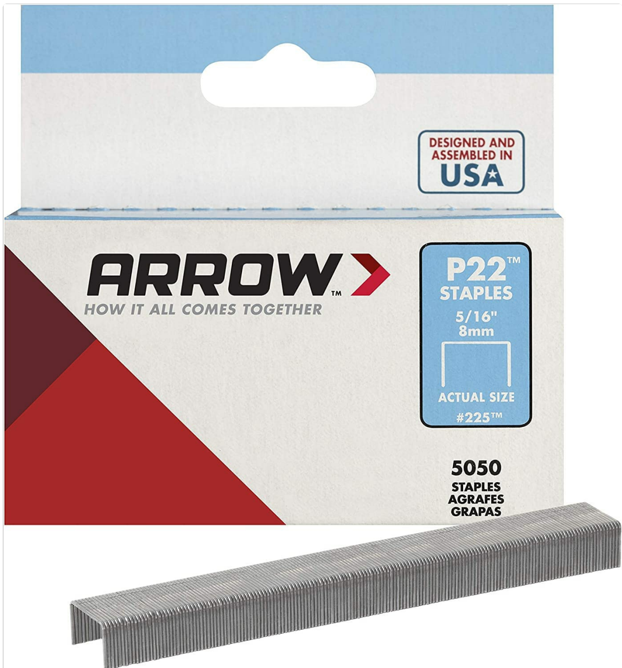
Image: A pack of Arrow 225 Heavy Duty P22 Staples, showing the quantity and packaging.