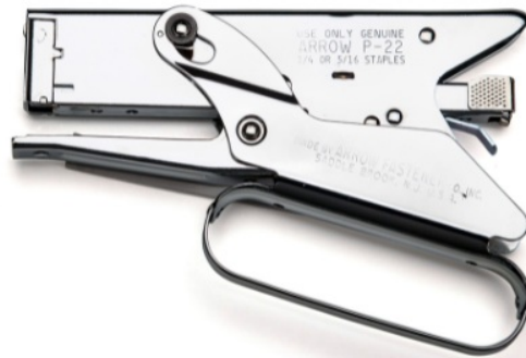
Image: A diagram showing the P22 plier stapler, illustrating its design for staple loading.

P22 staples are designed to work with the P22 Arrow Plier Stapler.