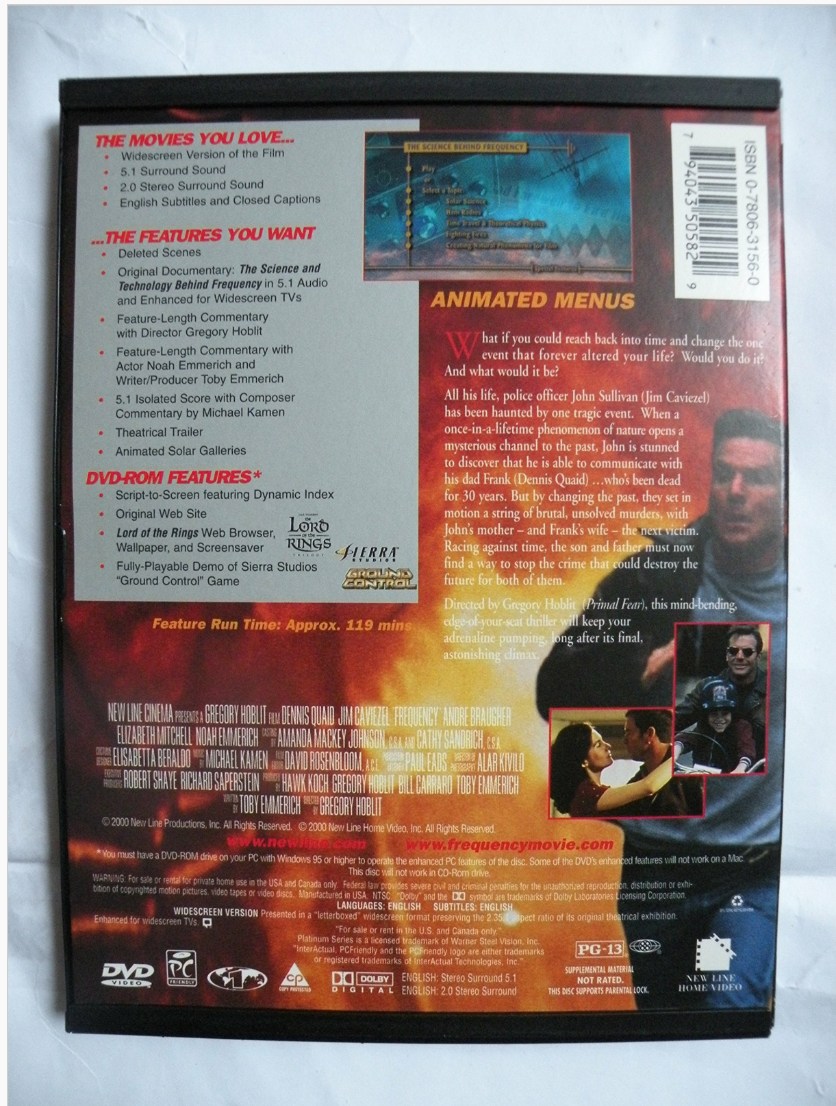
Image 4.1: Back cover of the Frequency DVD. This image lists the special features, including audio options, deleted scenes, and commentaries, along with a brief synopsis of the film.

The Frequency DVD includes a variety of special features to enhance your viewing experience: