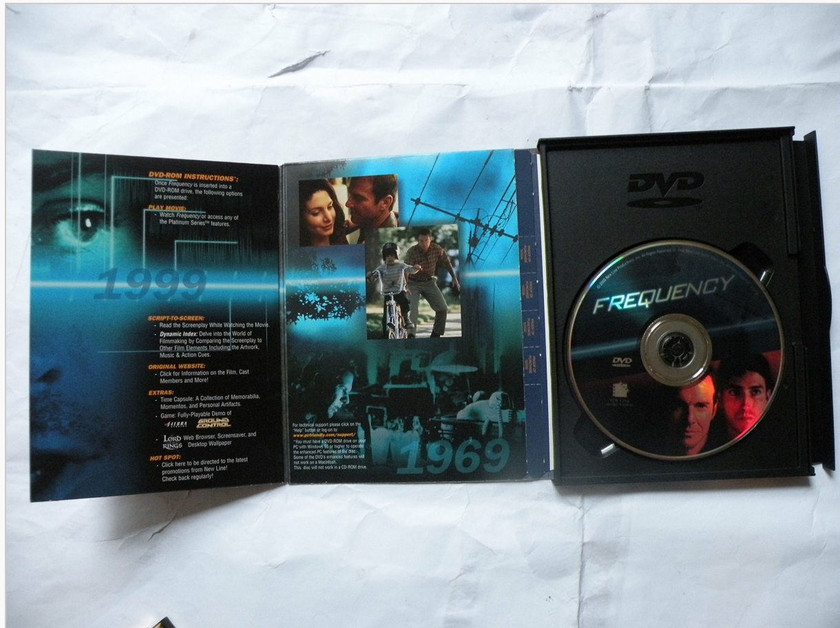
Image 4.2: Inside view of the Frequency DVD case with DVD-ROM instructions. This panel provides guidance on accessing computer-based features and shows stills from the movie.

For users with a compatible DVD-ROM drive on a computer, additional features may be accessible: